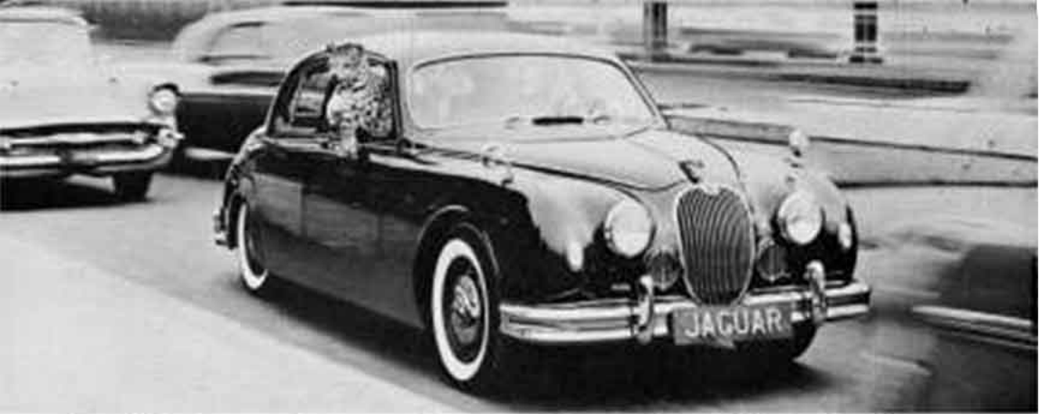
3.4 SPORTS SEDAN-An entirely new experience on the road. Call it the ultimate luxury in a sports car, or sports car performance in a 4-door sedan. A family sedan, with the unique features which have scored Jaguar wins in competitions the world over.