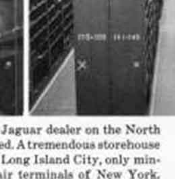
Prompt parts service to any Jaguar dealer on the North American continent is ensured. A tremendous storehouse of Jaguar parts is located in Long Island City, only minutes away from the major air terminals of New York.