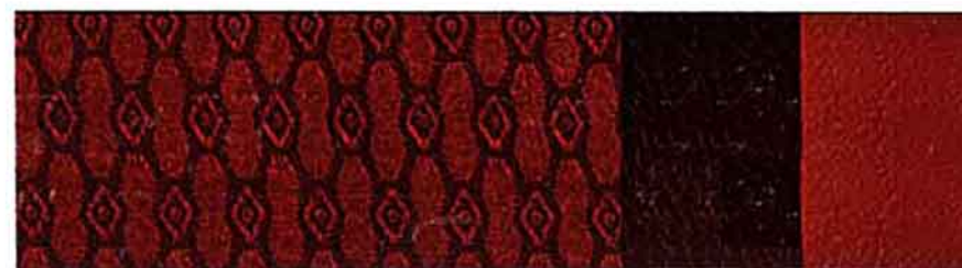
Pattern cloth and vinyl in red.

Select fawn, red or blue, depending on specific exterior color selected.*