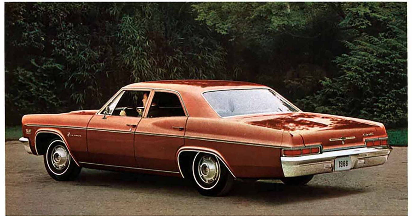
Impala 4-Door Sedan in Artec Bronze.