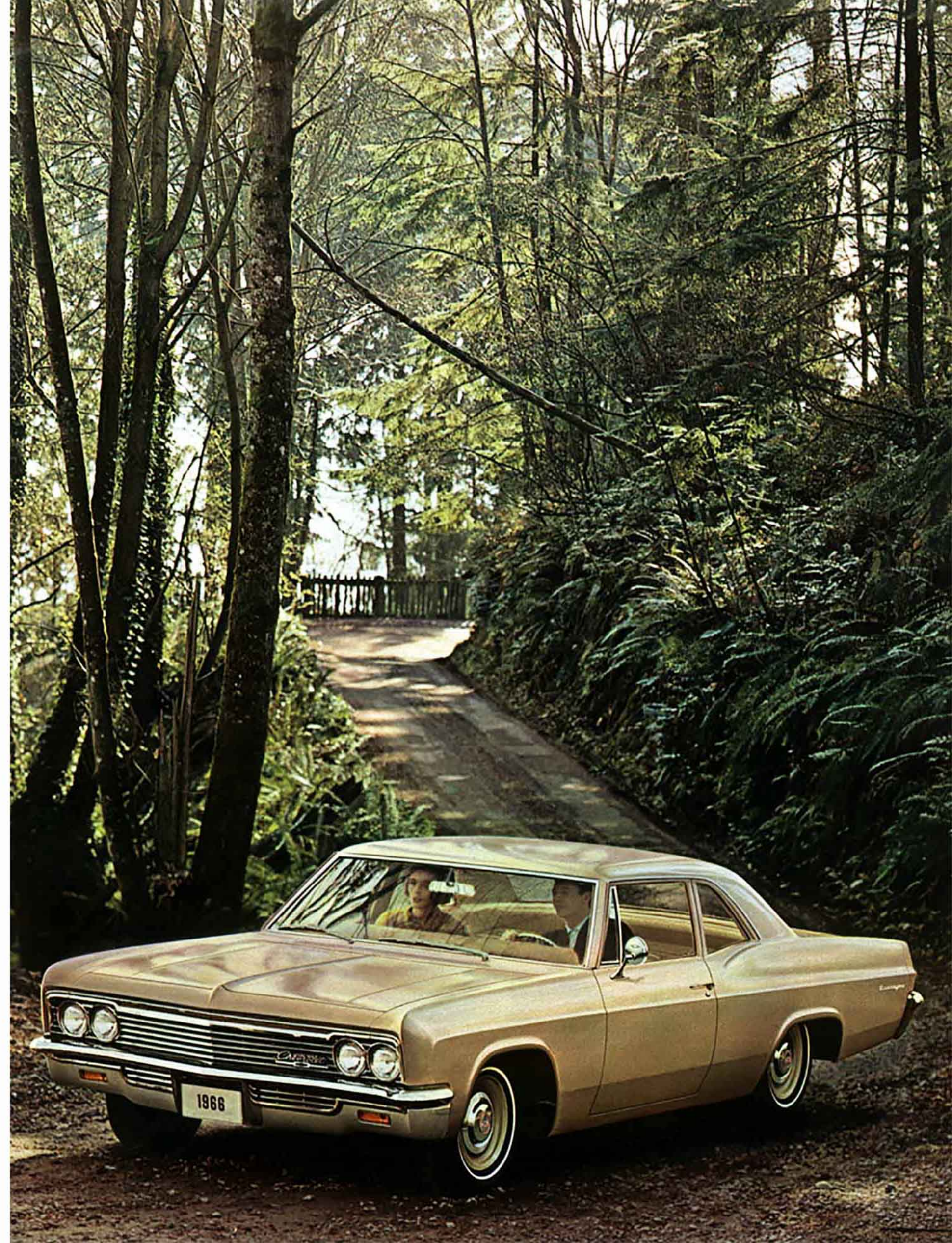
Right: Biscayne 2-Door Sedan in Cameo Beige.