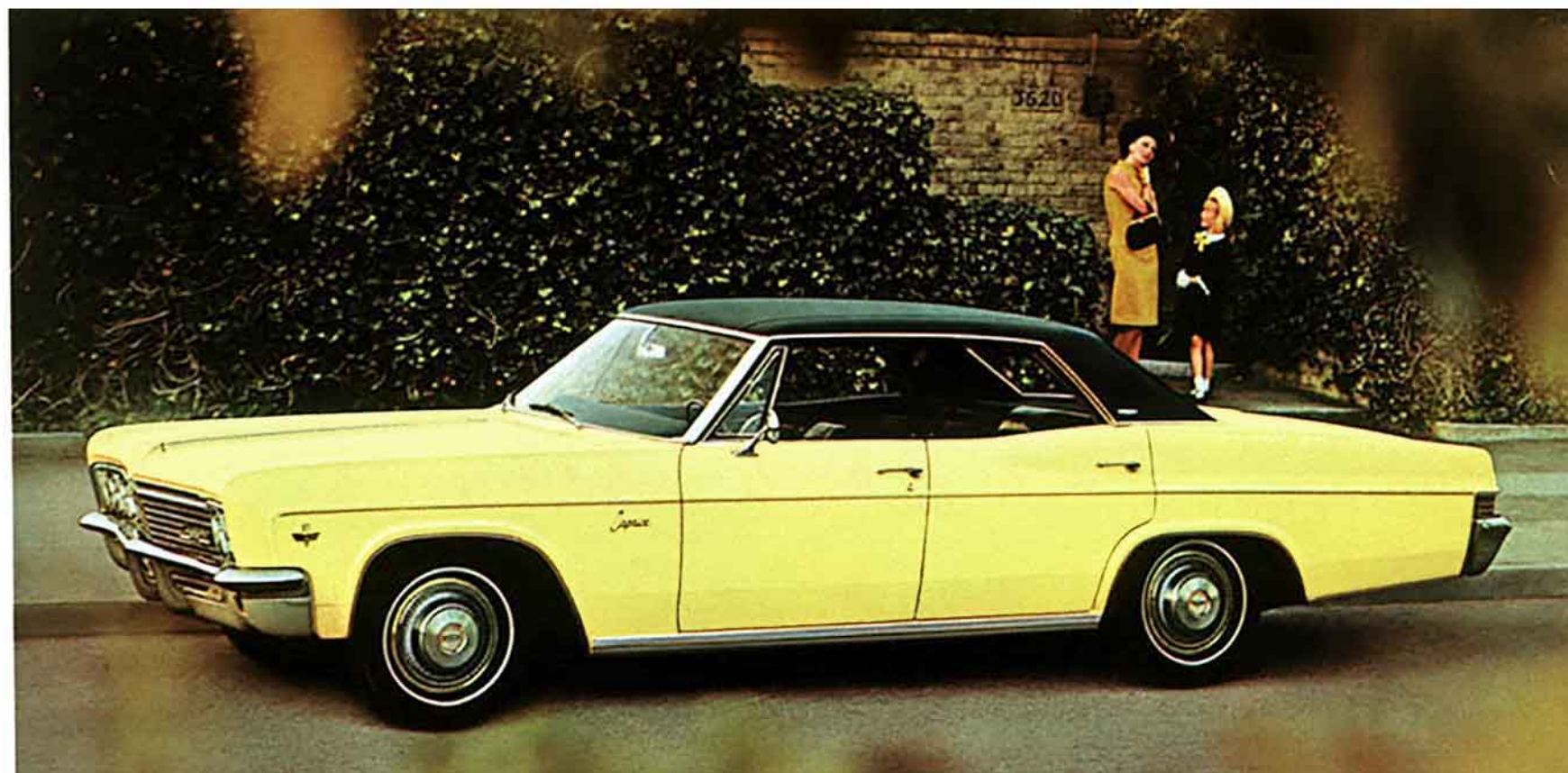
Caprice Custom Sedan in Lemonwood Yellow.