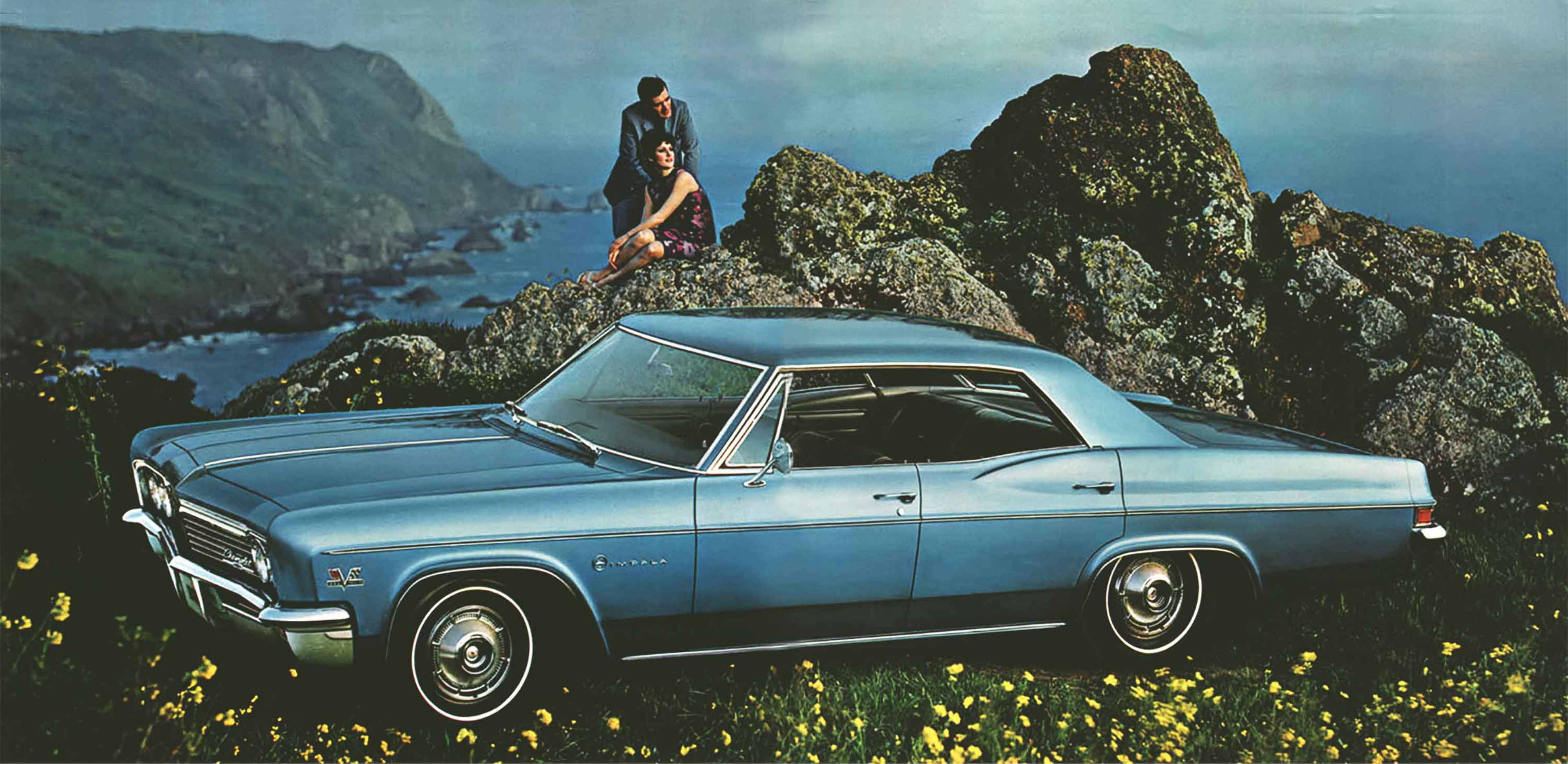
Impala Sport Sedan in Marina Blue.

Again this year, Impala affords fine-car features while sparing the high expense. Unmistakably '66 are the newly styled fenders, grille, bumpers and smart-looking wraparound taillights. Every distinctive Impala has front and rear wheel opening moldings; black-accented side and rear moldings; slender sill and hood windsplit moldings; and bright roof drip moldings.