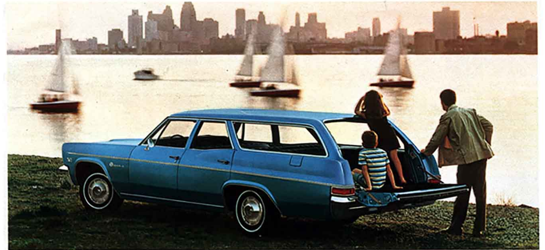
Impala 4-Door 3-Seat Station Wagon in Marina Blue.