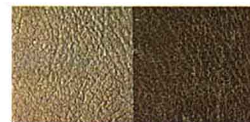
All-vinyl in fawn.