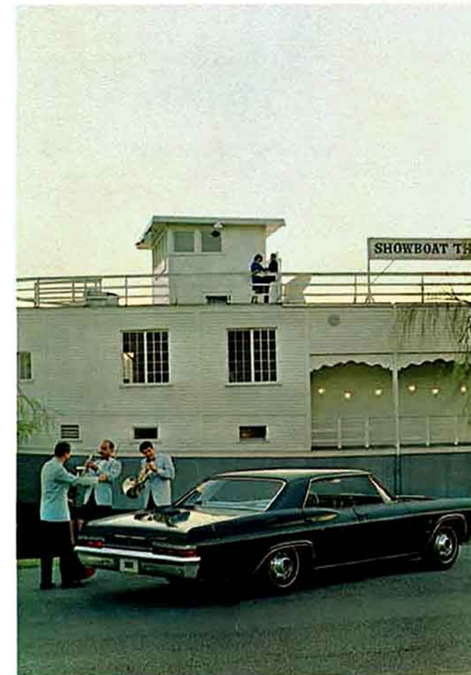
ALL-TRANSISTOR RADIOS are acoustically tailored to Chevrolet interiors and bring you beautiful sounds for '66.