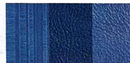
All-vinyl in blue.

* Some vinyls are single-toned and some are patterned, depending on model and interior color selected. See your Chevrolet dealer for the specific combination in the Chevrolet of your choice.