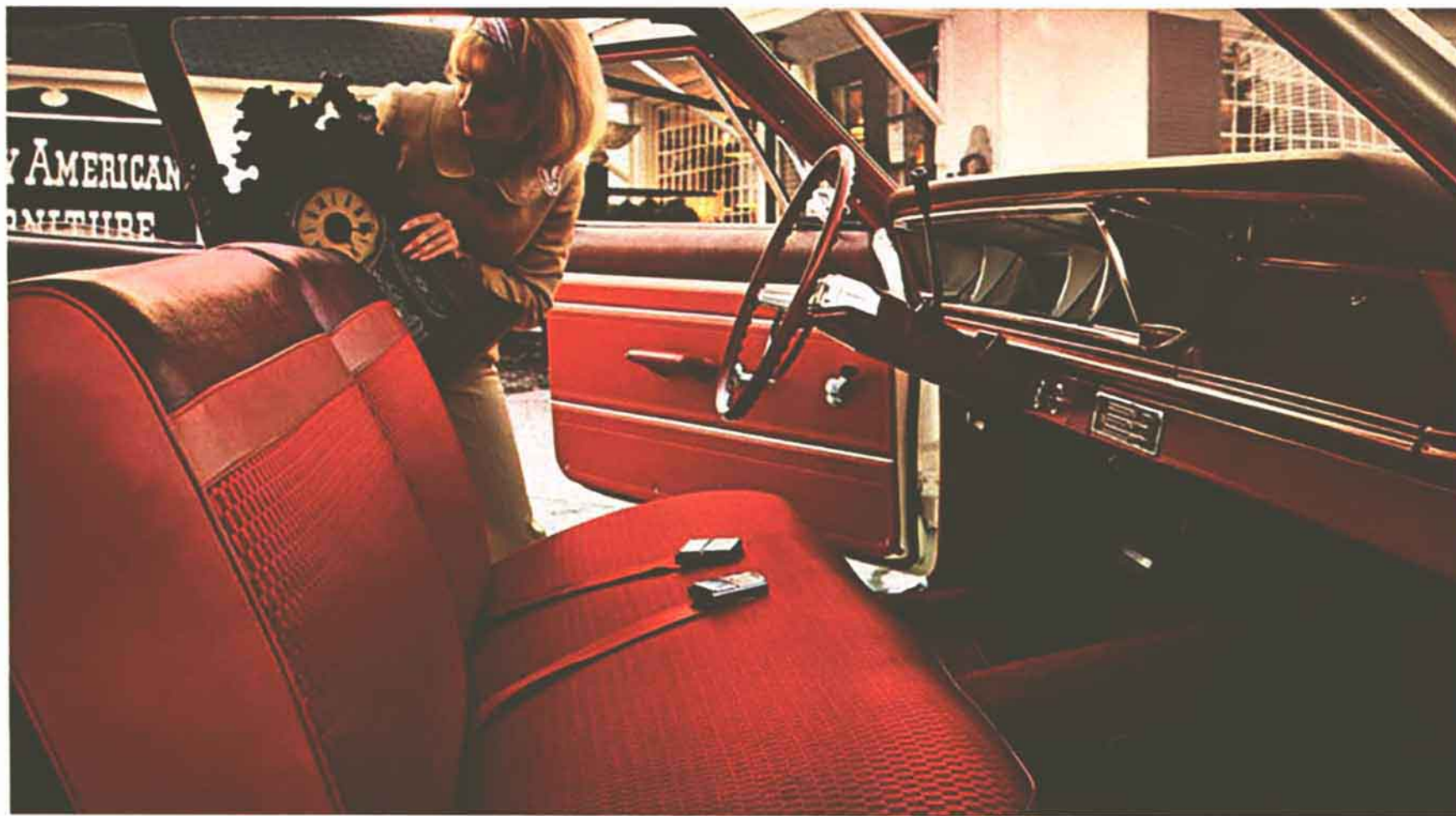
Biscayne 2-Door Sedan interior in red.

Biscayne's three budgeteers give buyers plenty to go for . . . without going out on a limb in price. Outside, bold new styling of fenders, bumpers and grille; distinctive ornamentation and nameplates. Inside, new instrument panel cluster and ornamentation, new steering wheel and handsome new pattern cloth and vinyl trim (all-vinyl for station wagon). Roomy passenger compartment has foam-cushioned front seat, color-keyed deep-twist carpeting, padded instrument panel and sun visors, seat belts and