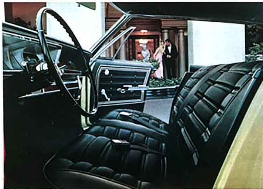
Caprice Custom Sedan interior in black.