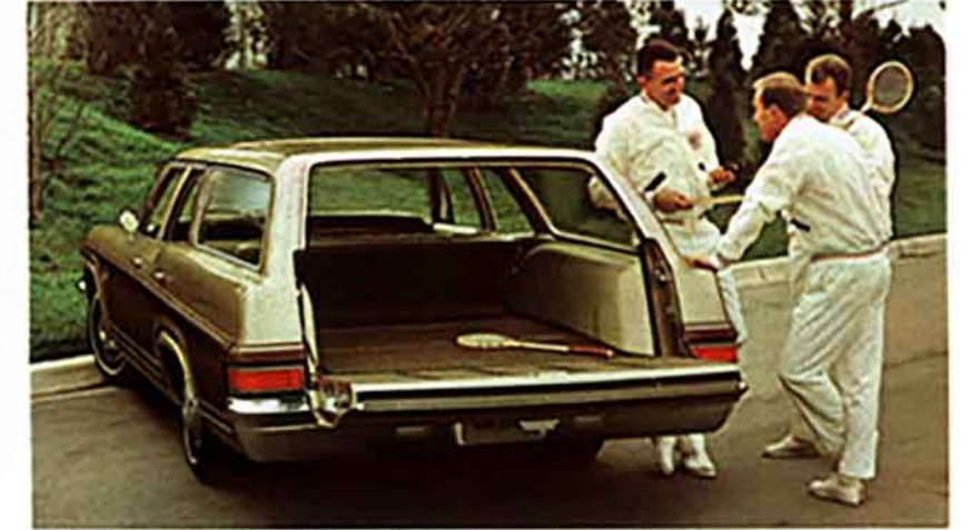
Caprice 4-Door 3-Seat Custom Wagon showing wide-opening, easy-closing counterbalanced tailgate.

Two new models distinguished by rich walnut-look paneling