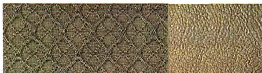
Pattern cloth and vinyl (Impala combination only) in fawn.

Available for Impalas and Impala Super Sports, depending on model: fawn, green, red, turquoise, blue, black, bright blue or white.*