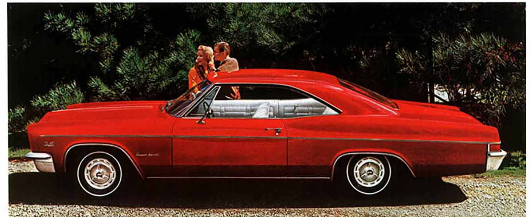
Impala Super Sport Coupe in Regal Red. Impala Sport Coupe also available.

The Impala Super Sport Coupe and Convertible are especially made for individualists who take a personal approach to car comfort and driving fun. Interiors are attired in all-vinyl and outfitted with new slim-profile tapered Strato-bucket seats in front. Between seats is a convenient center console decked out with ashtray, lighted carpet-lined compartment and courtesy light. A special Super Sport emblem is mounted on the glove compartment door. Both models have full wheel