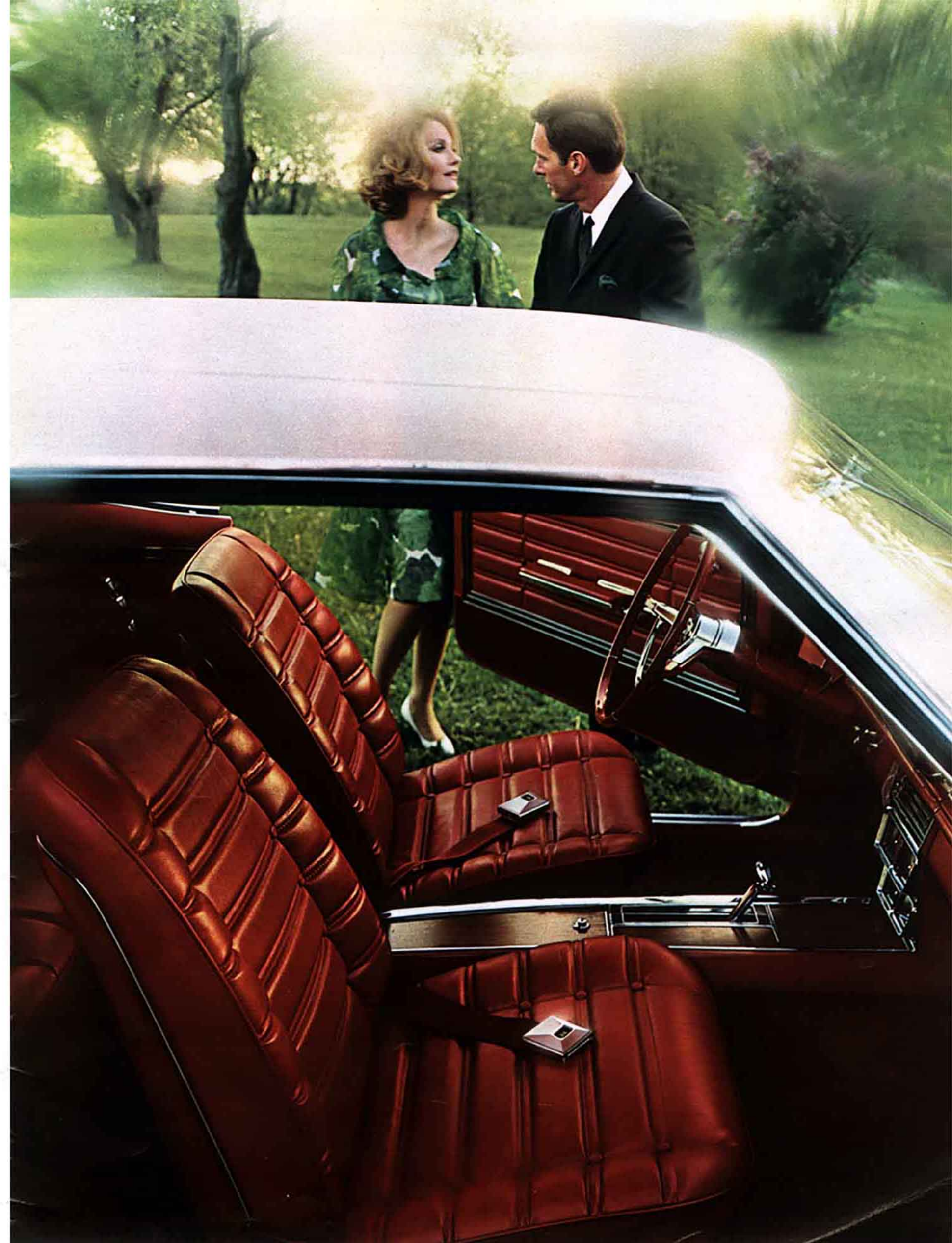
Right: Caprice Custom Coupe interior in red featuring elegant Strato-bucket seats, center console, special instruments and padded lower instrument panel.