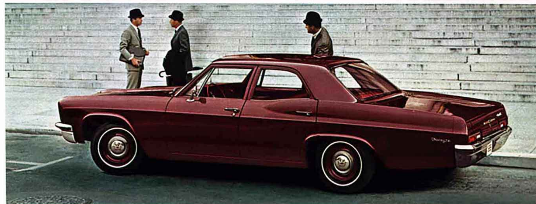
Biscayne 4-Door Sedan in Madeira Maroon.