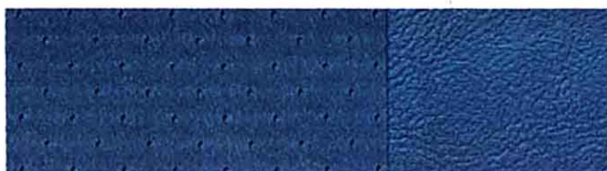
Pattern cloth and vinyl in blue.

Choice of fawn, turquoise, red, blue, black, bronze or green, depending on model and seat style ordered.*