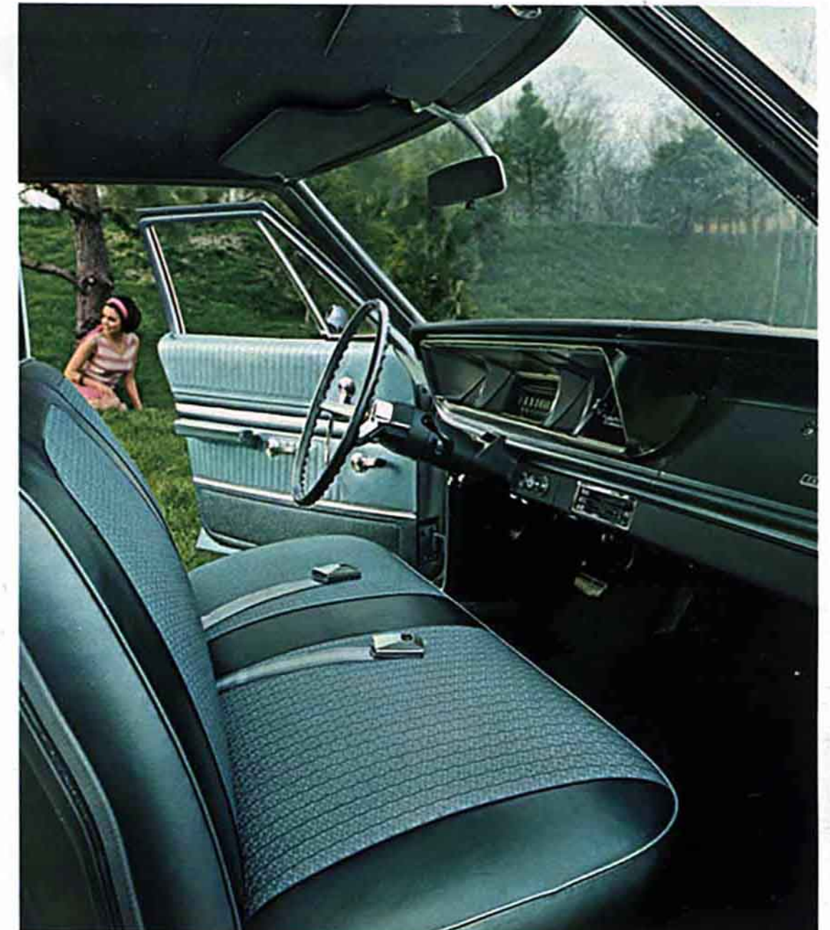
Bel Air 4-Door Sedan interior in Turquoise.