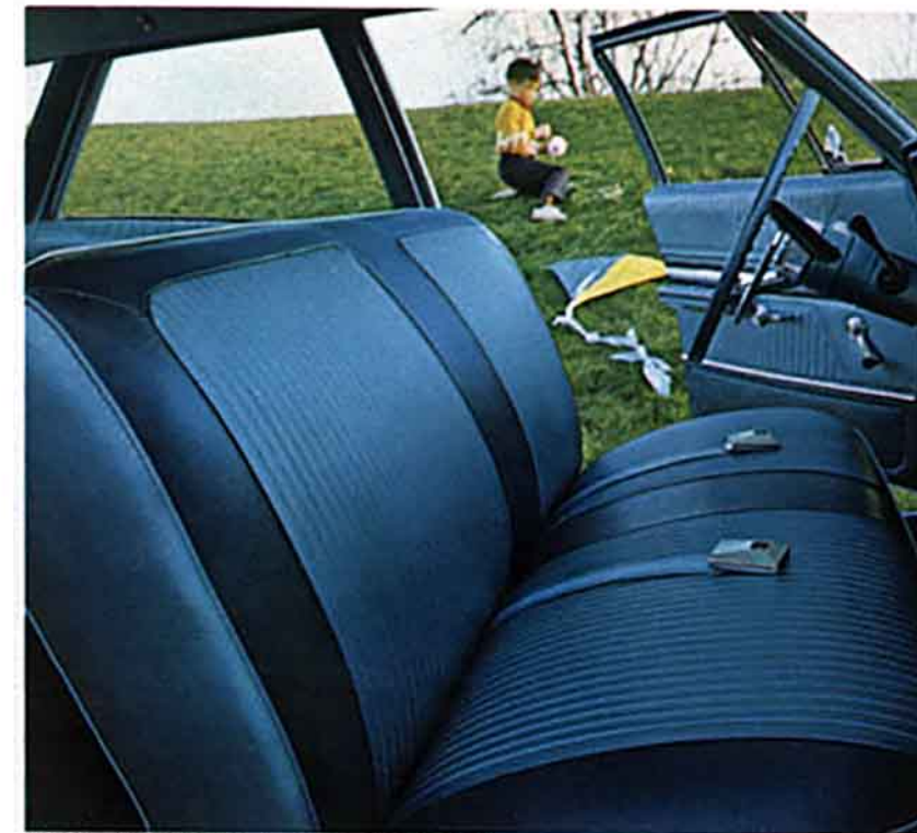
Bel Air 4-Door 2-Seater Station Wagon interior in blue.