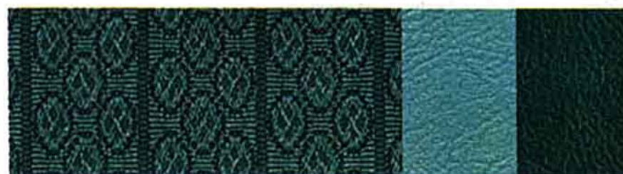
Pattern cloth and vinyl in turquoise.

Choose from fawn, turquoise, red or blue, depending on choice of exterior color.*