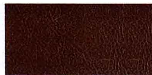
All-vinyl in bronze.