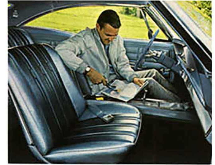
Sporty spirit characterizes this Impala Super Sport interior in blue with luxurious center console and new all-vinyl Strano-bucket seats.

Slip inside the new Impala and discover its pleasant surroundings. You can choose from up to six color schemes, depending on model: fawn, turquoise, red, blue, green and black. As for upholstery, Impala Sport Coupe, Sport Sedan and 4-Door Sedan are fashioned in new tufted textured pattern cloth with deeply padded vinyl bolsters. The convertible and station wagons are similarly styled in all-vinyl. A special all-vinyl black interior can be ordered for the sport coupe and sport sedan.