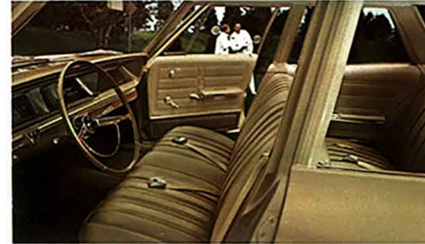
Caprice wagons' all-vinyl upholstery and deep-twist carpeting in fawn.