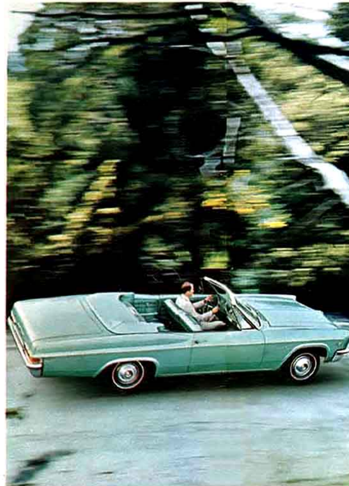
NEW TILT-TELESCOPIC steering wheel adjusts quickly and conveniently any way you please.