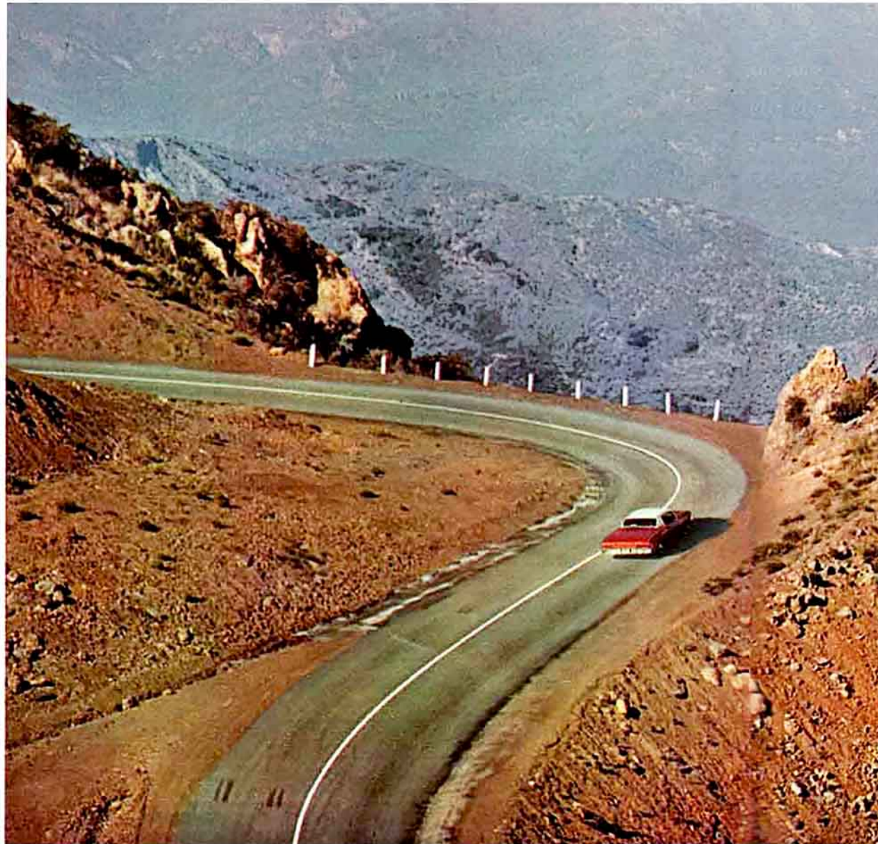
FOUR-SEASON air conditioning changes the weather to your liking so you drive and arrive fresh and pressed, cool and calm.

If you are like most people, you will want to personalize your Chevrolet to your own particular taste and purpose. And you can do it this year with greater-than-ever style and flair. For Chevrolet offers almost every kind of comfort, convenience item and power assist to make driving more pleasurable . . . resale value higher. That's the Chevrolet way. For instance, you can order air conditioning, power brakes, power steering, Positraction, tilt-telescopic steering wheel and radios (including stereo). These are only a few of the ways to make your '66 Chevrolet just right with Chevrolet's extra-cost Options and Custom Features. See Page 23 for more items.