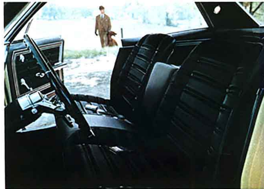
Caprice Custom Sedan interior in black with luxurious Strato-back front seat.