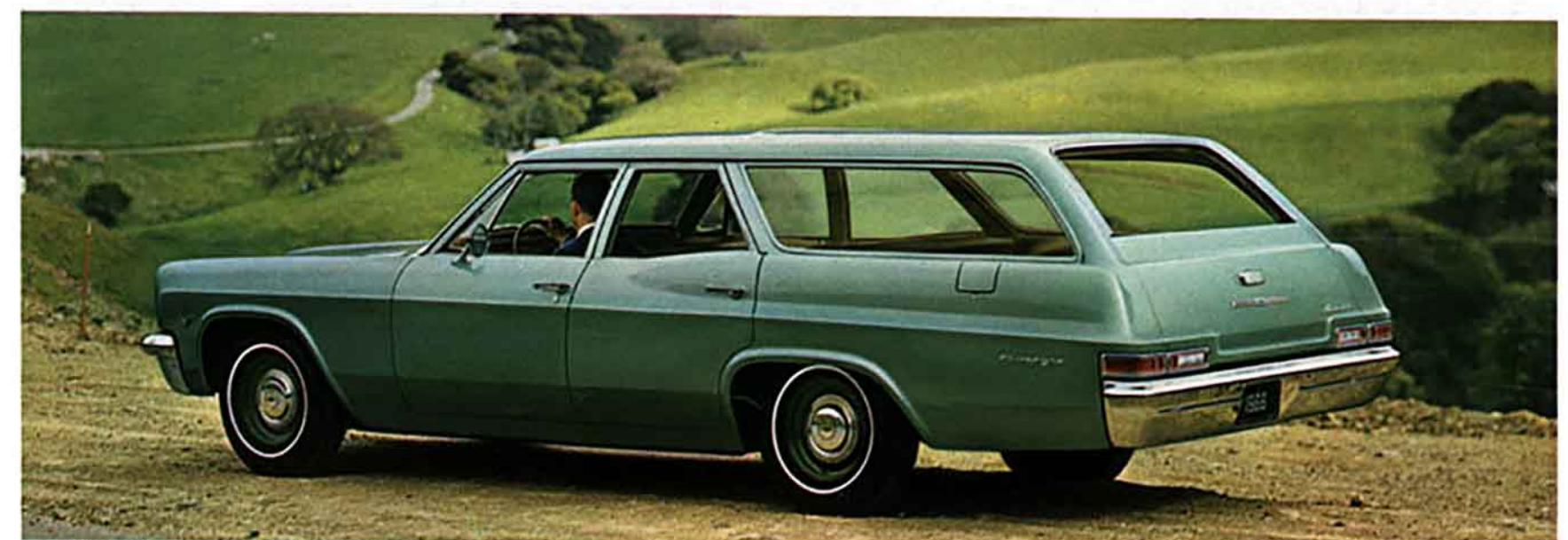
Left: Bel Air 4-Door 3-Seater Station Wagon in Mist Blue.