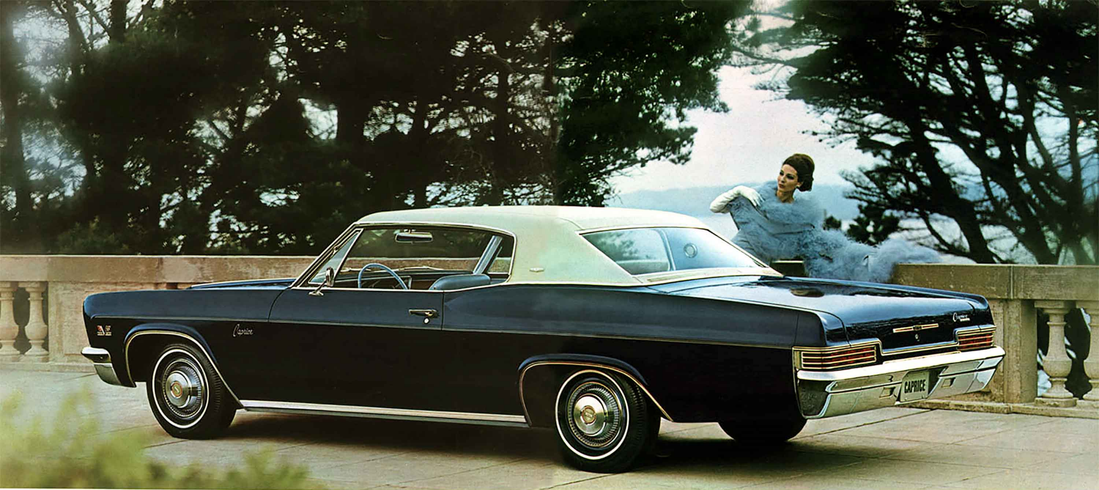
Caprice Custom Coupe in Danube Blue

Choose any Jet-smoother 1966 Chevrolet. It'll be built the Chevrolet way: comfortable, dependable and good looking . . . like the new Caprice Custom Coupe above with its one-of-a-kind roof line.