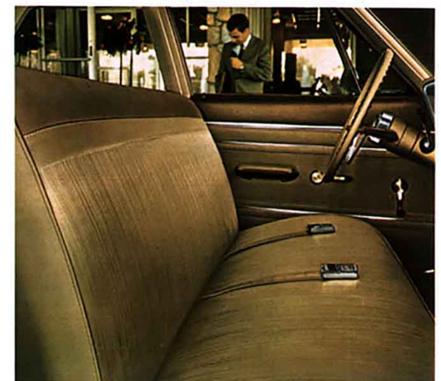
Biscayne 4-Door 2-Seater Station Wagon interior in fawn.