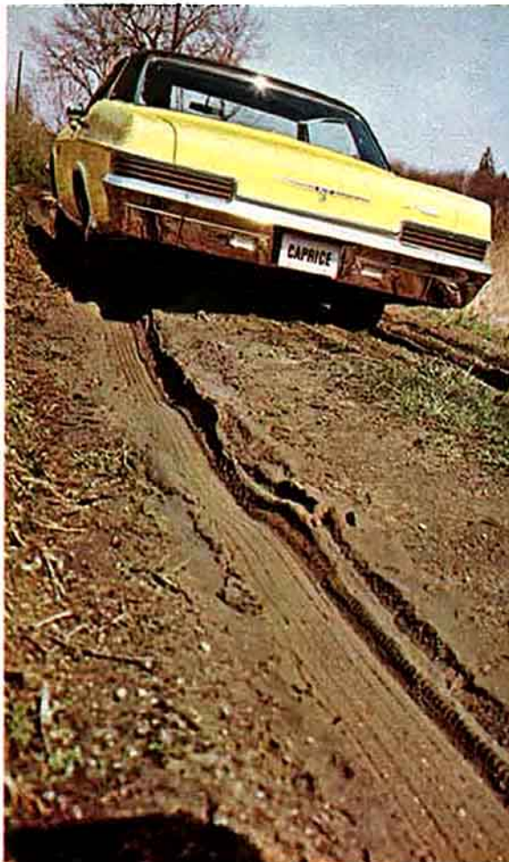
POSITRACTION rear axle beefs up your traction and your confidence when driving on ice, snow or sand.