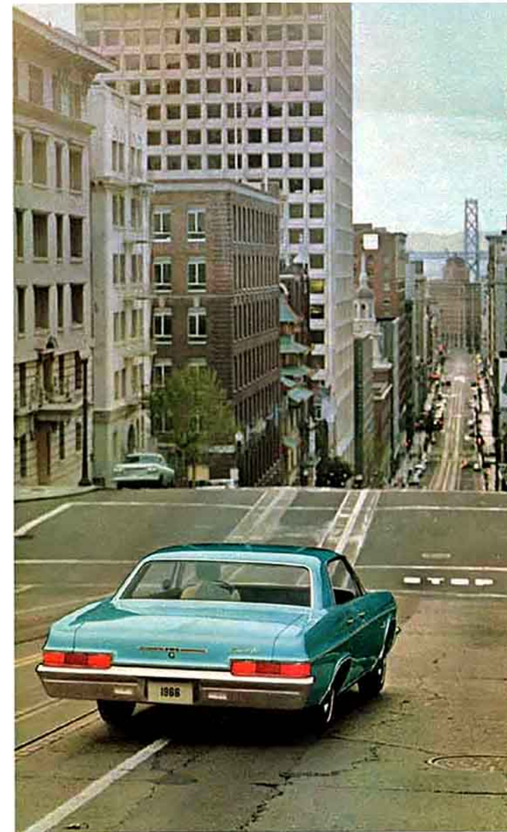
POWER BRAKES added to your new Chevrolet take much of the effort out of stopping, help make every trip an easy excursion.