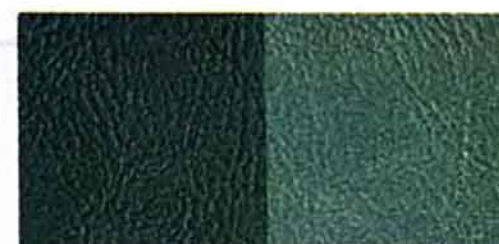
All-vinyl in green.