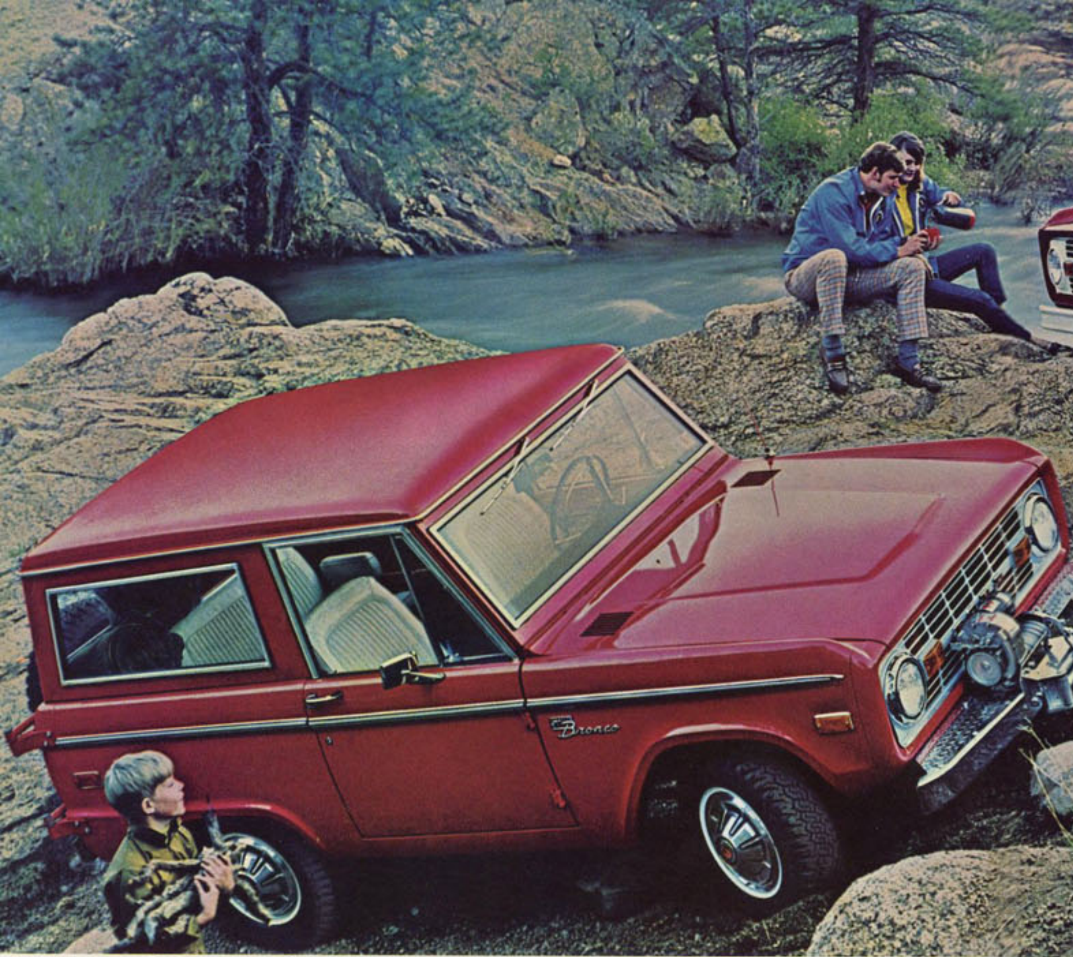
Sport Bronco with optional radio, rear seat, and special order solid exterior paint treatment (in addition to front winch and bumper)