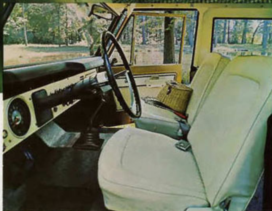
Sport Bronco interior