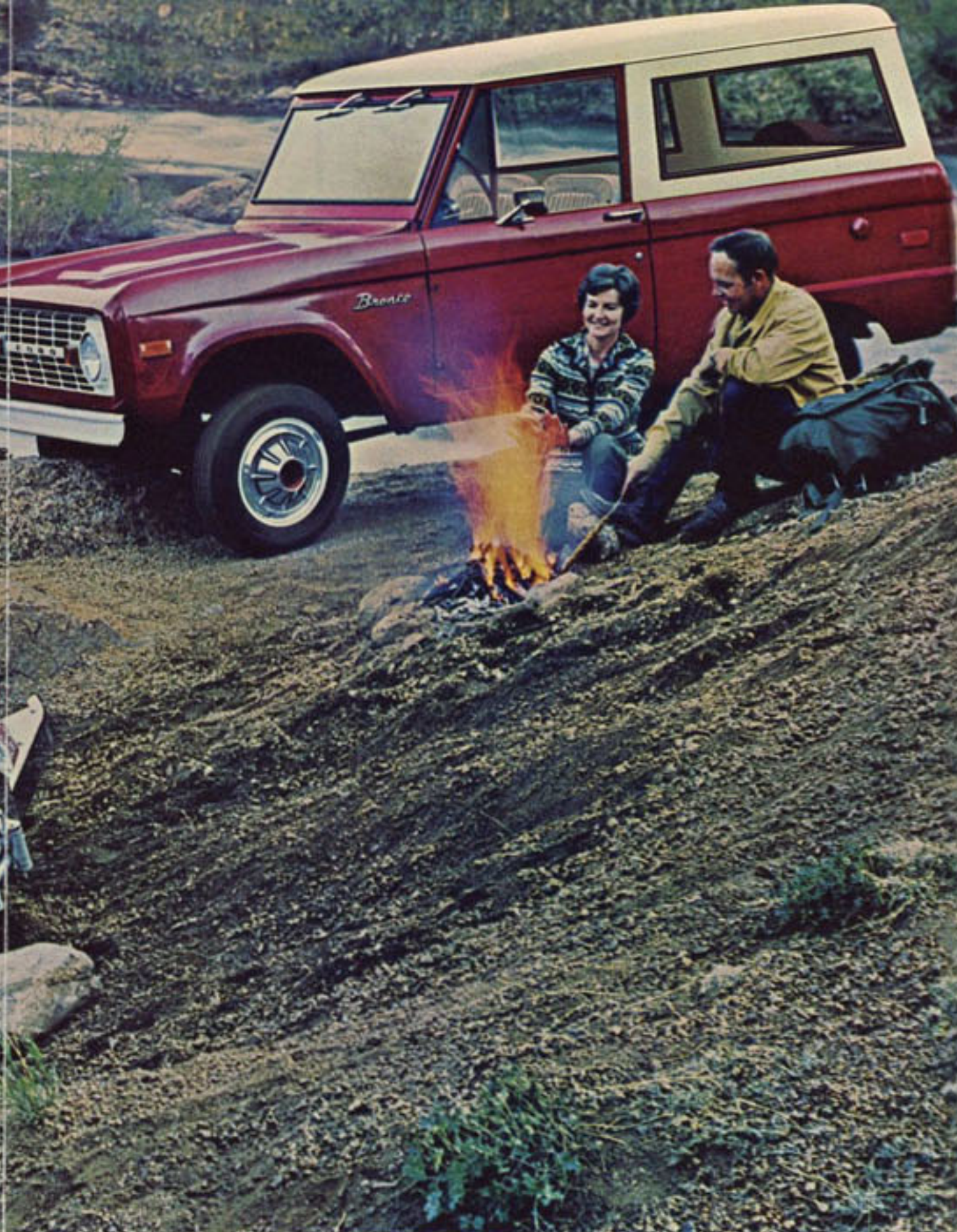
Bronco with optional wheel covers