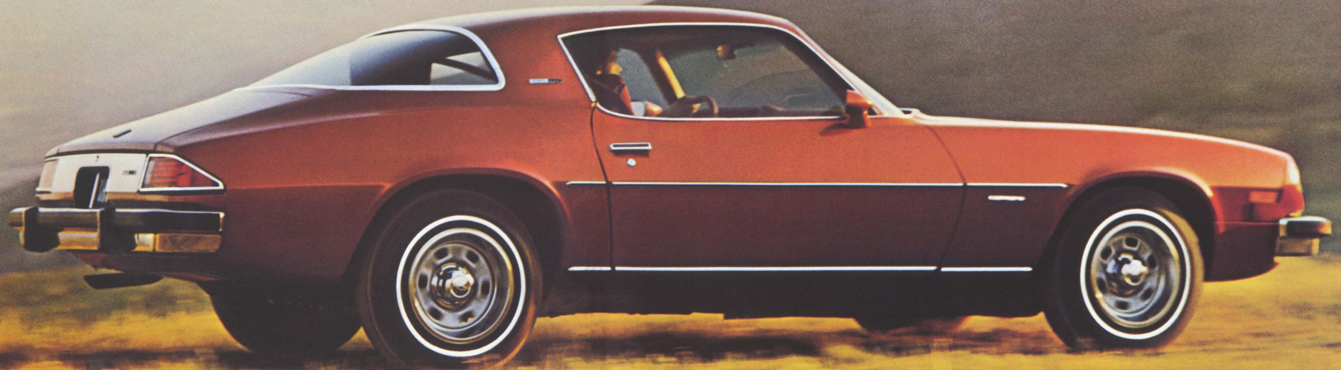
Camaro Type LT. Shown with available body side moldings, Style Trim Group, white stripe tires and bumper guards.