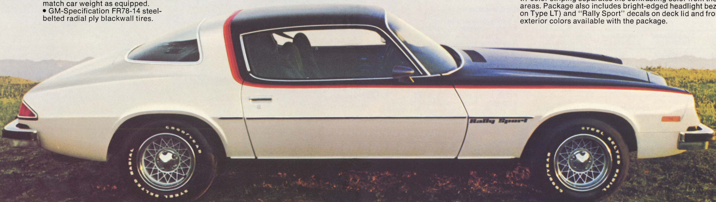
Camaro Sport Coupe shown with available Rally Sport Equipment, body side moldings, Style Trim Group, custom-styled wheels, white lettered tires.

A very dramatic appearance package available for either the Sport Coupe or the Type LT. Features special contrasting paint areas (in your choice of low-gloss black or, new-for-'77, gray metallic, dark blue metallic or buckskin metallic) on forward top surfaces, rear end panel and on dual sport mirrors (included in Rally Sport Equipment package). Grille and lower body area are black. A distinctive tri-color striping separates the contrasting color from the body color in appropriate areas. Package also includes bright-edged headlight bezels, Rally wheels (both std. on Type LT) and "Rally Sport" decals on deck lid and front fenders. Ask about exterior colors available with the package.