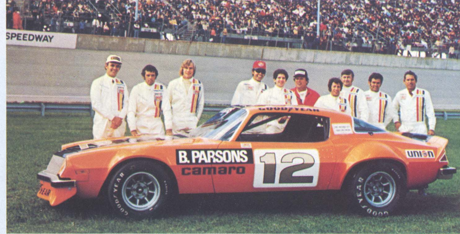
Camaro and admirers. Top race drivers compete in the "International Race of Champions," each driving an identically prepared Camaro, specifically equipped for racing. Shown left to right: Benny Parsons, Brian Redman, James Hunt, Richard Petty, Jody Scheckter, A. J. Foyt, Mario Andretti, Bobby Allison, Al Unser, David Pearson.

disc brakes, variable-ratio power steering, sport steering wheel, bucket seats in front, bucket-styled seats in the rear, and a cockpit and instrument