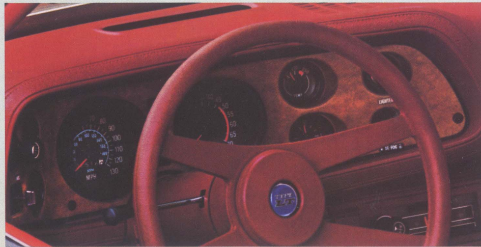
The Type LT instrument panel features a simulated leather instrument cluster facing, Special Instrumentation (tachometer, voltmeter, temperature gauge, electric clock), added instrument lighting, glovebox light and color-coordinated steering wheel with "Type LT" emblem.

aluminum rear trim panel, black-accented lower body sill areas and, inside, special bucket seats and luxury-level interior trim.