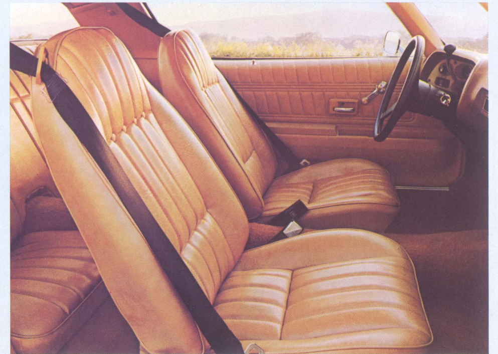
Camaro Sport Coupe standard all-vinyl interior.

You can choose your '77 Camaro Sport Coupe's standard all-vinyl interior in solid black or in colorful two-tones—white seats, headliner and door trim with aqua, black, blue, firethorn or saddle accent areas. There are also buckskin seats with saddle or black accent areas, and firethorn seats with black or firethorn accents in standard all-vinyl or in available sport cloth seat trim.