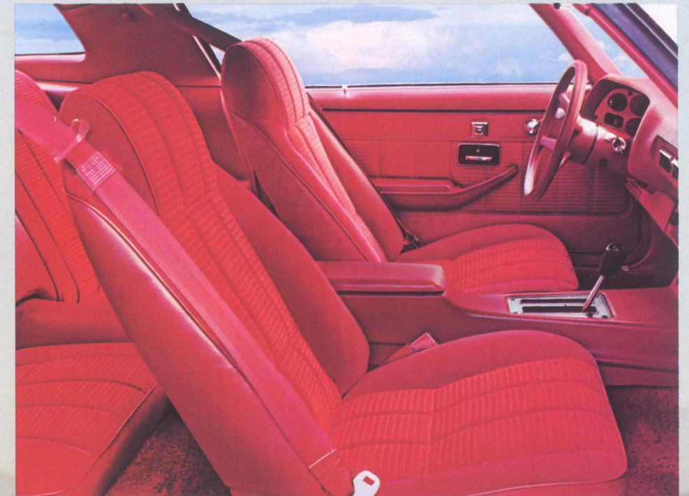
Camaro Type LT available knit cloth-and-vinyl interior.

You have your choice of nine standard all-vinyl interiors in the Type LT—solid blue or black; buckskin seats with saddle or black interior accents; or white seats with blue, black, firethorn, aqua or saddle interior accents. And there are five available knit-cloth seat interiors—solid blue; buckskin with saddle or black interior accent areas; firethorn with firethorn or black accent areas.