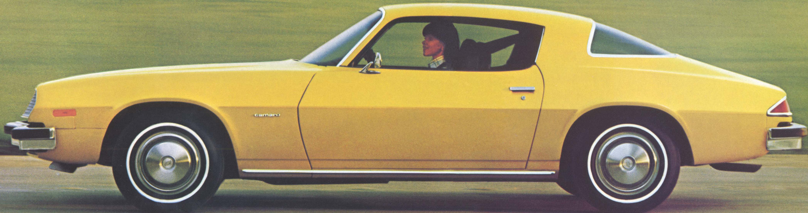
Camaro Sport Coupe. Shown with available white stripe tires and wheel covers. Shown on cover: Camaro Type LT with available white stripe tires and Style Trim Group.