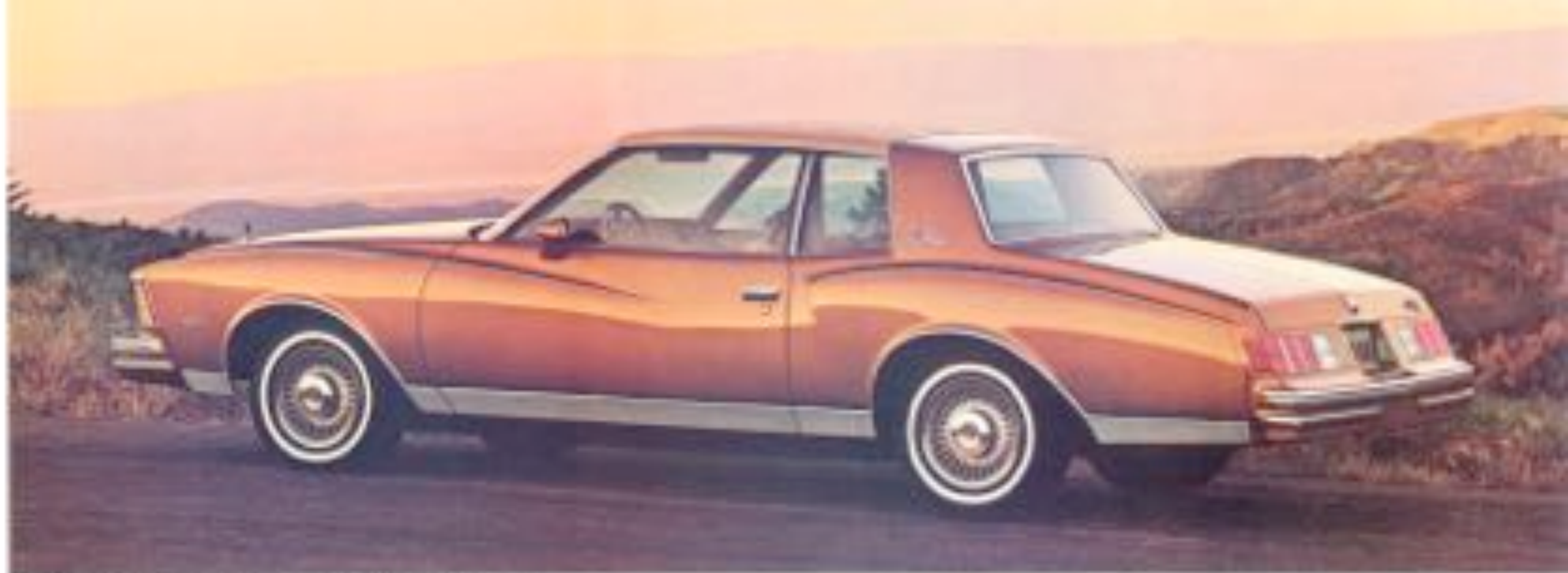
Monte Carlo Landau Coupe shown in color metallic with polished white vinyl roof.

Whatever design feature you might choose, Monte Carlo's personality remains clear and unmistakable. And, after all, what more could you ask for?