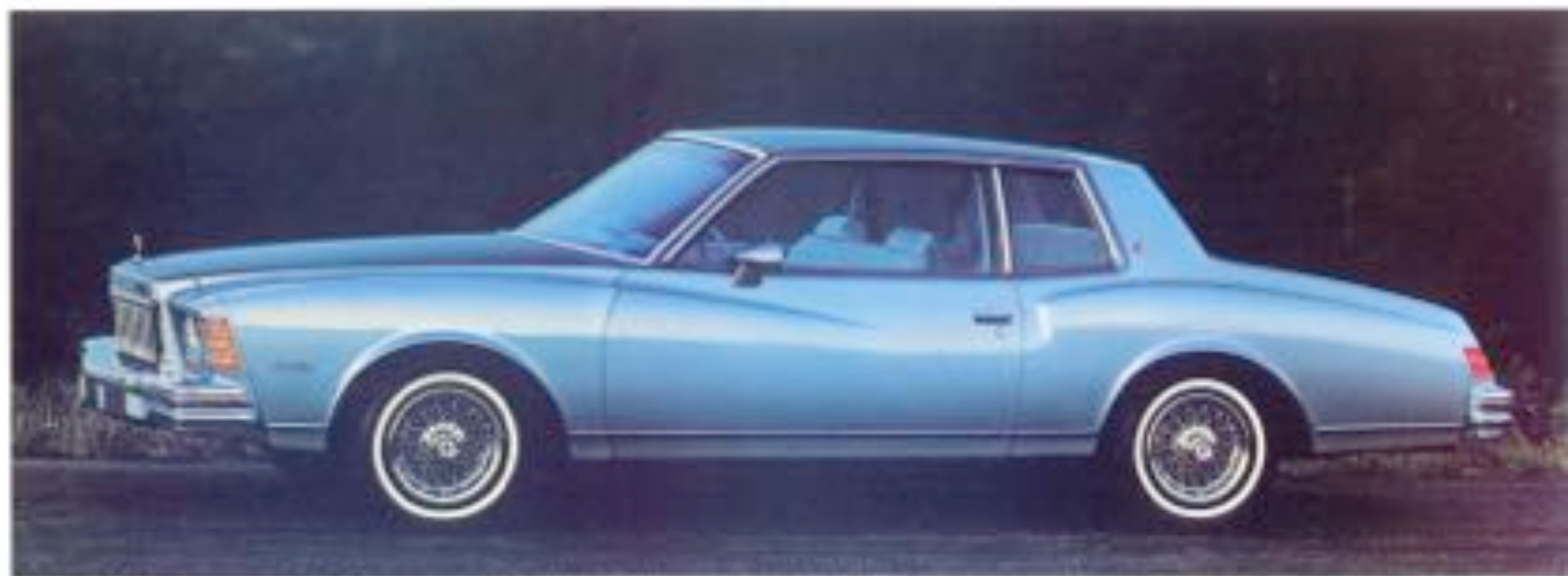
Monte Carlo Coupe shown in available Custom Two-Tone sprays and metallic blue metallic with available sport mirrors, bright body all moldings, color glass, side door covers and vinyl stripe line.