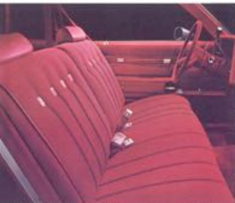
Monte Carlo standard cloth interior shown in carmine with available deluxe color-keyed seat and shoulder belts, power door locks, automatic transmission and sport mirror.