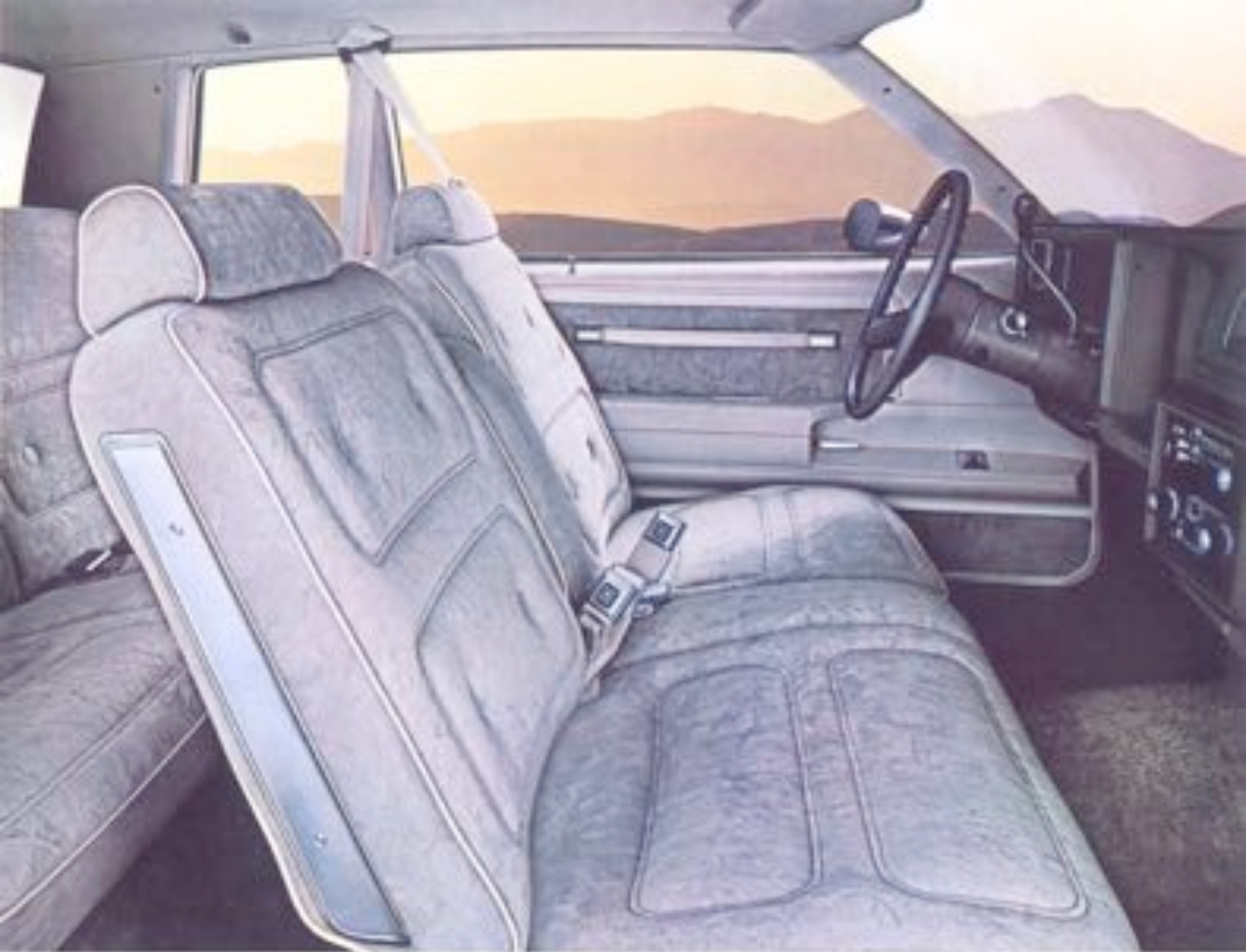
Available Special Custom interior with 55-85 split seat and center armrest shown in oyster with available AM/FM stereo radio, air conditioning, sport mirror and automatic transmission.