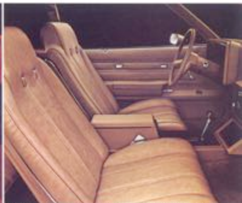
Available vinyl bucket seats shown in camel with available console, AM/FM radio, sport mirror and automatic transmission.