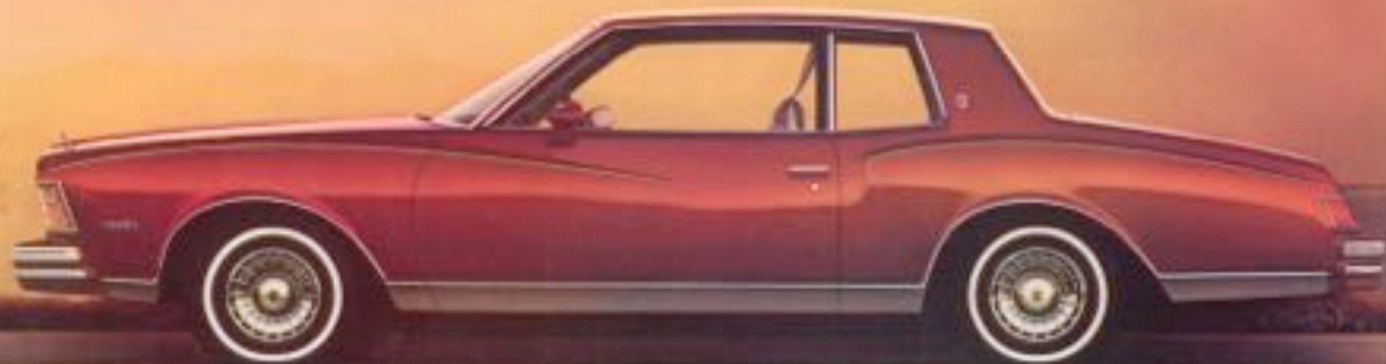
Monte Carlo Coupe shown in custom fabric with available accessories. Side view per styling, light body, all moldings and white stripe are