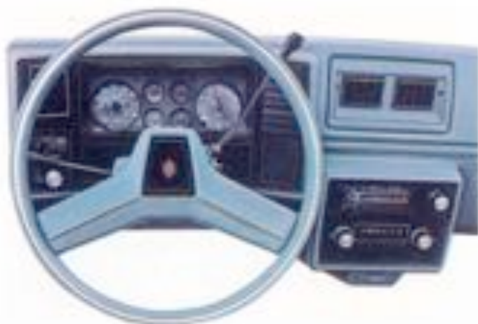
Monte Carlo instrument panel with available air conditioning, AM radio, intermittent windshield wiper system and automatic transmission.

Select the Monte Carlo decor and color combination that best satisfies your tastes and personality from the chart below.