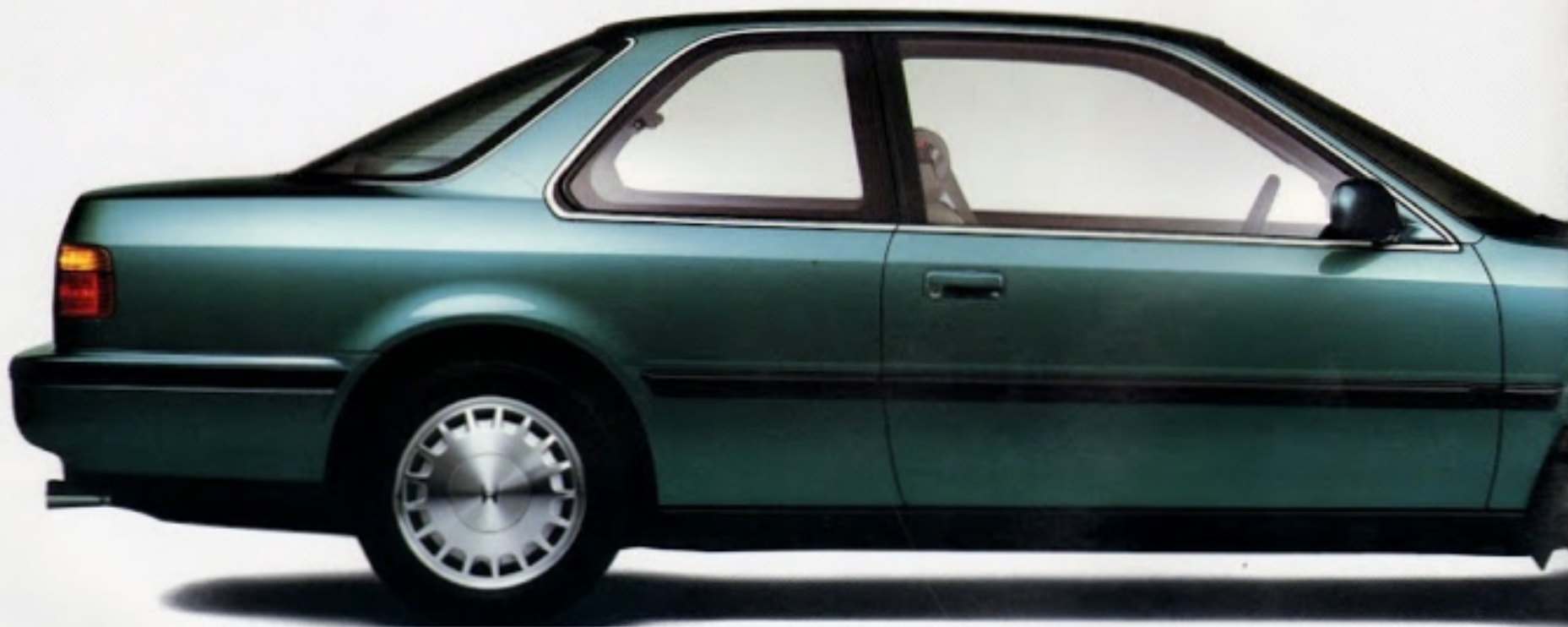
ACCORD EX COUPE

No matter which one you choose, the Accord Coupe has all your priorities in order.