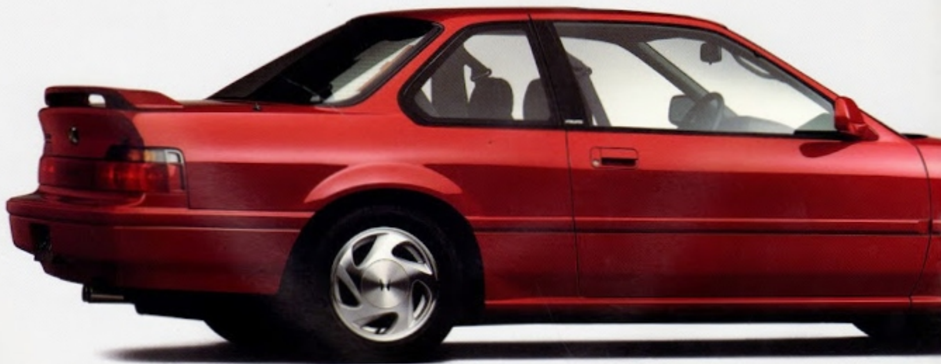
PRELUDE Si WITH 4-WHEEL STEERING

Now that you've seen the Prelude and all it has to offer, don't just sit there.