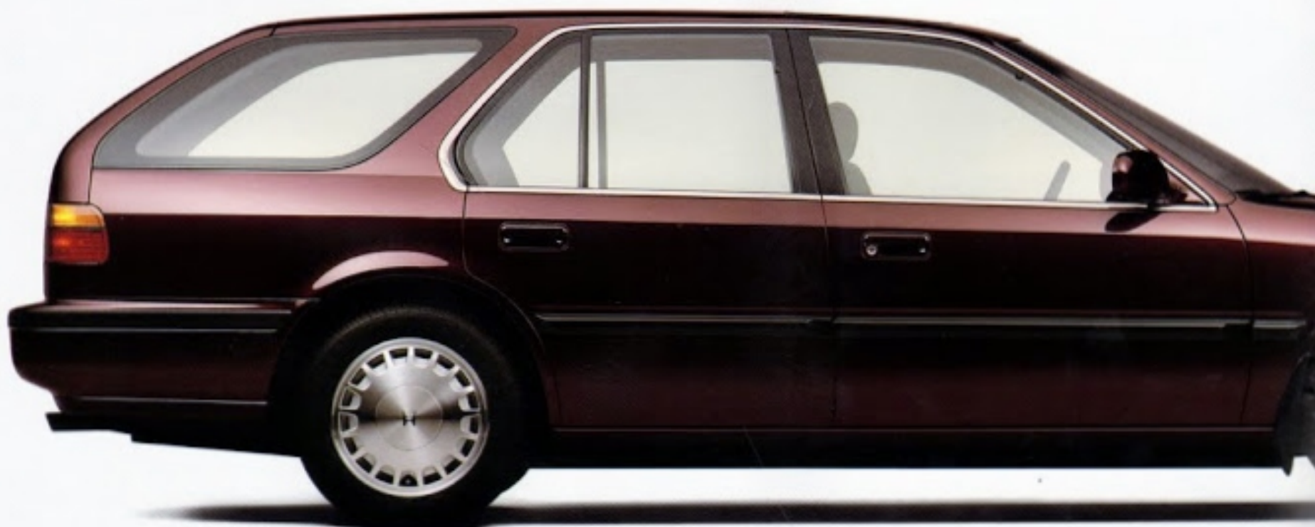
ACCORD EX WAGON

The Accord LX Wagon is both practical and luxurious. It's the start of something big. Then there's the Accord EX Wagon. With a 140 horsepower engine, a power moonroof, alloy wheels and a remote entry system, you never had it so good.