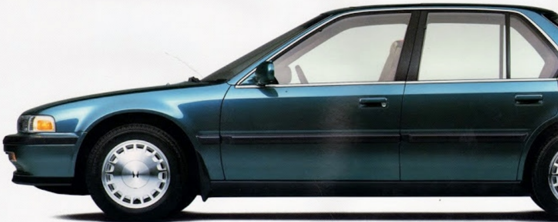
ACCORD SE SEDAN

And the SE Sedan is the Accord's most exclusive statement. The perfect example for others to follow.