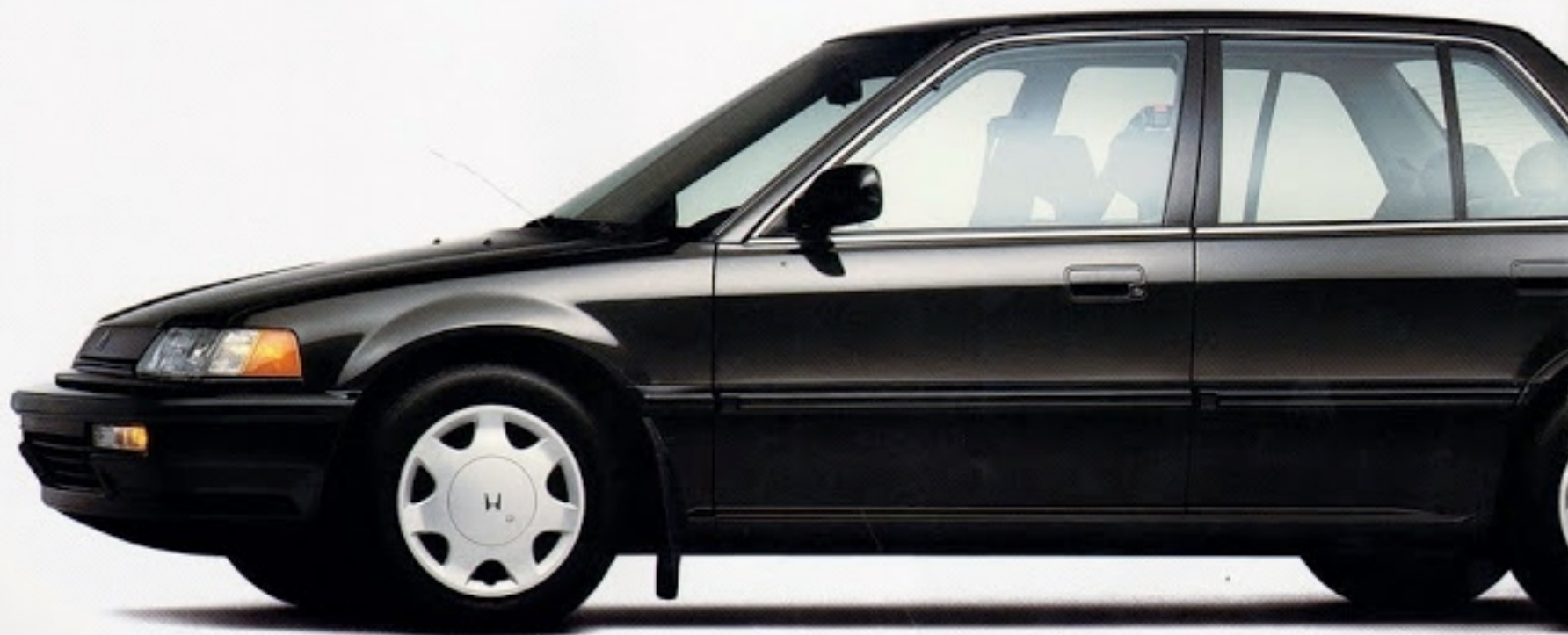
CIVIC EX SEDAN

For even more flexibility, try the Civic 4WD Wagon. It shifts automatically from front-wheel to 4-wheel drive the instant conditions call for it. Honda calls this Real Time 4WD.* You'll call it amazing.