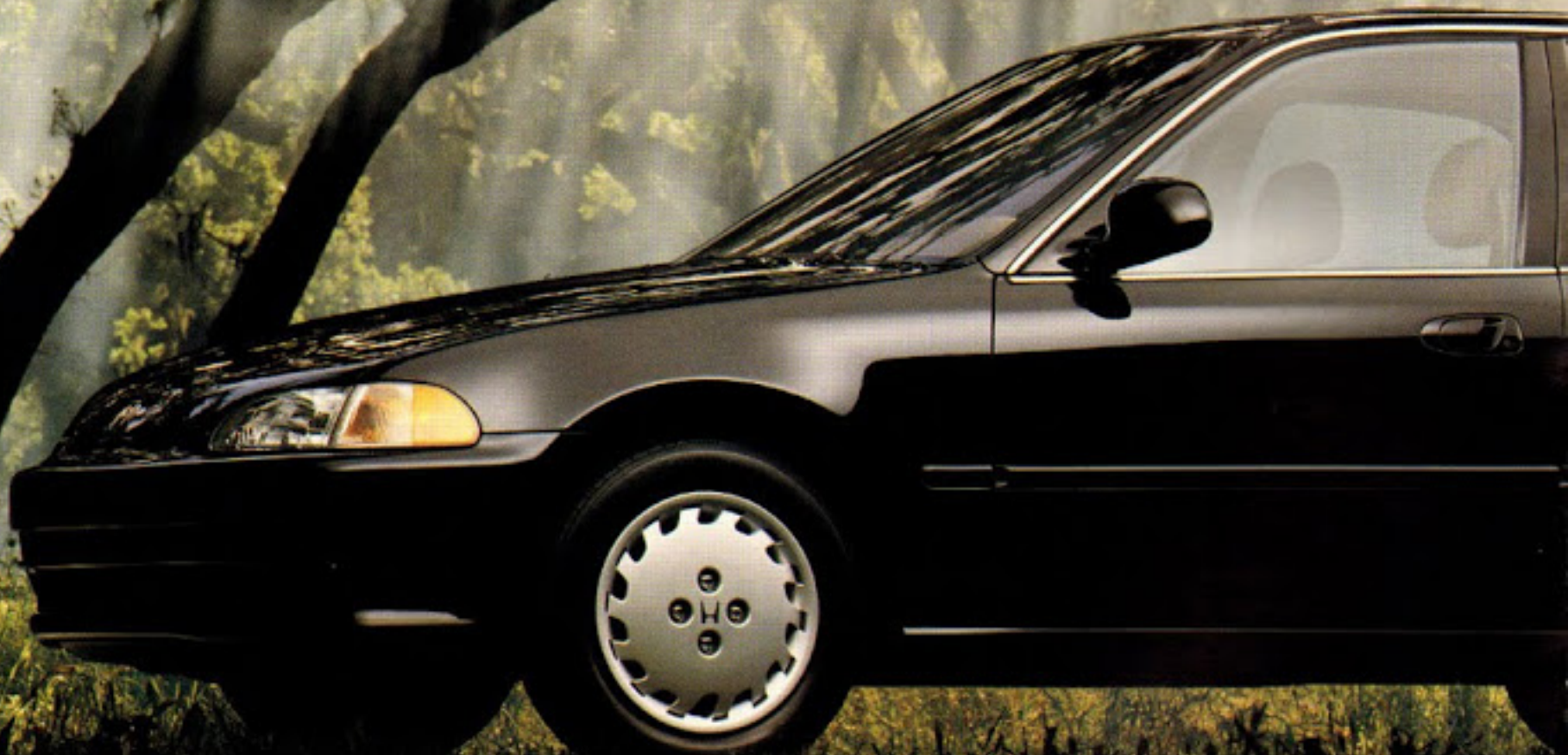
Civic EX Sedan shown in Granada Black Pearl