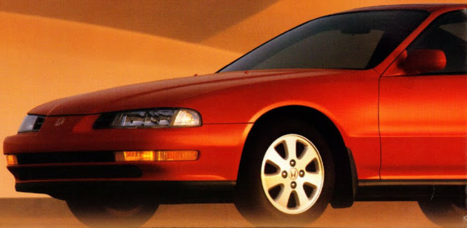
Prelude Si shown in Milano Red with accessory rear spoiler