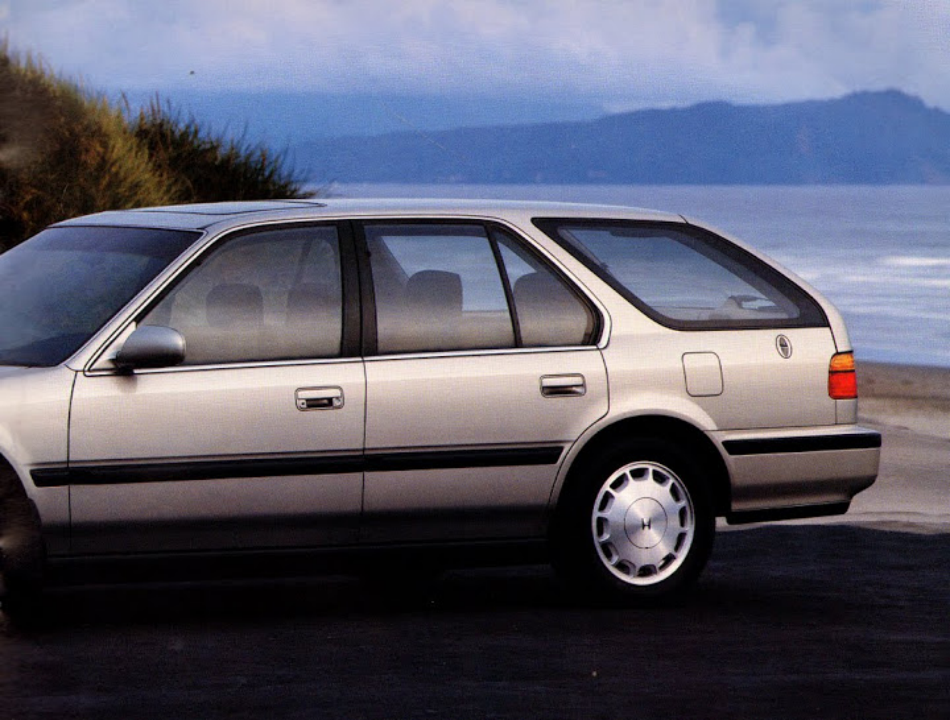
Accord EX Wagon shown in Seattle Silver Metallic. Accord Wagon models available November 1992.