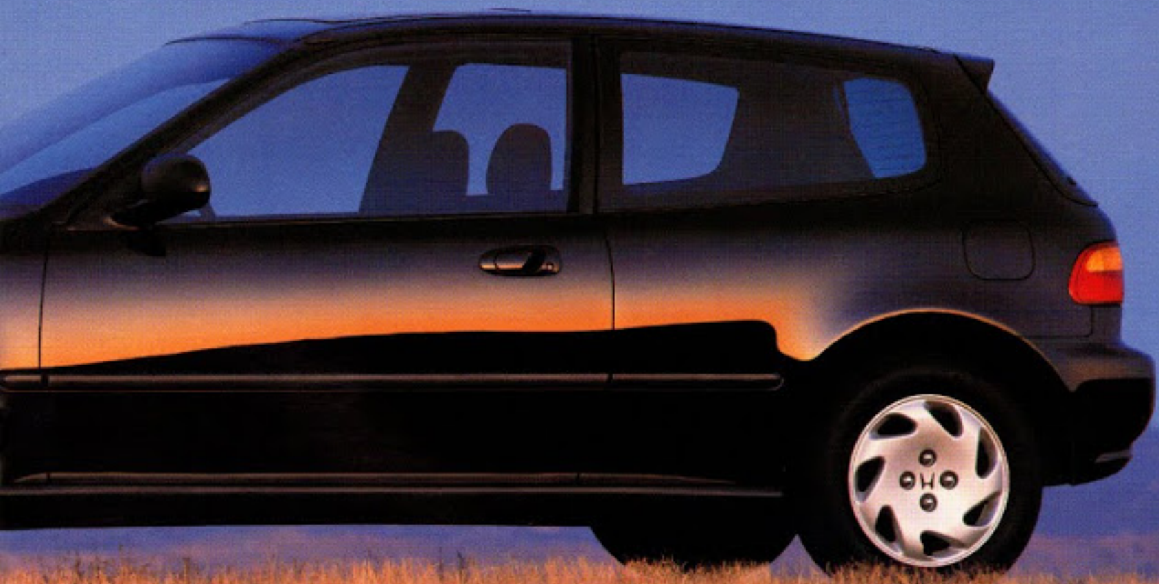
Civic Si shown in Granada Black Pearl