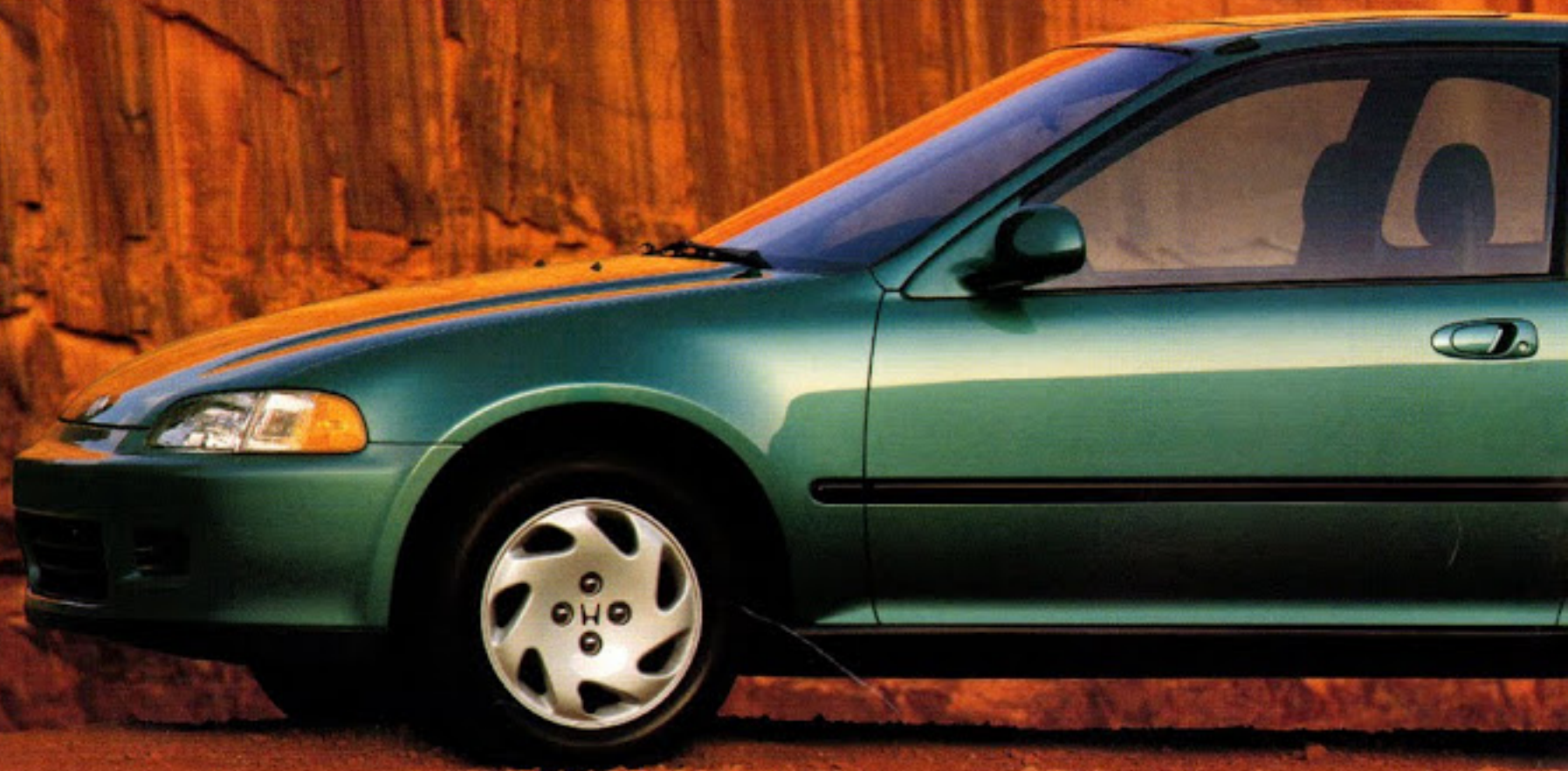
Civic EX Coupe shown in Aztec Green Pearl