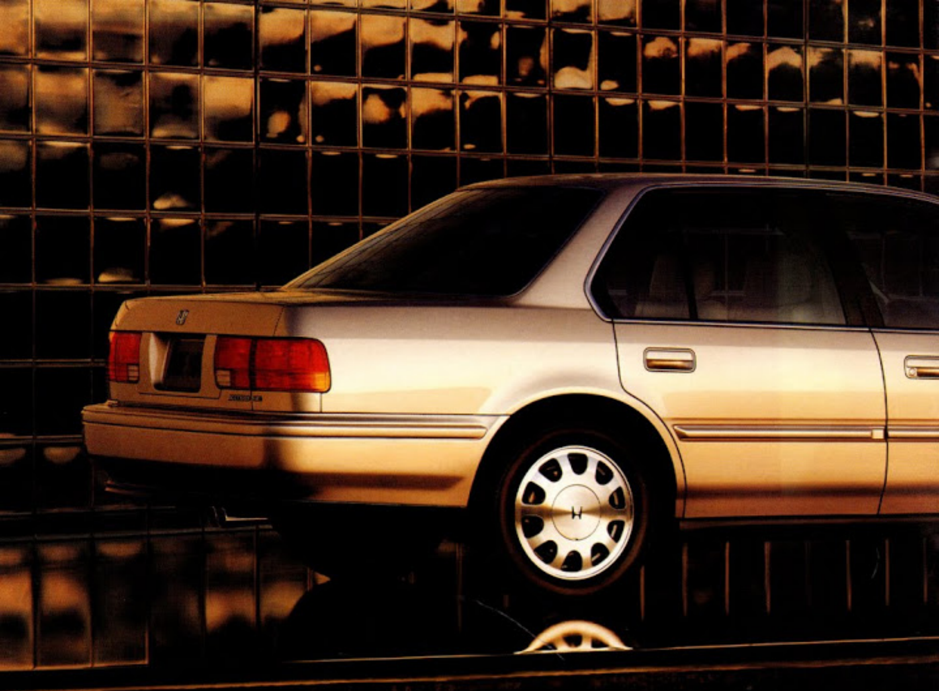
Accord SE Sedan shown in Cashmere Metallic