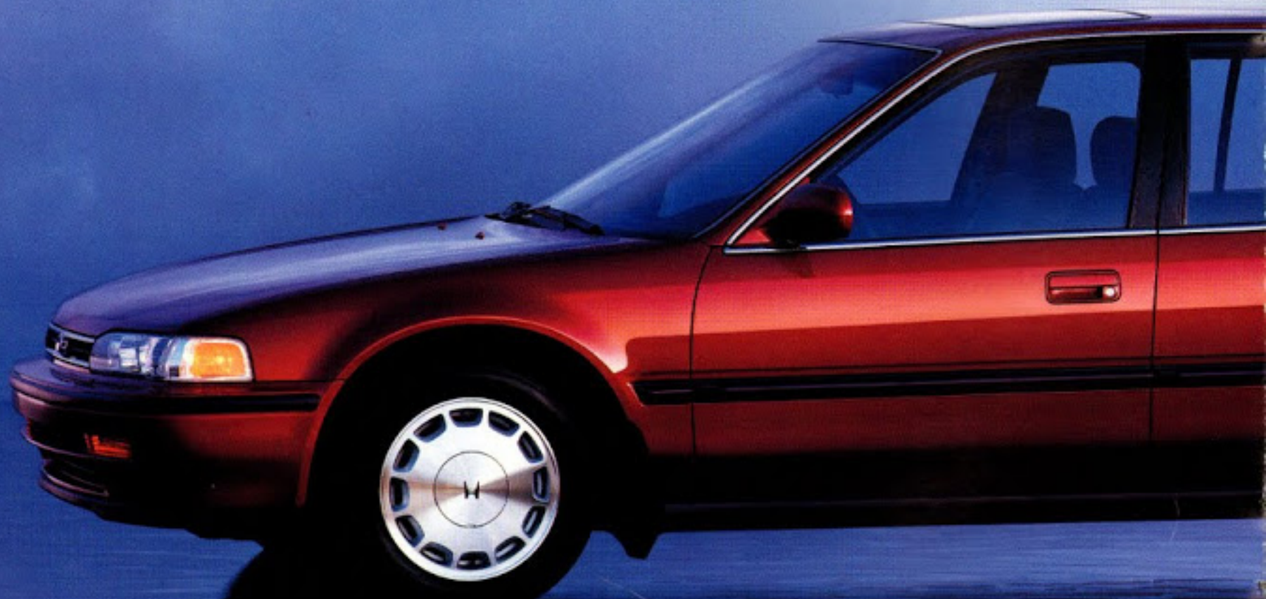
Accord EX Sedan shown in Bordeaux Red Pearl