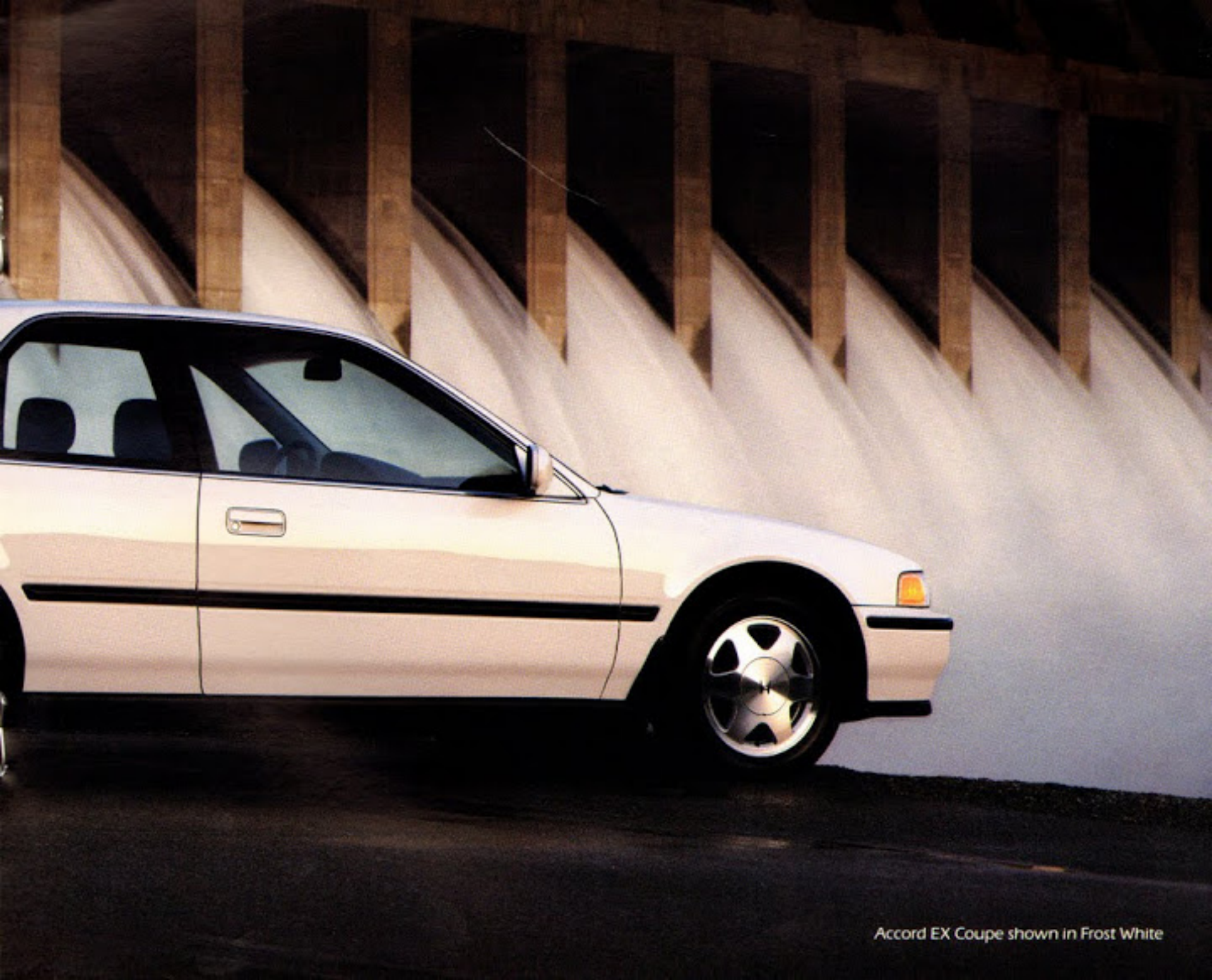
Accord EX Coupe shown in Frost White