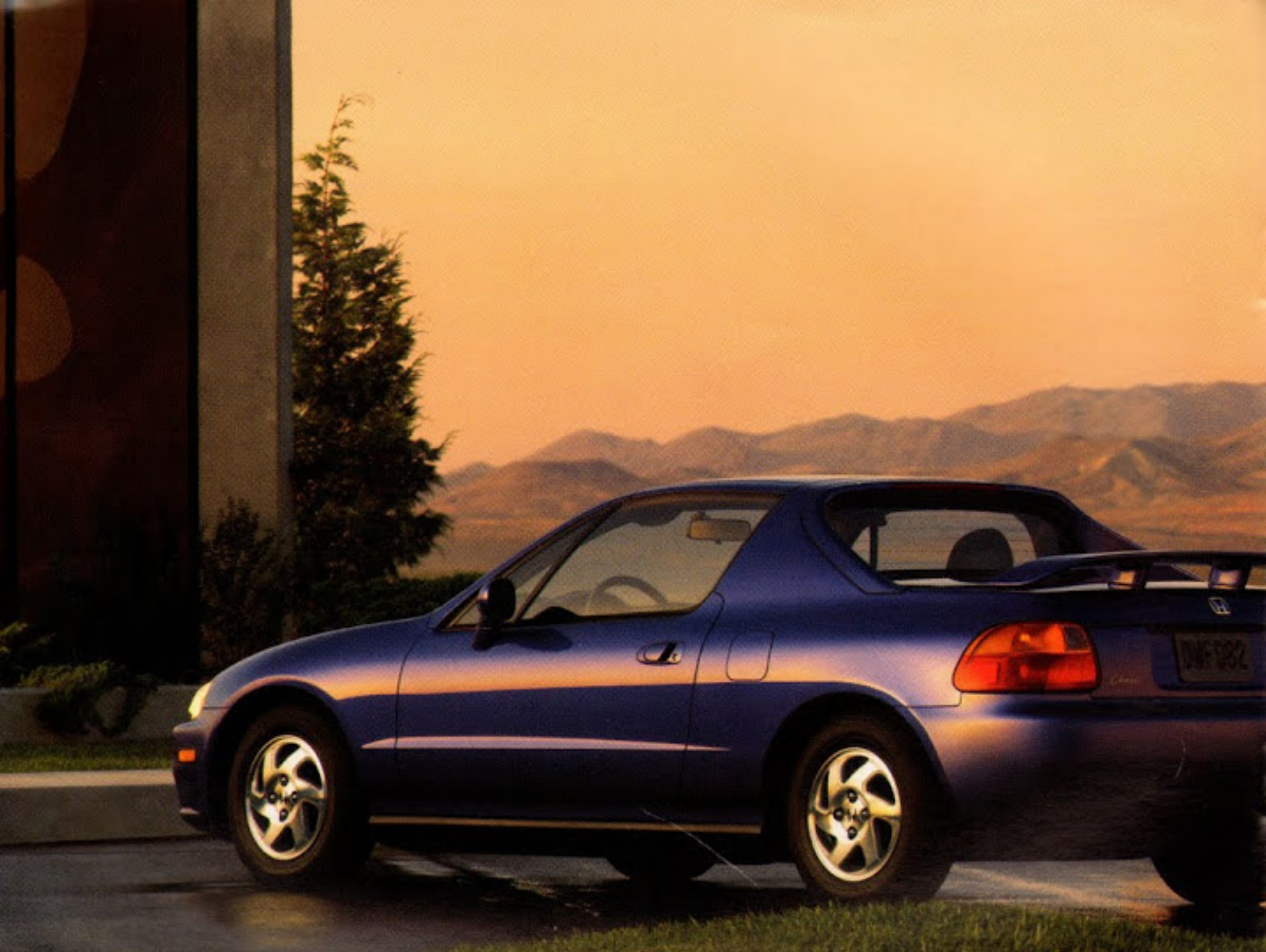
del Sol S shown in Captiva Blue Pearl with available spoiler and accessory wheels