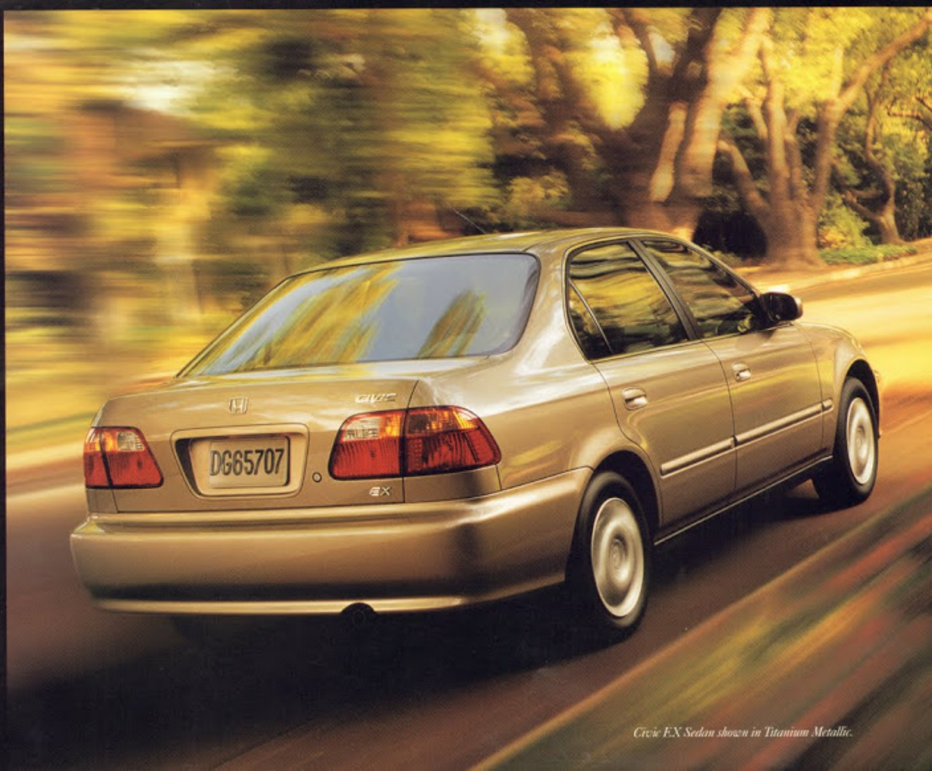
Civic EX Sedan shown in Titanium Metallic.