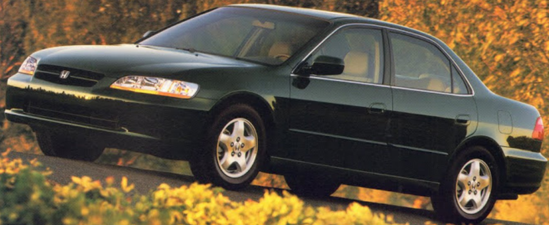
Accord EX V-6 Sedan shown in Dark Emerald Pearl.