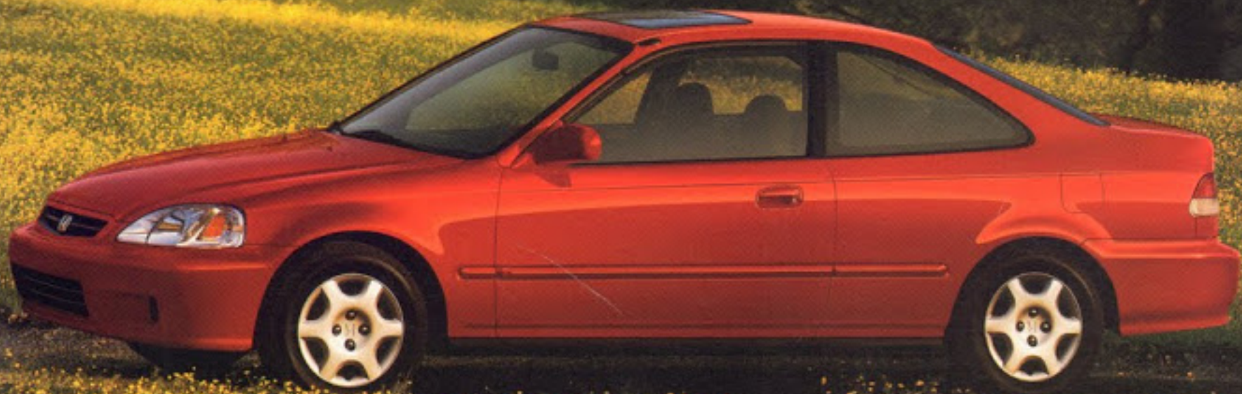
Civic EX Coupe shown in Milano Red.