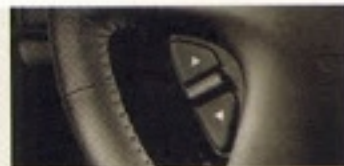
The Steering Wheel-Mounted Audio Controls on the EX V-6 allow you to adjust your stereo without taking your eyes off the road.

The Accord Coupe was clearly made to perform. The energetic 150-horsepower VTEC 4-cylinder engine holds its own. And the impressive 200-horsepower VTEC V-6 engine is one of the most powerful in its class. Yet you still get all of the comforts of a luxury car. It's quite spacious. And the seats hold you comfortably in place, even on the curviest