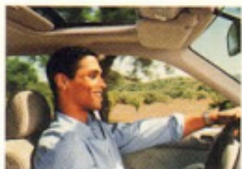
A Power Moonroof with tilt feature brings the sun and stars inside (EX).

The Civic Sedan satisfies your need for practicality and still shows you a good time. It has one of the most powerful engines in its class. And it is so quick, smooth and responsive, you could easily forget you have the luxury of four doors. There's a lot of room inside, too. Enough for front and rear passengers to stretch out. There are three models to choose from. The DX