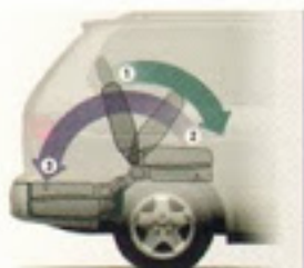
A third-row Magic Seat folds and retracts into the floor with ease.

Truly the minivan for the next century, the Odyssey is a technological marvel. From the first-of-its-kind, third-row Magic Seat ™ to the available Honda Satellite-Linked Navigation System ™ to the most powerful engine in its class. † Seven passengers ride comfortably here. With adjustable head restraints for everyone. As well as map lights and individual adjustable air-