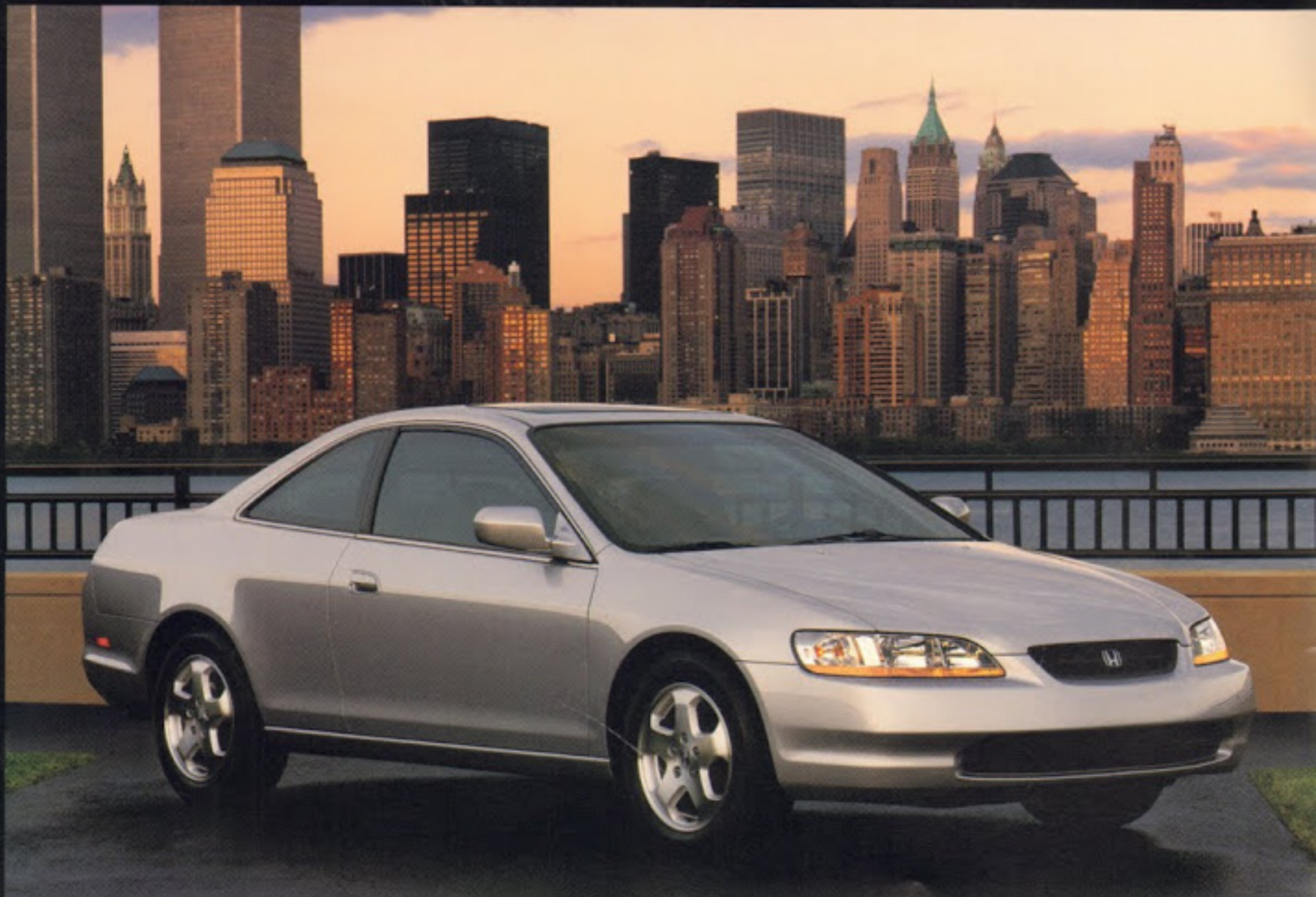
Accord EX V-6 Coupe shown in Satin Silver Metallic.