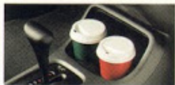
One of the two front Beverage Holders can hold a 32-ounce beverage.

The Civic Hatchback stands as a monument to versatility, fuel efficiency** and good times. The interior is comfortable and roomy enough for you and your friends. And it's nicely equipped with features you can appreciate. Such as an adjustable steering column and adjustable front-seat head restraints. Plus front seatbacks that