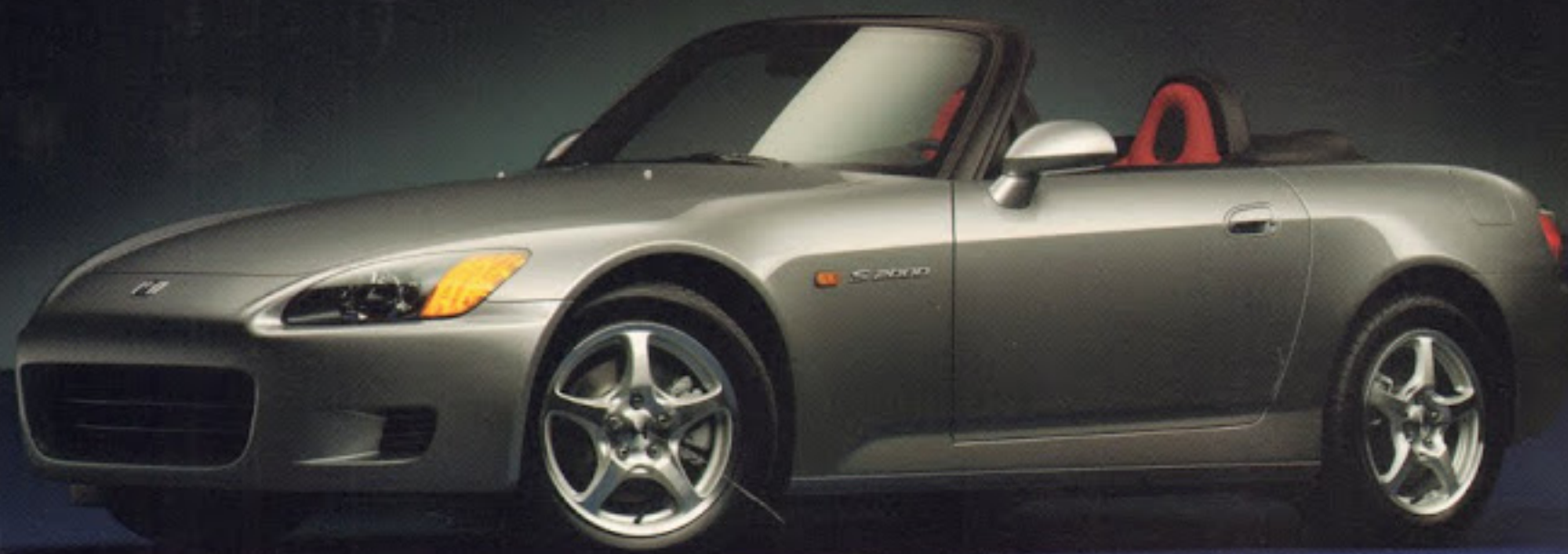
S2000 shown in Silverstone Metallic.