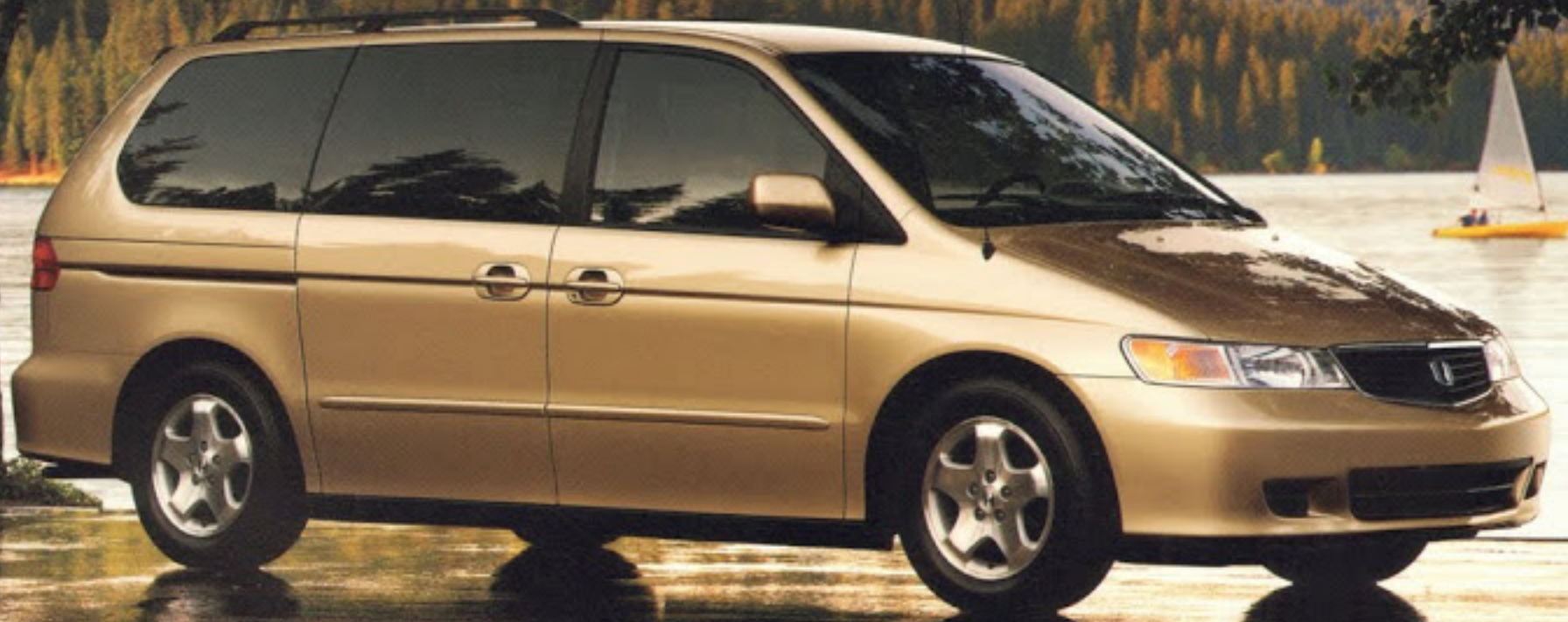
Odyssey EX shown in Mesa Beige Metallic