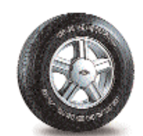
15" 5-spoke aluminum alloy wheels. Standard on Escape XLT, optional on XLS, P225/70Rx15 OWL all-season tires.