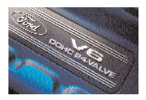
Available 3.0L Duratec V6 generates 201 HP@5900 rpm and 196 ft-lb torque@4700 rpm. Standard 2.0L Zetec I4 puts out 127 HP@5400 rpm and 135 ft-lb torque@4500 rpm.