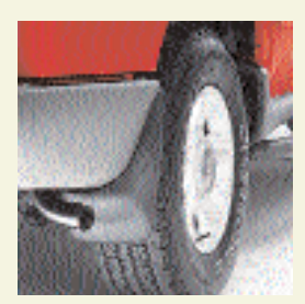
Mud flaps help keep debris from harming your SUV's finish.