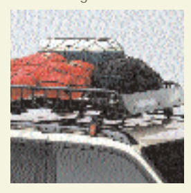
Run out of room? This removable Yakima cargo basket is a great way to expand storage.