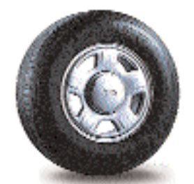
15" 5-spoke styled steel wheels. Standard on Escape XLS, P225/70Rx15 BSW all-season tires.