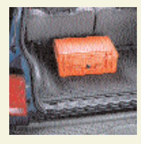
Keep the cargo area neat and clean with a custom-fit cargo mat.

Wherever your dream destination may be, your Ford Dealer can help you outfit your SUV with a wide range of dealer-installed gear. Be sure to check with them for availability and selection.