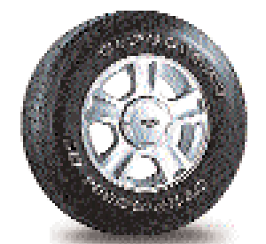
16" aluminum alloy wheel package includes 5-spoke wheels, P235/70Rx16 OWL all-season tires and wheel lip moldings. No Charge Upgrade on XLT 4x4 w/3.0L Duratec V6.