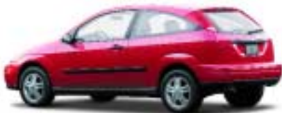
ZX3 in Infra-Red (available on all models)