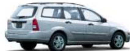
SE Wagon in CD Silver (available on all models)