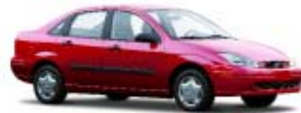
LX in Sangria Red (available on all models)