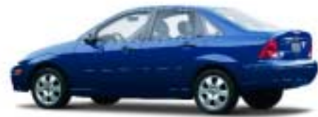
ZTS in Twilight Blue (available on all models)