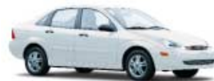
SE Sedan in Cloud 9 White (available on all models)