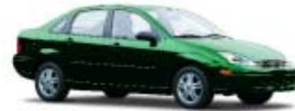
SE Sedan in Rainforest Green Clearcoat Metallic (available on all models)