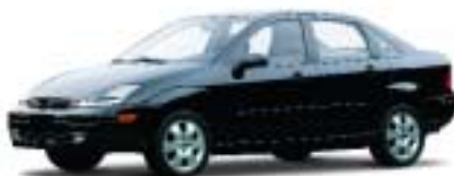
ZTS in Pitch Black (available on all models)