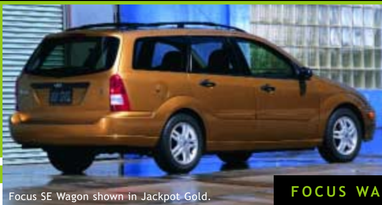
Focus SE Wagon shown in Jackpot Gold.

Sedan now doesn't mean sedate. Driving Focus ZTS is like being with the smartest, funniest person you know. Always a quick response. Always entertaining. Shown above painted in Pitch Black with its 16-valve Zetec sprinting effortlessly while its CD is cranked up.