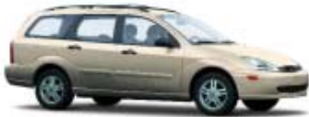
SE Wagon in Fort Knox Gold (also available on LX, SE Sedan and ZTS)