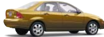
ZTS in Jackpot Gold (available on all models)