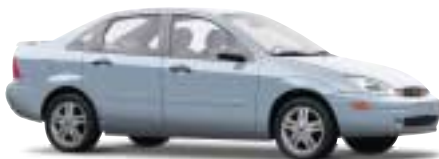
SE Sport in Light Sapphire Blue (also available on LX, SE Wagon and ZTS)