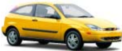
ZX3 in Egg yolk Yellow

Vehicles shown may include optional equipment.