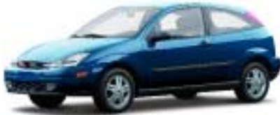
ZX3 in Malibu Blue