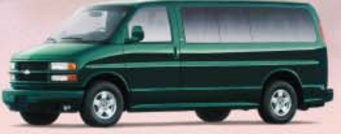
FOREST GREEN METALLIC

THE GM CARD<sup>®</sup> — What Are You Charging Toward?™ The GM Card rewards you 5% on every credit card purchase, making it the fastest way to save toward the GM car or truck of your dreams. For information or to apply for the GM Card, call 1-800-8GM-CARD or visit our web site at www.gmcard.com