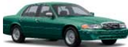
ASPEN GREEN METALLIC

Crown Victoria features Clearcoat paint for beauty and protection. Colors shown are representative only. See your dealer for actual paint/trim choices. Vehicles shown may contain optional equipment.