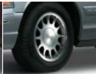
16" 12-spoke aluminum wheels standard on LX.