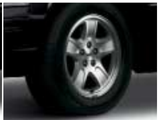
17" 5-spoke aluminum wheels standard on LX Sport.