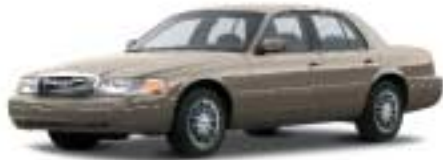
ARIZONA BEIGE METALLIC