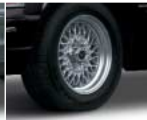
16" lacy-spoke aluminum wheels optional on LX.