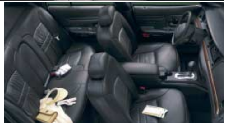
Discover the 5-passenger LX Sport. The Crown Victoria with a new attitude.