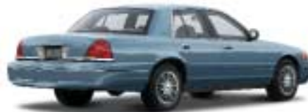
LIGHT ICE BLUE METALLIC