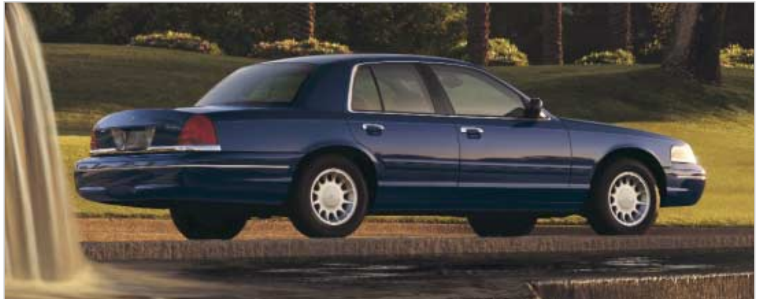
Crown Victoria LX shown in Deep Wedgewood Blue.

Set the position of the power adjustable pedals to your driving preference (a). Grasp the new "controls inclusive" steering wheel (b). These features are standard luxuries on both LX models. Now press the accelerator and feel what confident power can do for your well being. Some will call it luxury. We simply believe it's the way it should be.