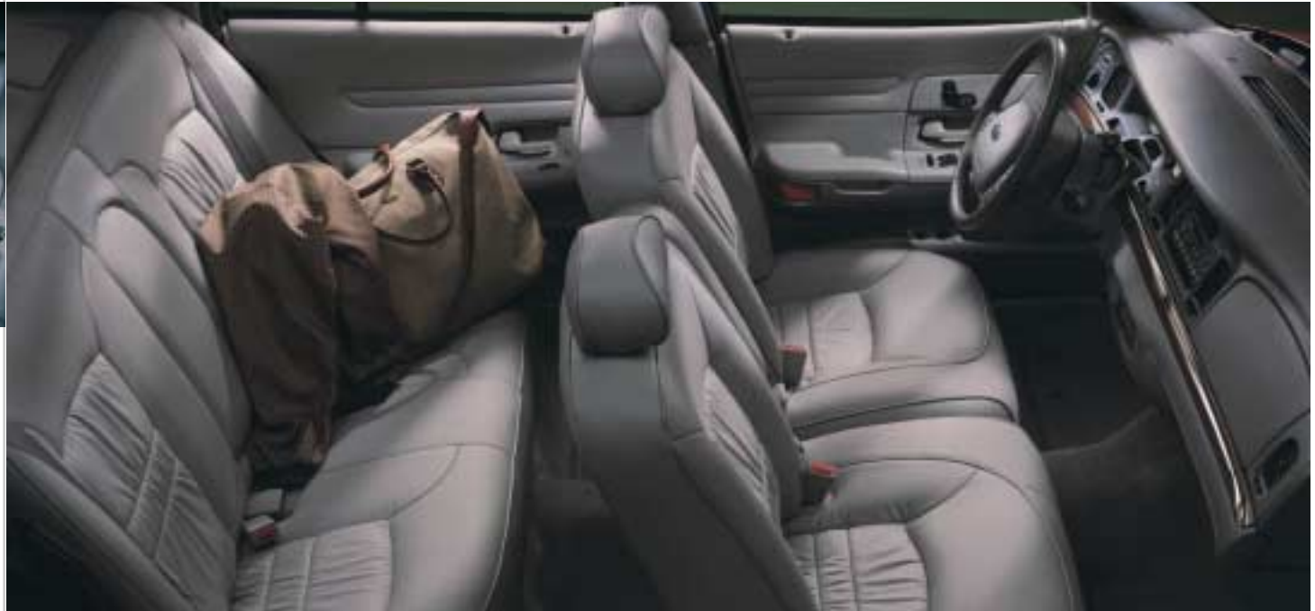
Crown Victoria LX shown in optional Light Graphite leather trim and with optional equipment.

Crown Victoria is spacious. Controls are conveniently positioned. At the right is the expansive 6-passenger interior. And below is something quite new. Introducing the LX Sport with 5-passenger seating. Sporty? Yes. Luxurious? Yes. And above is the fold-down rear armrest with built-in beverage holders. Thoughtful? Naturally.