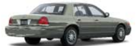
SPRUCE GREEN METALLIC