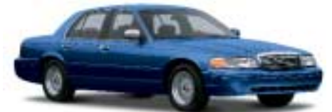
DEEP WEDGEWOOD BLUE METALLIC