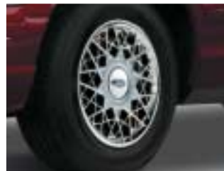
16" cross-spoke locking wheel covers standard on Crown Victoria.

Under the hood lies a 4.6L OHC SEFI V8 engine providing 220 horsepower and the oomph you'll need to navigate confidently around that semi you have been following forever.