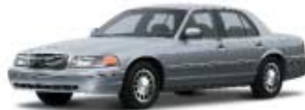
SILVER FROST METALLIC