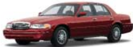
MATADOR RED METALLIC