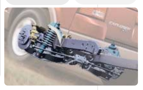
EXPLORER XLT 4X4, SHOWN WITH LOAD WARRIOR ACCESSORY.