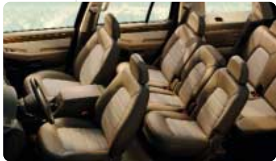
EXPLORER EDDIE BAUER IN MEDIUM PARCHMENT LEATHER TRIM WITH OPTIONAL THIRD-ROW SEAT.

KEEP CHAOS AT BAY AND MESSES AWAY WITH THE CARGO ORGANIZER ACCESSORY*. THE COMPARTMENT DIVIDERS ARE REMOVABLE AND ADJUSTABLE, AND THE ORGANIZER EASILY INSTALLS BEHIND EITHER THE SECOND OR THIRD SEAT WITH NO TOOLS.