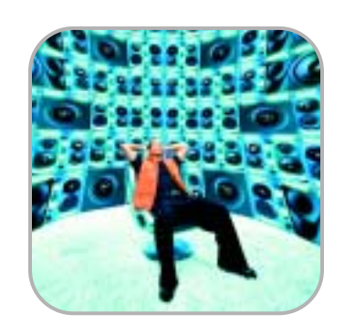
This is Focus. Turn it up. All the way up.

IT'S GUARANTEED TO EVOKE "OOHS AND AHHHS".