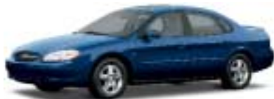
TRUE BLUE METALLIC