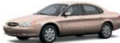
ARIZONA BEIGE METALLIC