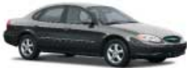
DARK SHADOW GREY METALLIC