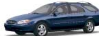
MEDIUM ROYAL BLUE METALLIC

Ford Taurus features Clearcoat paint for beauty and protection. All Taurus models are available in all colors. Vehicles may be shown with optional equipment.