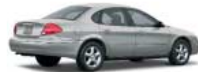
SILVER FROST METALLIC