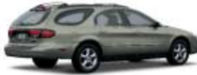
SPRUCE GREEN METALLIC