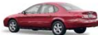
MATADOR RED METALLIC