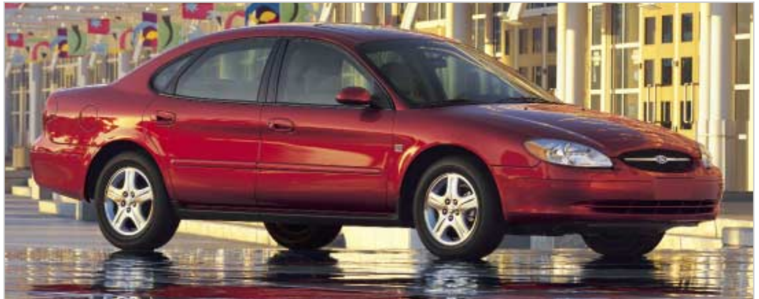
Taurus SEL Deluxe shown in Matador Red and with optional equipment.

It's no secret why so many people develop such an immediate connection with Taurus. Even for those who've just met, there's a feeling of trust that comes from its quick response and its generous 200-horsepower engine (optional). You just know it's going to be there for you when life throws you a hair-pin curve.