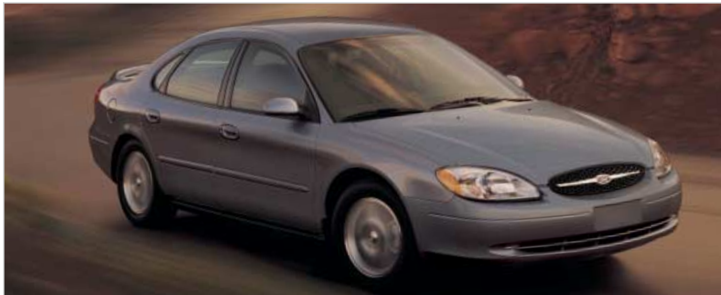
Taurus SEL Premium shown in Dark Shadow Grey and with optional equipment.

HE JUST HAPPENS TO NOW HAVE FOUR DOORS AND DISC BRAKES.