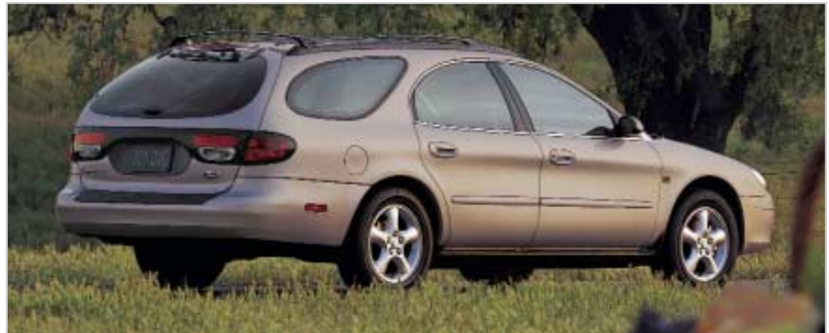
Taurus SE Wagon Premium shown in Arizona Beige.