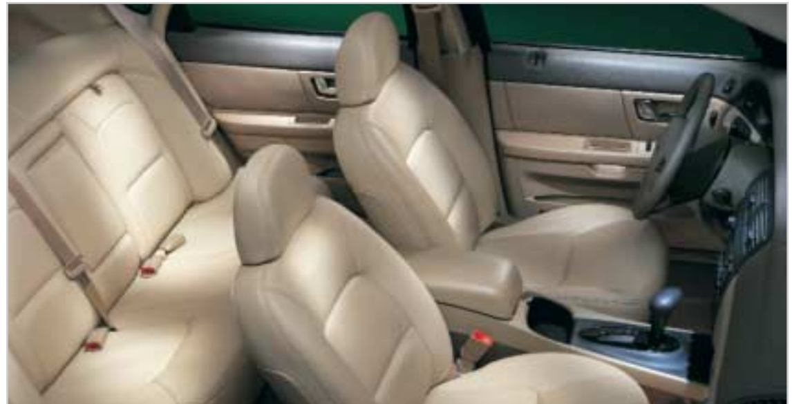
Taurus SEL shown with optional Medium Parchment leather trim.

Chrome door handles enhance every Taurus interior (a). Electronic automatic temperature controls (b) on SEL mean no fumbling for the "just-right" setting. Optional power adjustable pedals (c) assure a comfortable driving position. A single-disc CD (d) is available. Another smart touch — automatic headlamps (e) on SEL models. Say goodbye to remembering to turn on...or off your lights.