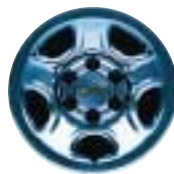
16" CHROME STAINLESS-STEEL WHEELS Standard on 1500, 2500 LS models. 1500 six-lug shown.