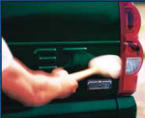
Silverado's available PRO-TEC box resists dents and dings.