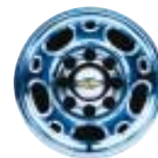
16" FORGED ALUMINUM WHEELS Standard on 2500 LT models. Available on 2500 LS models.