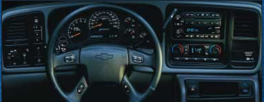
Silverado 1500 LT 4x4 Extended Cab instrument panel shown in Medium Gray with optional equipment.