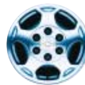
16" CAST-ALUMINUM WHEELS Standard on 1500 LT models. Available on 1500 LS models.