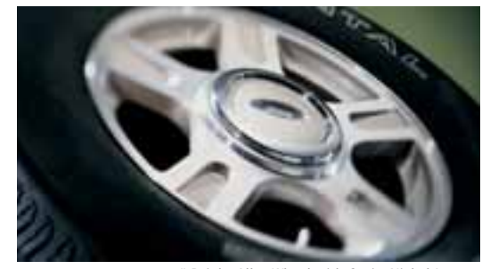
17" Bright Alloy Wheel with Satin-Nickel Inserts Standard on Eddie Bauer

Ford uses clearcoat paint for beauty and protection. Colors shown are representative only. See your dealer for actual paint/trim options.