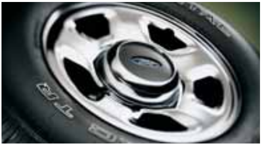
17" Steel Wheel ** Standard with painted finish on XLT Value Standard with chrome finish on XLT FX4 Off-Road (shown)