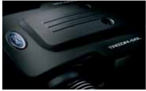
4.6L V8 Engine