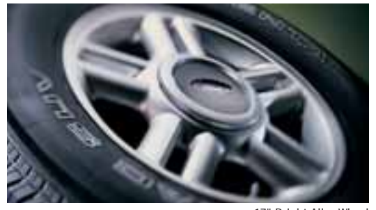
17" Bright Alloy Wheel Standard on XLT Popular and XLT Premium