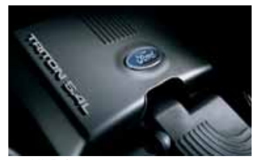
5.4L V8 Engine