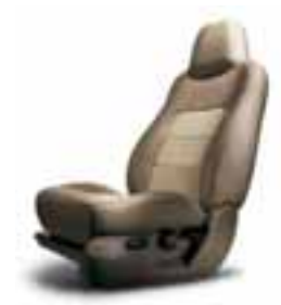
Eddie Bauer Medium Parchment Two-Tone Leather Seat