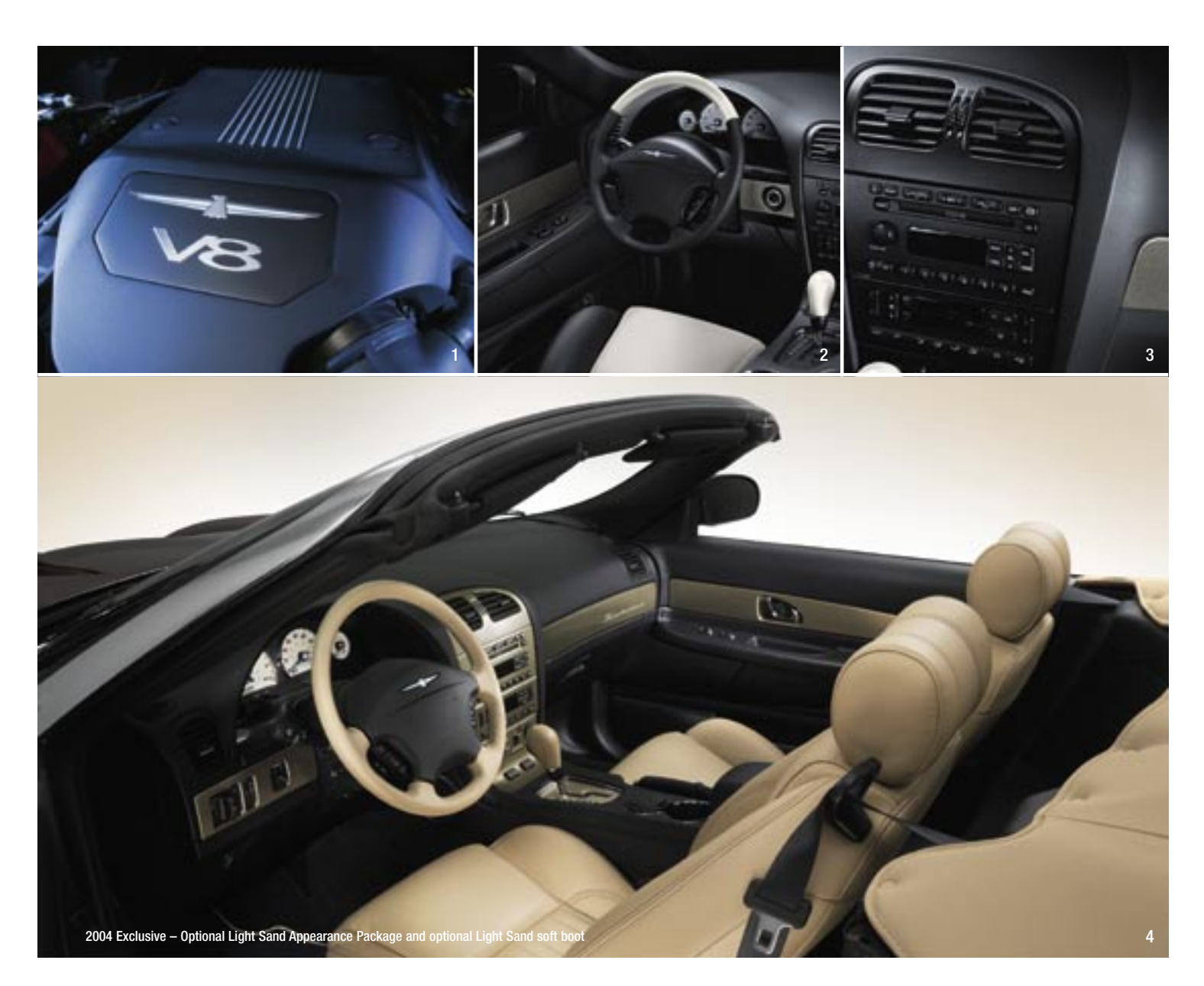
In Need to get somewhere fast? The standard 32-valve 3.9L V8 engine delivers the power of 280 horses and 286 lbs.-ft. of torque. In There are six interior color choices when it comes to Thunderbird − all in premium leather trim. The Partial Color Accent Package in Performance White is shown here. In This AM/FM Audiophile™ Sound System has a 6-disc in-Audiophile is a trademark of Audiophile, Inc.

dash CD player and is SIRIUS Satellite Radio capable.* 4 The newest look in Thunderbird interiors is the Light Sand Appearance Package. The instrument cluster gauges are cream-colored, Bronze Metallic-tinted appliqués can be found throughout and the leather-trimmed seats feature contrasting black stitching. The package comes with matching Light Sand convertible top. *SIRIUS capable. SIRIUS is a dealer-installed option.