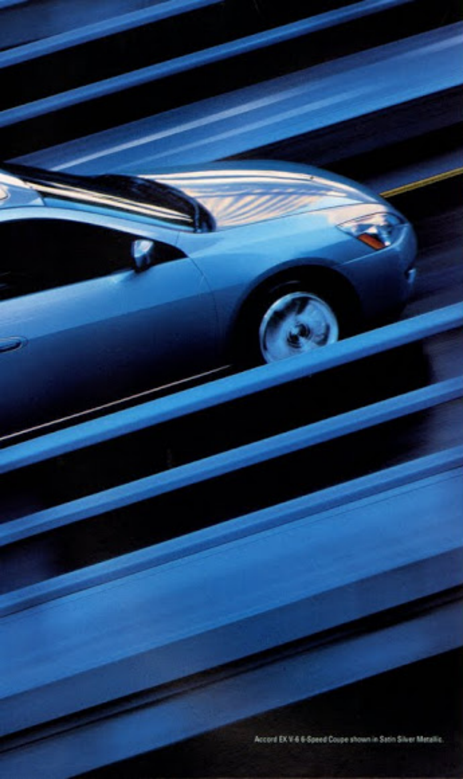
Accord EX V-6 6-Speed Coupe shown in Satin Silver Metallic.