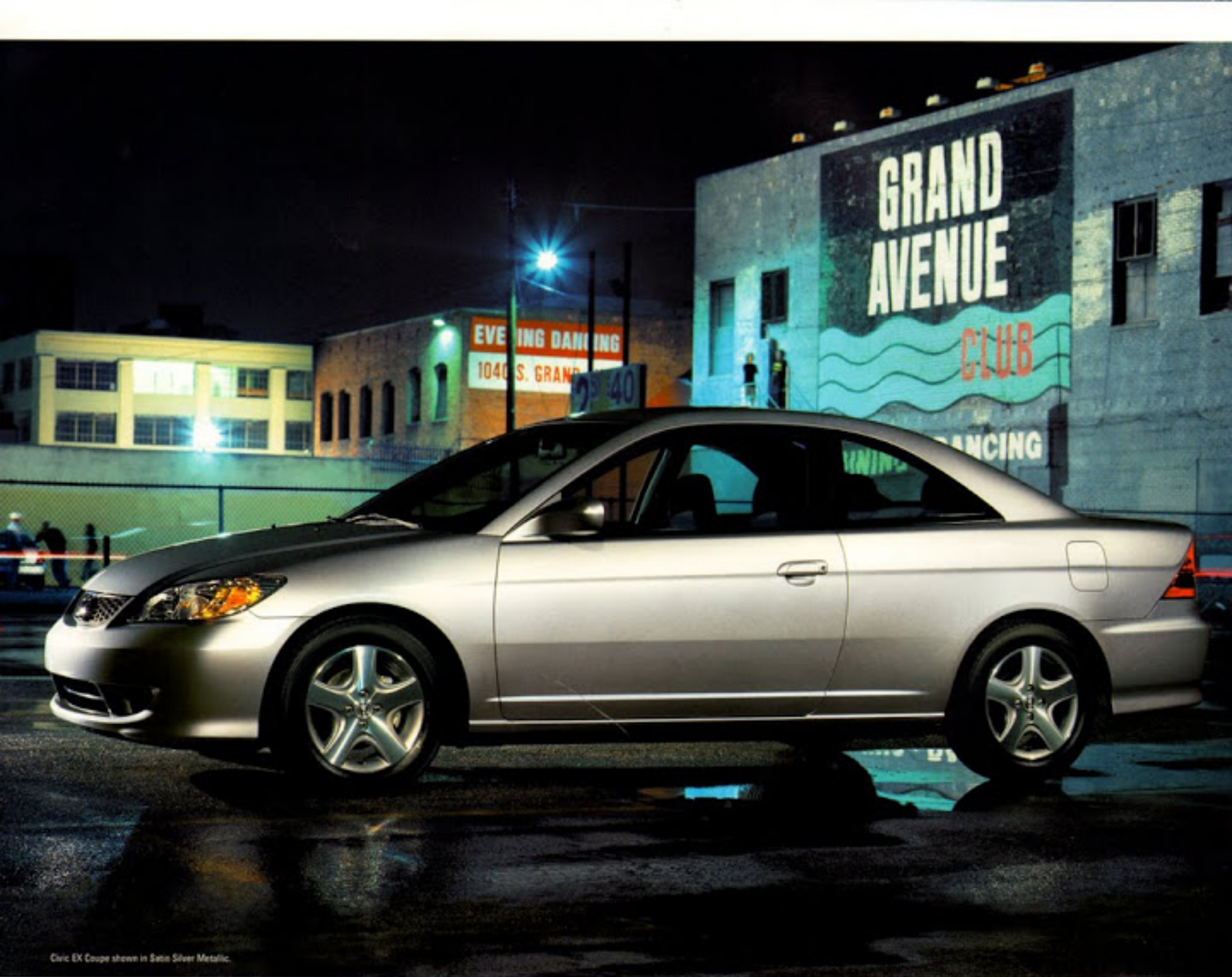
Chevrolet EX Coupe shown in Satin Silver Metallic.