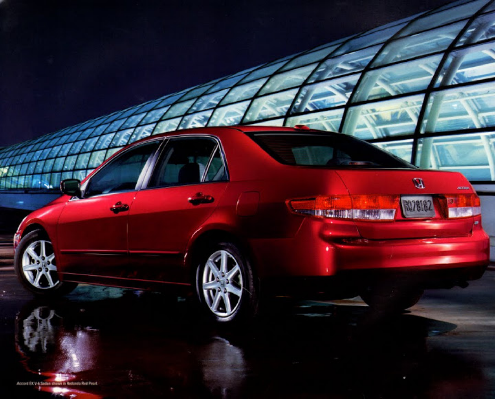
Accord EX V-6 Sedan shown in Radiant Red Pearl.