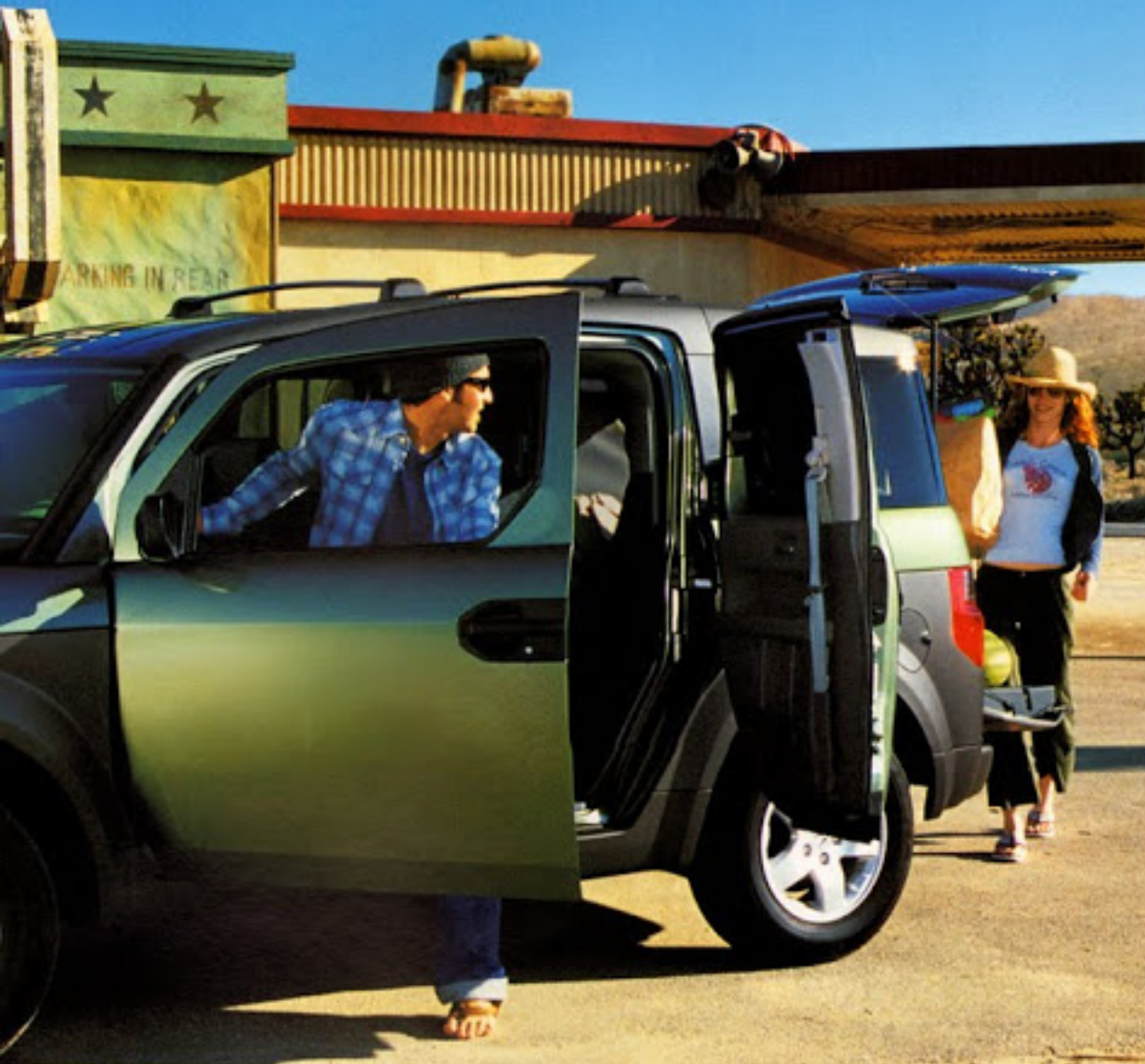
Element 4WD EX shown in Galapagos Green Metallic with accessory roof rack and fog lights.