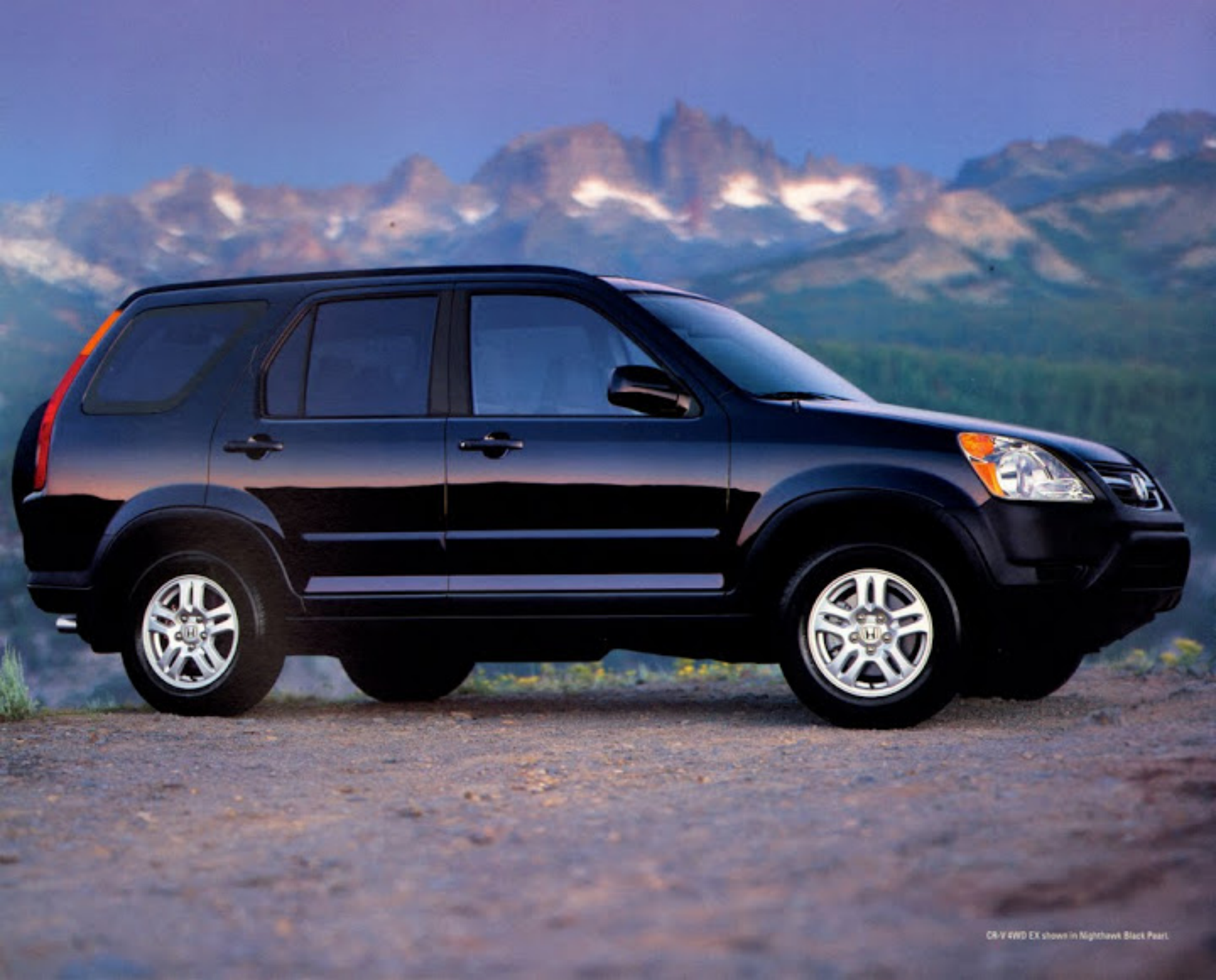
CR-V 4WD EX shown in Nighthawk Black Pearl.