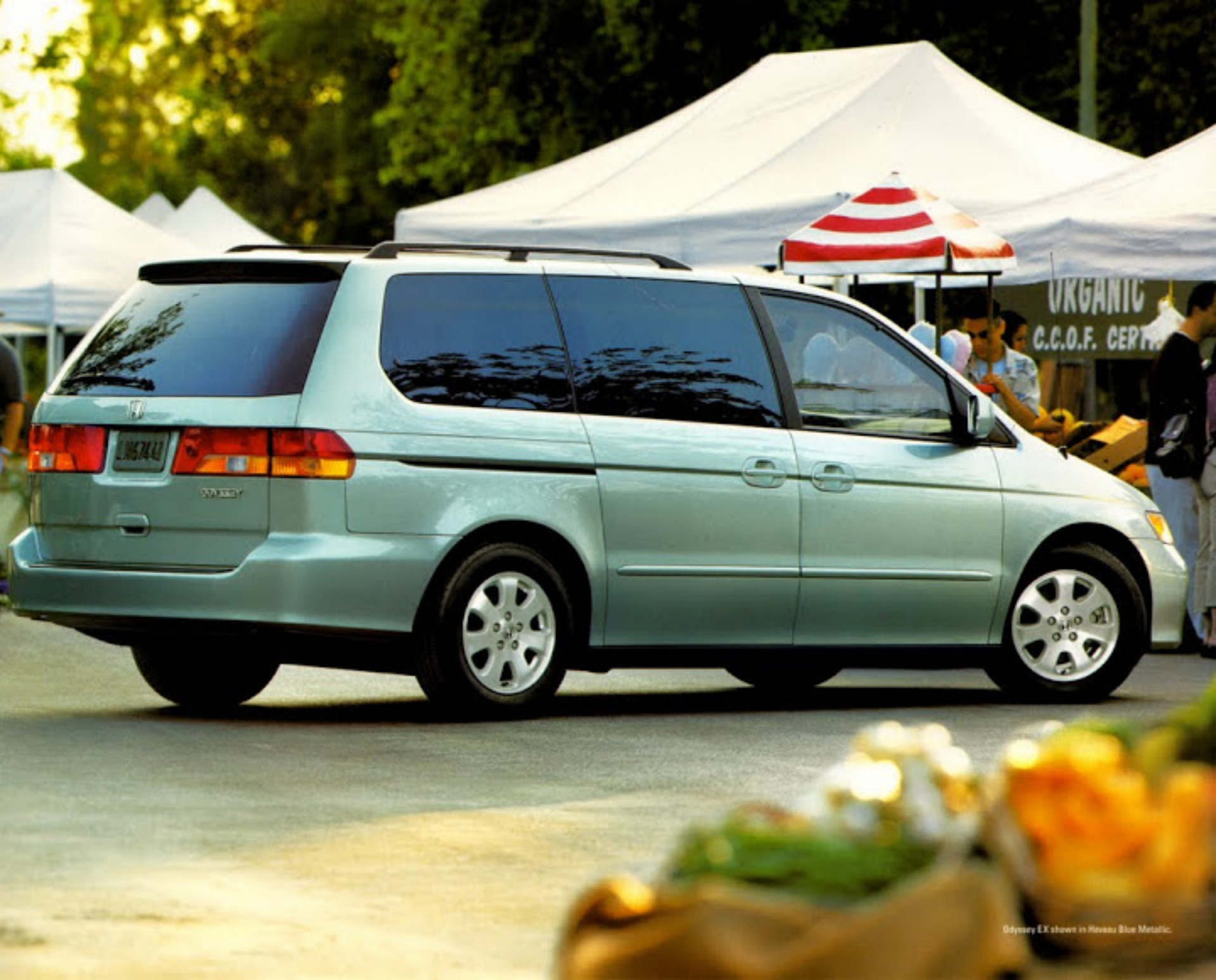
Odyssey EX shown in Nouveau Blue Metallic.