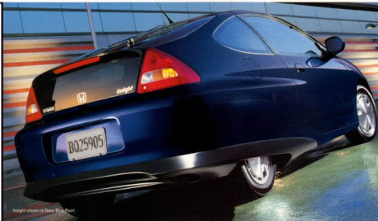
Insight shown in Navy Blue Pearl.

5-Speed Manual Transmission (City/Highway): 60/66 Continuously Variable Transmission (City/Highway): 57/56 Fuel (gal.): 10.6