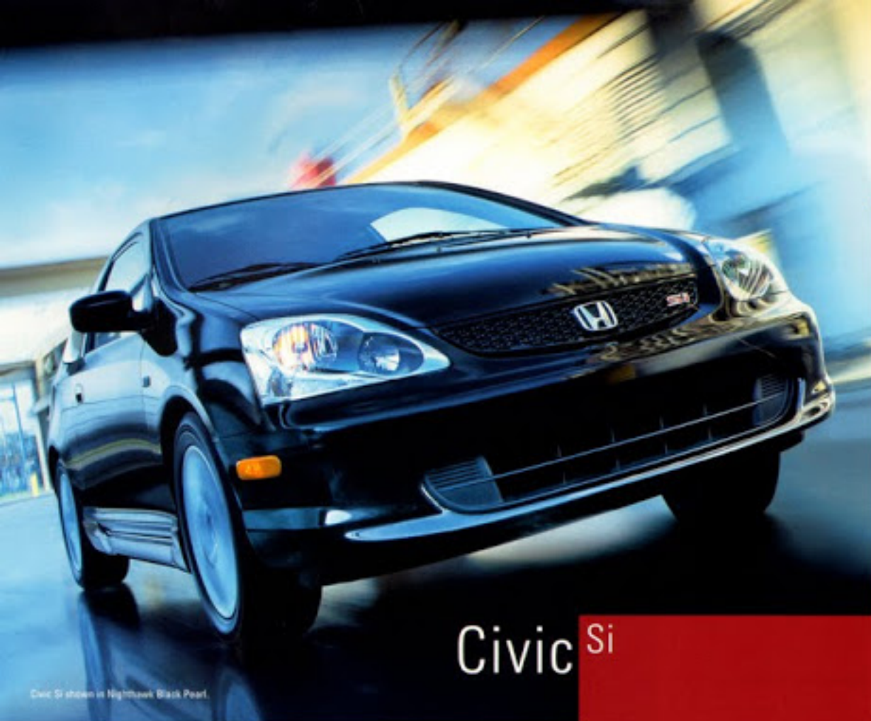
Civic Si shown in Nighthawk Black Pearl.