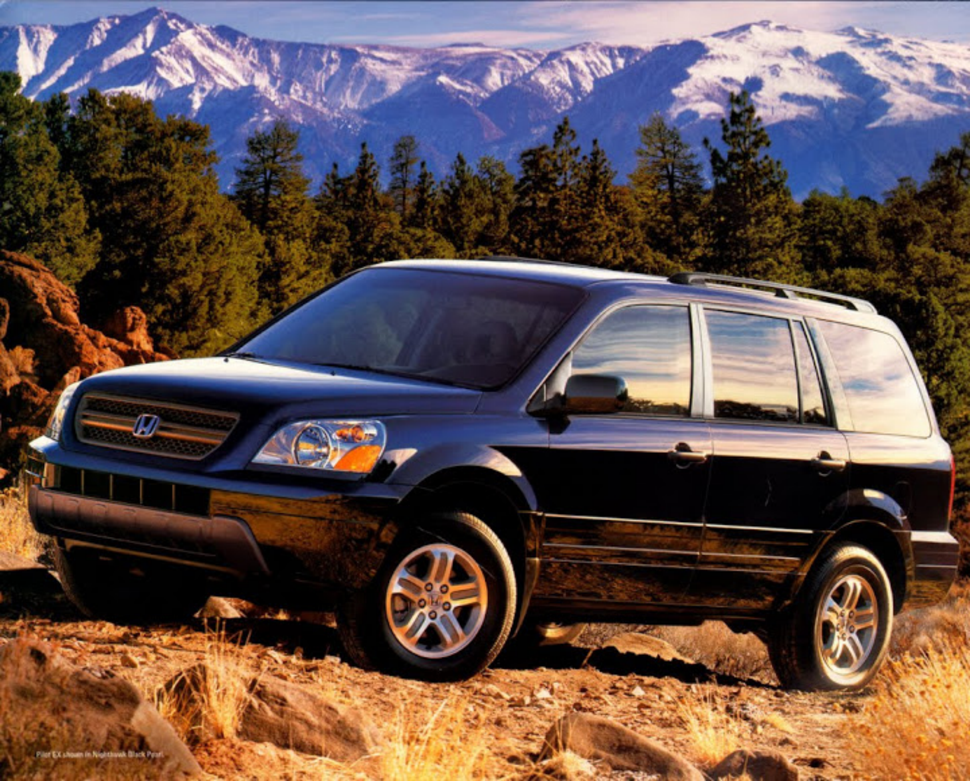
Pilot EX shown in Nighthawk Black Pearl