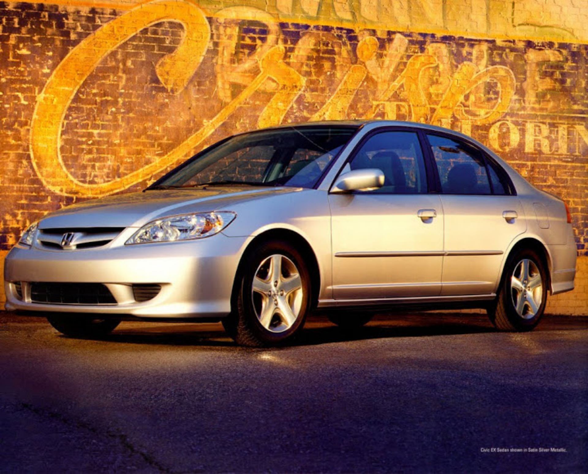
Civic EX Sedan shown in Satin Silver Metallic.