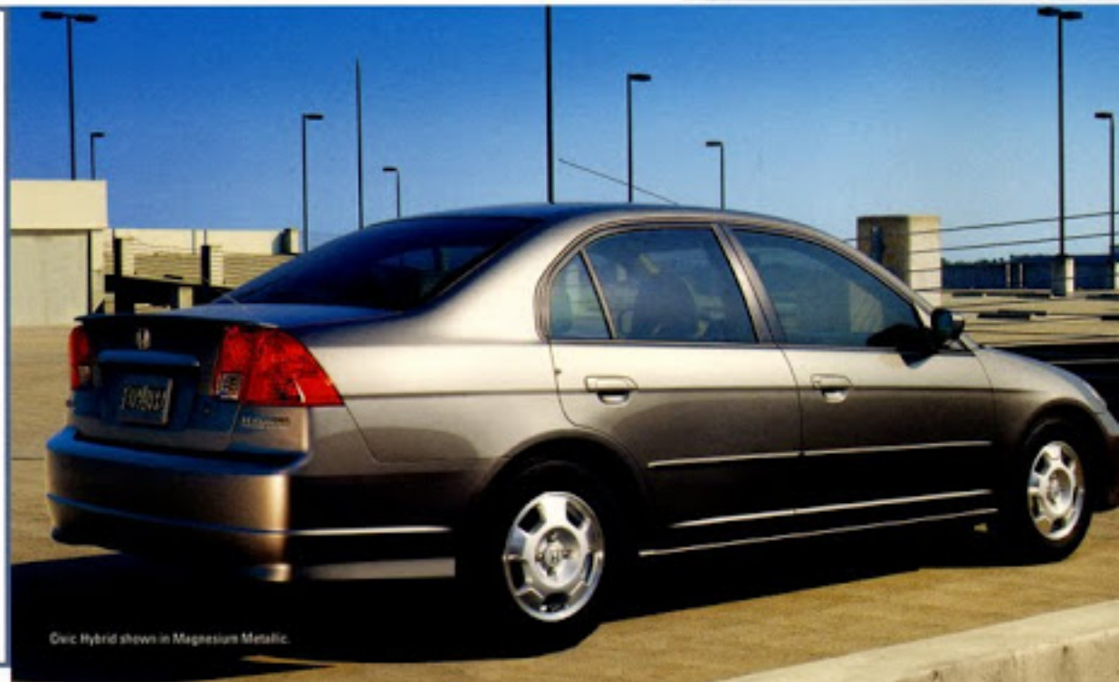
Civic Hybrid shown in Magnesium Metallic.

5-Speed MT (City/Highway): 46/51 (ULEV), 45/51 (AT-P2EV) CVT (City/Highway): 48/47 (ULEV), 47/48 (AT-P2EV) Fuel (gal, ULEV/AT-P2EV): 13.2/11.9