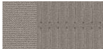
Medium Light Stone Cloth 1 Standard on XLT