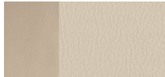
Camel Leather with Sand Inserts Standard on Eddie Bauer and Limited Optional on XLT