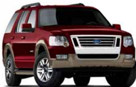
Dark Cherry Metallic