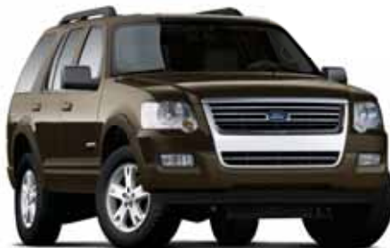
Stone Green Metallic