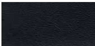
Charcoal Black Leather Standard on Limited