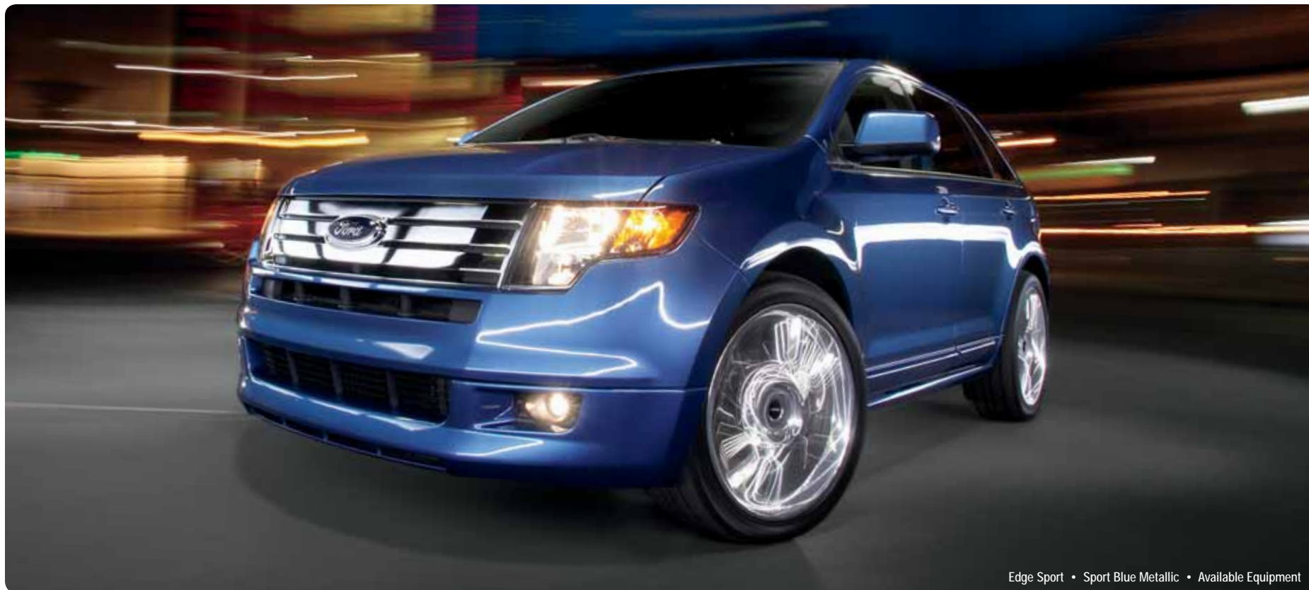
Edge Sport • Sport Blue Metallic • Available Equipment