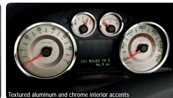
Textured aluminum and chrome interior accents