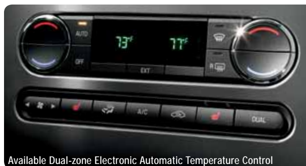
Available Dual-zone Electronic Automatic Temperature Control