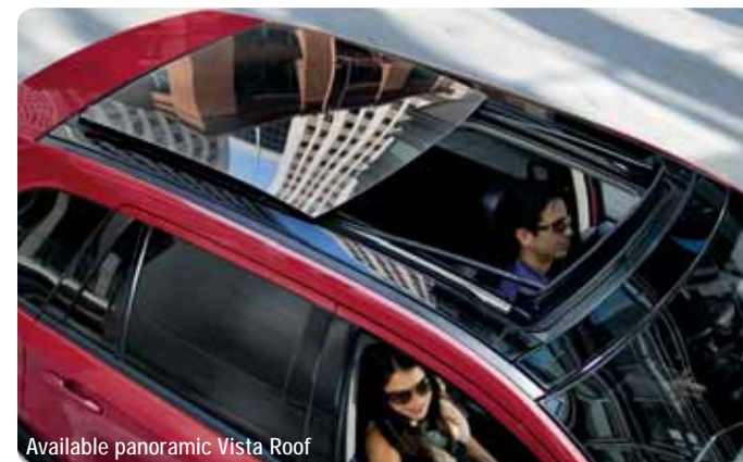
Available panoramic Vista Roof

Alcantara is a registered trademark of Alcantara S.p.A., Italy.