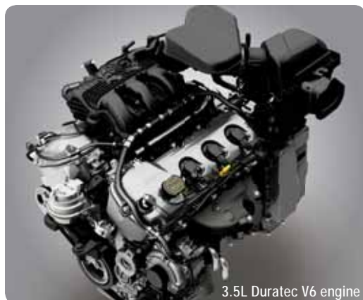
3.5L Duratec V6 engine