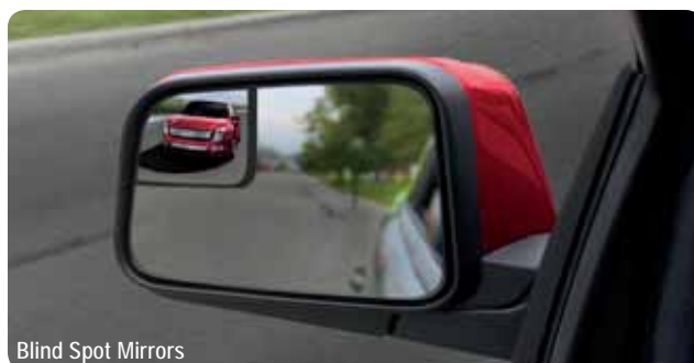
Blind Spot Mirrors