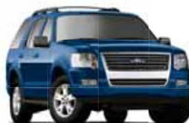
Sport Blue Metallic