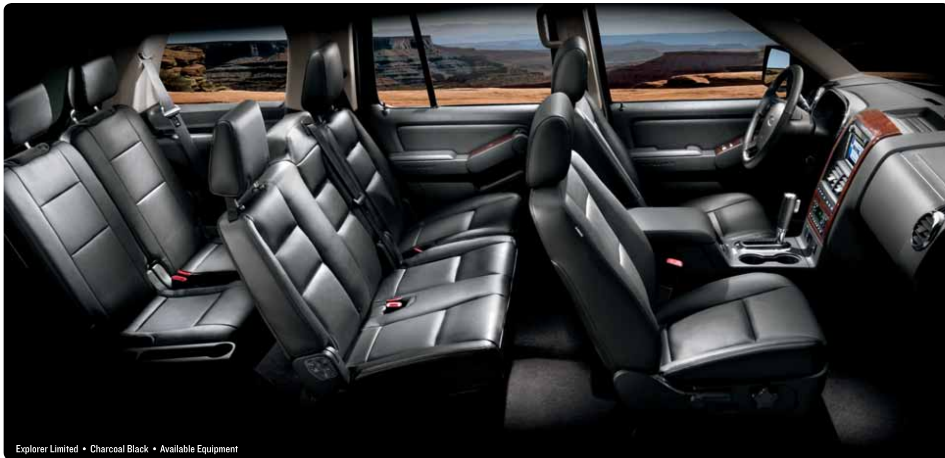
Explorer Limited • Charcoal Black • Available Equipment