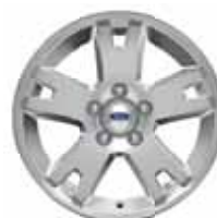
17" Machined-Aluminum Included in XLT Appearance Package