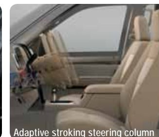
Adaptive stroking steering column