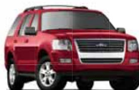
Sangria Red Metallic