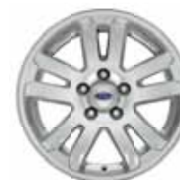
17" Painted-Aluminum Standard on Eddie Bauer