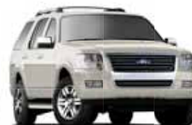
White Sand Tri-Coat Metallic