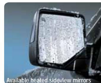
Available heated sideview mirrors