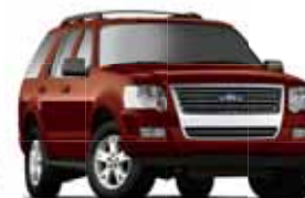
Dark Copper Metallic