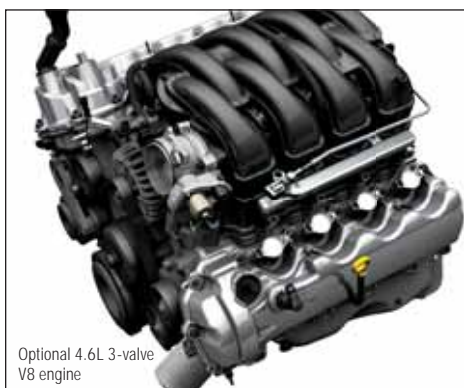
Optional 4.6L 3-valve V8 engine