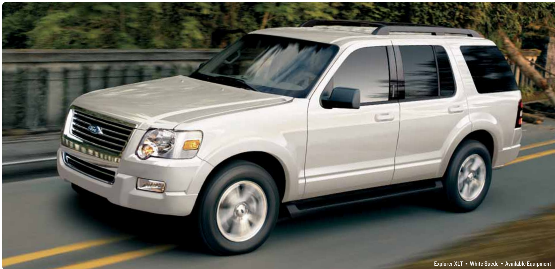
Explorer XLT • White Suede • Available Equipment