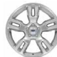
20" Polished-Aluminum Optional on Eddie Bauer and Limited; Included in XLT Sport Package

Ford uses clearcoat paint for beauty and protection. Colors shown are representative only. Not all colors are available on all models. See your dealer for actual paint/trim options. Vehicles shown may contain optional equipment.