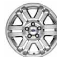
18" Chrome-Clad Aluminum Standard on Limited; Optional on Eddie Bauer