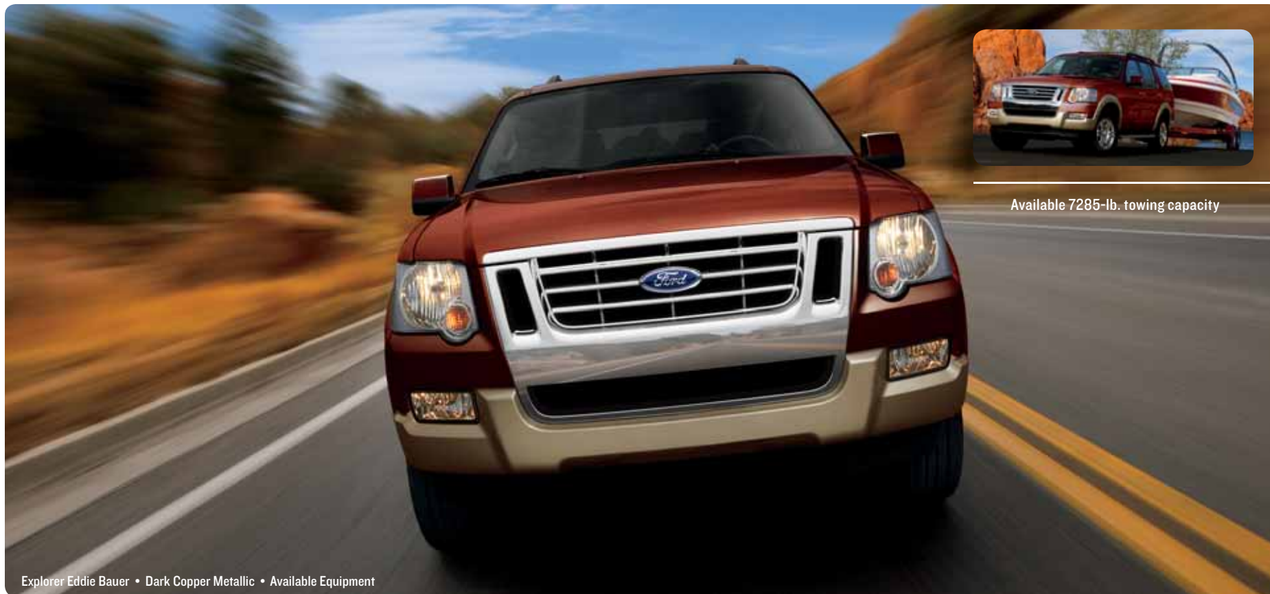
Explorer Eddie Bauer • Dark Copper Metallic • Available Equipment