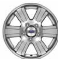
16" Painted-Aluminum Standard on XLT