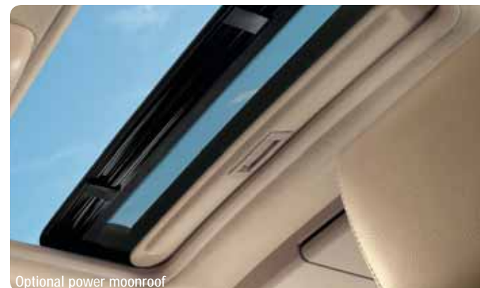
Optional power moonroof

PowerFold ™ 3rd-row seat and auxiliary rear climate control (Available on Eddie Bauer 1 )