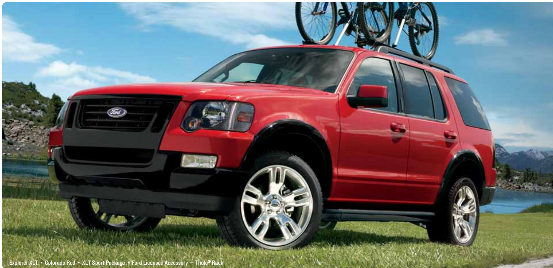
Explorer XLT • Colorado Red • XLT Sport Package • Ford Licensed Accessory — Thule® Rack