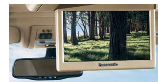
Change "Are we there yet?" to "Can we circle the block?" with the available DVD entertainment system. The system offers an 8-inch-diagonal monitor that can entertain the pickiest backseat driver.