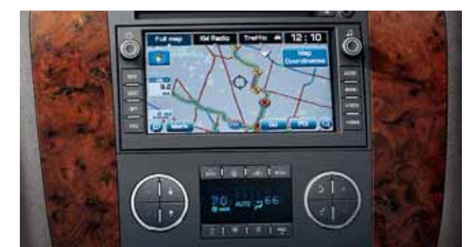
The available touch-screen navigation radio ^4 includes a 6.5-inch-diagonal color display. Standard on LTZ.

The patriarch of family vehicles, Suburban is the SUV designed to carry both cargo and people. It's utilitarian, but what's most useful is its ability to keep you comfortable and entertained. Whether you're enjoying standard XM RADIO¹ with three trial months or the 360-degree listening experience of the Bose® Centerpoint® Surround Sound system – standard on LTZ – Suburban puts you center stage. Keeping cool or warming up is easy with LTZ since it comes with standard HEATED AND COOLED FRONT BUCKET SEATS; heated, second-row leather-appointed bucket seats; and a third row that features a three-person, stadium-style bench seat. And the greatest comfort is knowing you'll have help getting where you want to go with OnStar² standard for the first year and TURN-BY-TURN NAVIGATION³ included in the Directions & Connections Plan (standard on LT and LTZ). Simply press the OnStar button and tell an Advisor where you need to go. The route will be downloaded to your Suburban while an automated voice guides you through every turn until you get to your destination.