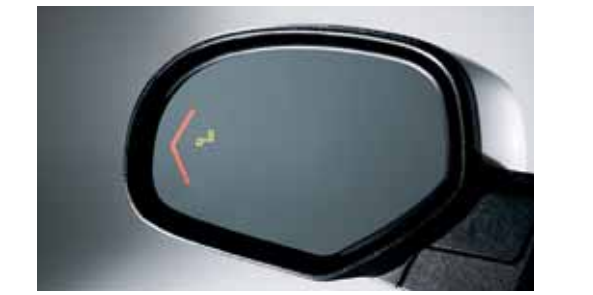
Suburban LTZ can be equipped with the Side Blind Zone Alert to help make changing lanes easier. Through the use of radar, it gives you a visual warning in the outside rearview mirrors to alert you to vehicles entering your blind spots.