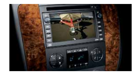
An available rearview camera system helps drivers hook up to a boat or simply see certain stationary obstacles on the navigation screen (shown) or in the rearview mirror while driving in Reverse at low speeds. It's almost like having eyes in the back of your Suburban. Standard on LTZ.

The most important cargo you'll ever carry is your family and friends. Suburban provides six air bags' – including DUAL-STAGE FRONTAL AIR BAGS and FRONT SEAT-MOUNTED SIDE-IMPACT AIR BAGS for driver and right-front passenger and HEAD-CURTAIN SIDE-IMPACT AIR BAGS¹ that protect outboard occupants in all three rows – giving you the peace of mind you expect from Suburban. OnStar,² standard for the first year, comes with AUTOMATIC CRASH RESPONSE.³ If you are in a mishap, built-in vehicle sensors can automatically alert an OnStar Advisor, who is immediately connected into your vehicle and can request that emergency help be sent to your exact GPS location. Stay safe by staying on course with the standard STABILITRAK ELECTRONIC STABILITY CONTROL SYSTEM with Traction Control. It's designed to help you avoid what the road might throw at you by improving vehicle stability, particularly during emergency maneuvers.