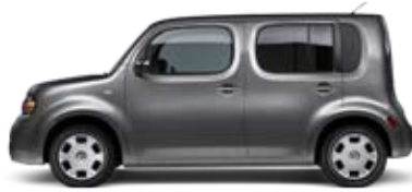
1.8 S: ADD IN EXTRA AMENITIES.