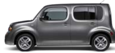
1.8 SL: IT'S YOUR MOBILE DEVICE.