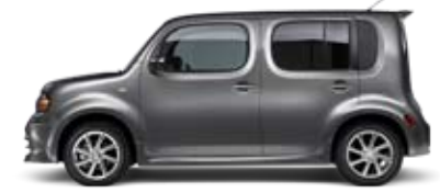
KRÖM ™ : NOW THIS IS EDGY.