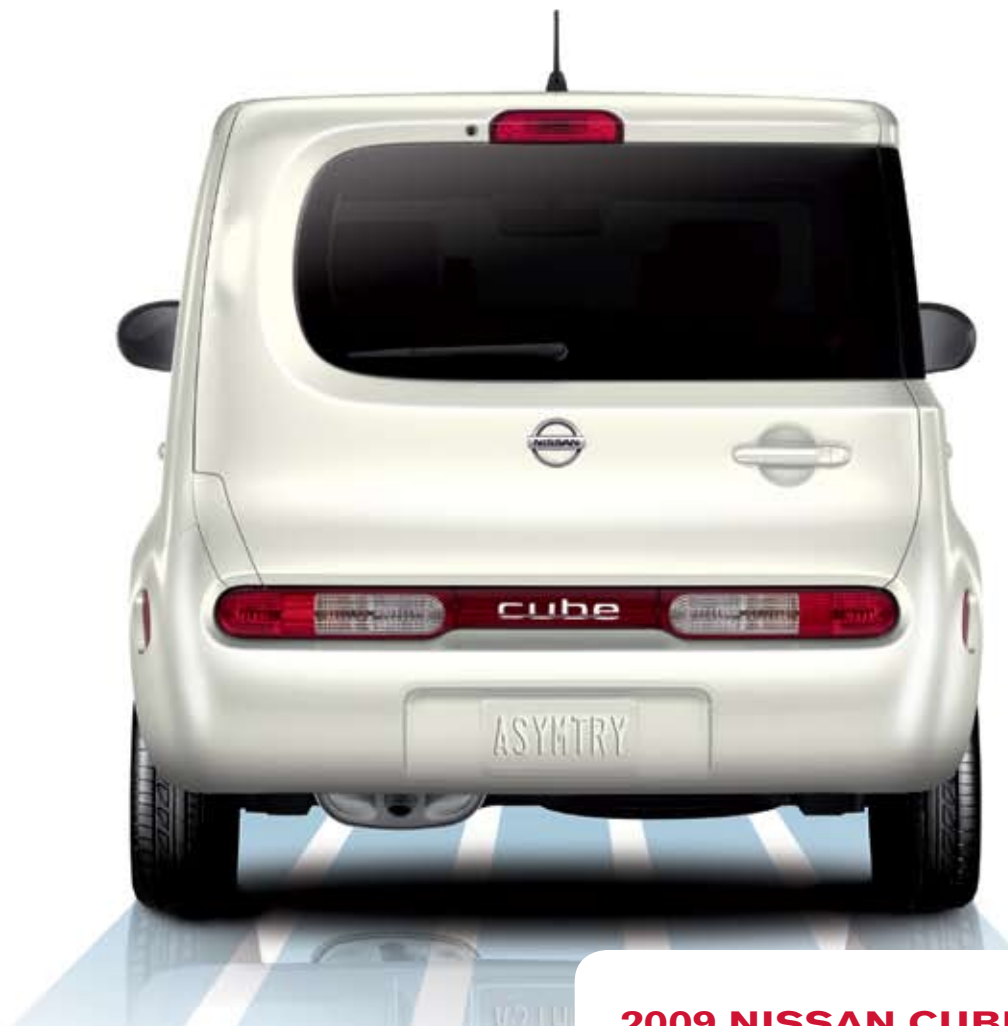
cube® 1.8 SL in Pearl White.