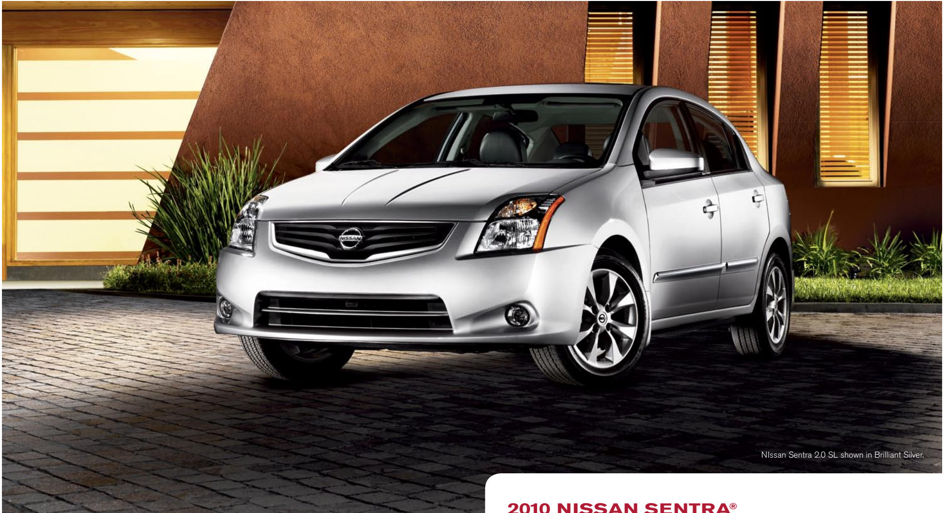
Nissan Sentra 2.0 SL shown in Brilliant Silver.