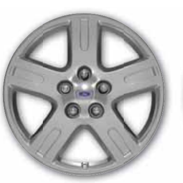
16" Cast-Aluminum Standard on Hybrid