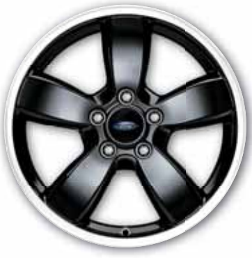
17" Premium Black with Machined-Finish Outer Ring Sport Appearance Package on XLT