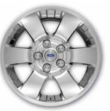
16" Bright Machined-Aluminum Standard on Limited and Hybrid Limited