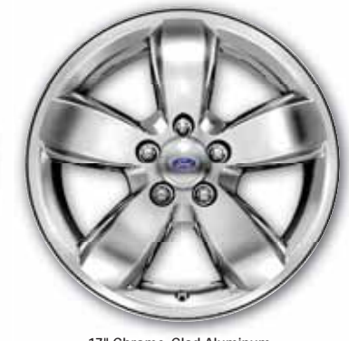
17" Chrome-Clad Aluminum Optional on XLT and Limited