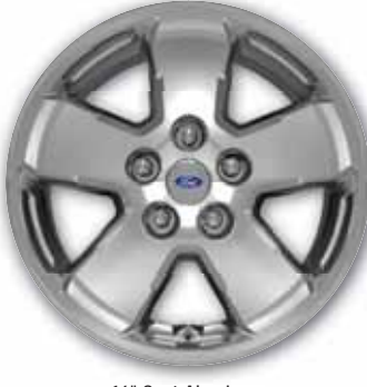
16" Cast-Aluminum Standard on XLS and XLT