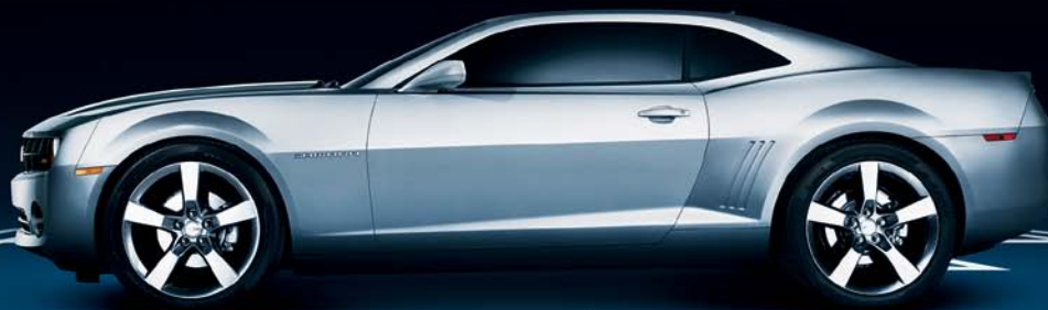
Camaro 1LT in Silver Ice Metallic. Shown with available RS Package and polished-aluminum wheels.

Some standard content may be deleted with fleet orders. See dealer for details.