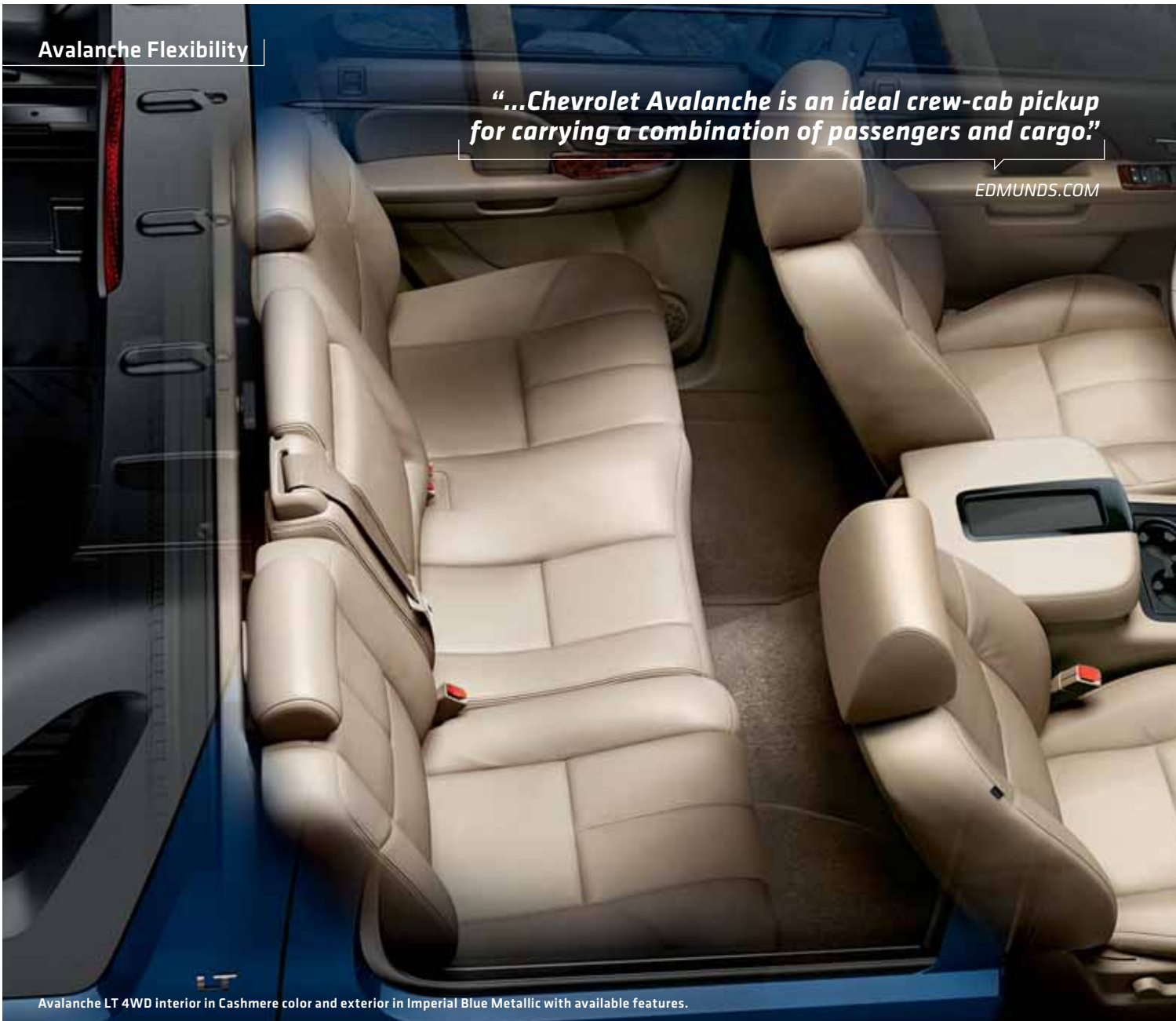
Avalanche LT 4WD interior in Cashmere color and exterior in Imperial Blue Metallic with available features.