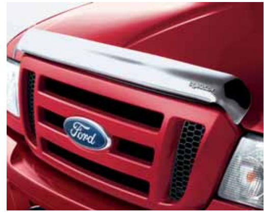
Hood Deflectors (Also Available in Smoke)