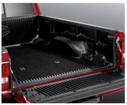
Bedliner and Tailgate Liner