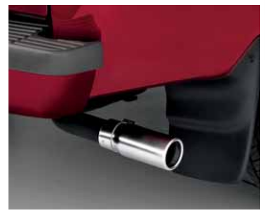
Chrome Exhaust Tip