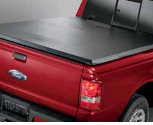
Soft Folding Tonneau Cover by Advantage<sup>1</sup>

Garmin is a registered trademark of Garmin Ltd. SmartAlert is a registered trademark of Inilex, Inc.