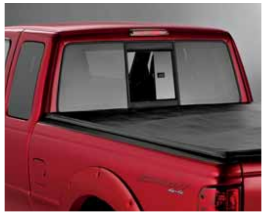
Manual Sliding Rear Window