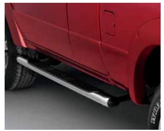
Step Bars (Also Available in Black)

To learn more about Ford Custom Accessories and to shop online, visit fordaccessories.com .