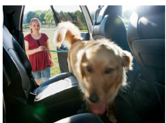
Traverse is ALL ABOUT SURFACES AND MATERIALS THAT WON'T SCRATCH EASILY AND ARE EASY TO CLEAN— very pet friendly.