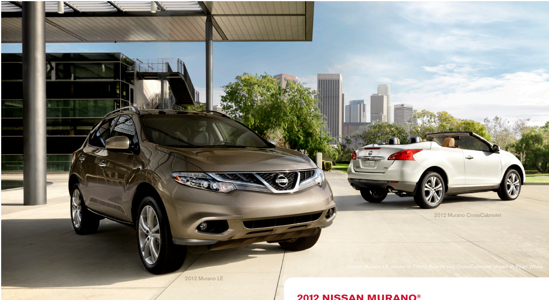
2012 Murano LE