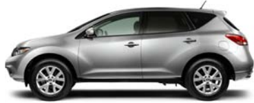
S: REDEFINITION OF ADVENTURE