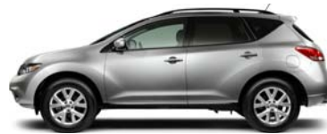
SV: PICTURE OF VERSATILITY