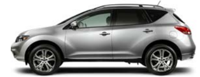
LE: PORTRAIT OF LUXURY