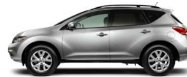
SL: STATEMENT OF BEAUTY