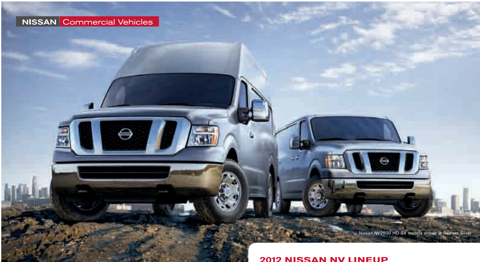
Nissan NV2500 HD SV models shown in Radiant Silver