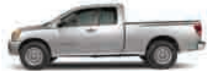
S KING CAB AND CREW CAB