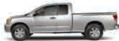
SV KING CAB AND CREW CAB