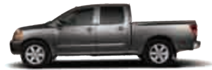
SL CREW CAB