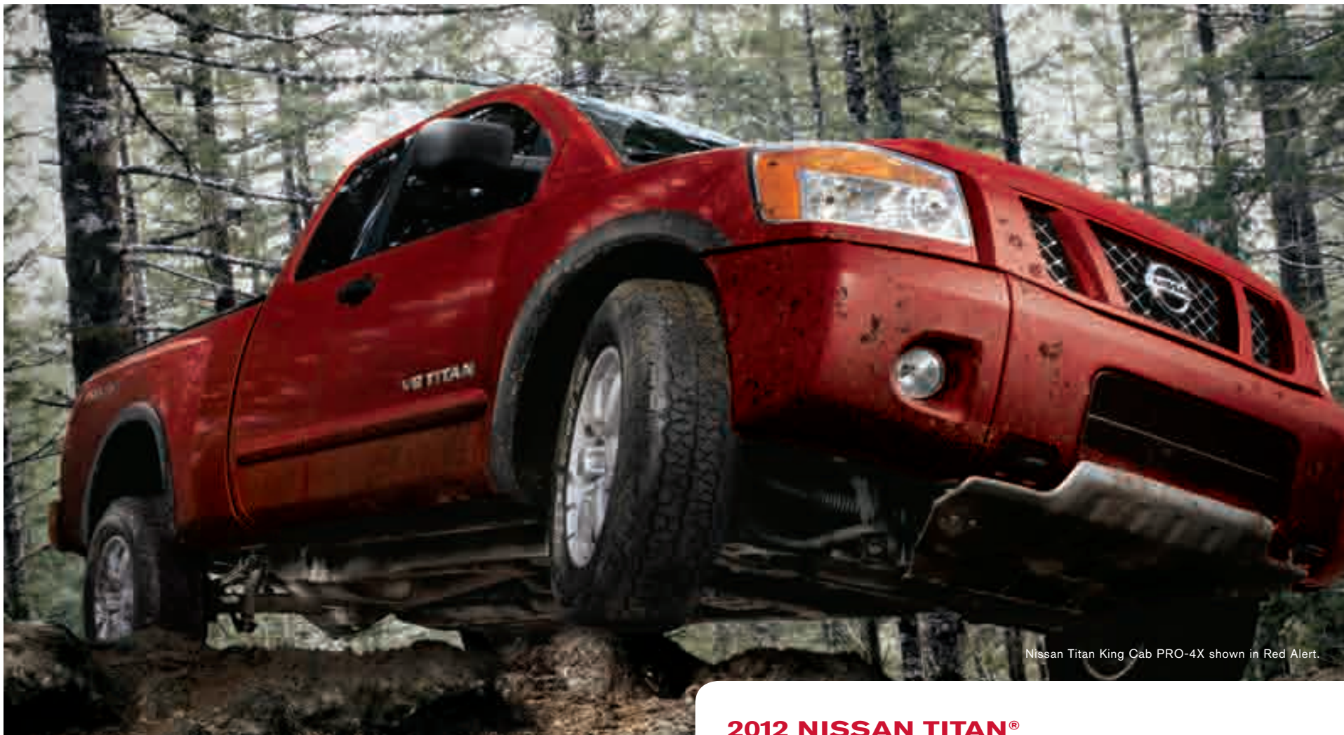
Nissan Titan King Cab PRO-4X shown in Red Alert.