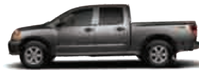
PRO-4X KING CAB AND CREW CAB