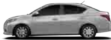
1.6 SV: A WHOLE NEW LEVEL OF COMFORT AND CONVENIENCE