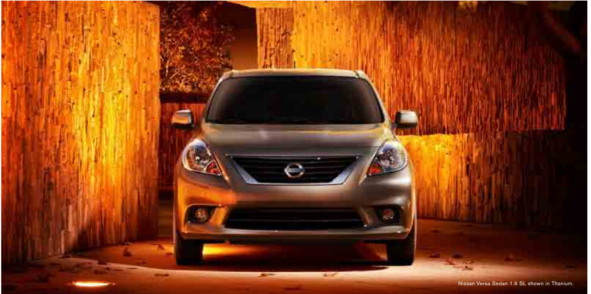
Nissan Versa Sedan 1.6 SL shown in Titanium.