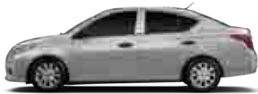
1.6 S: "STARTING AT" WAS NEVER BETTER EQUIPPED