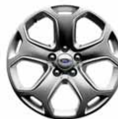
18" Painted Aluminum Standard on SEL