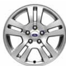
17" Painted Aluminum Standard on SE