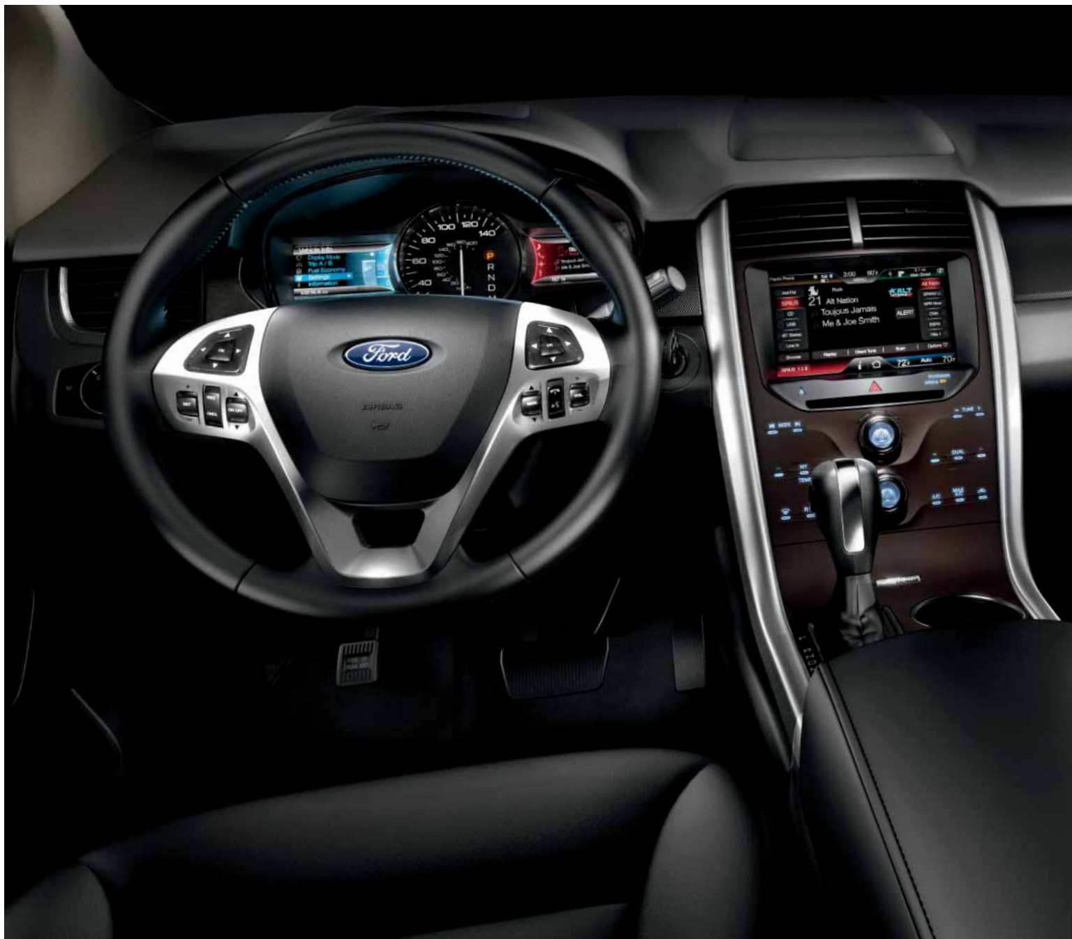
SEL. Charcoal Black leather trim. Available equipment. 1 2.0L EcoBoost ® I-4 engine. 1 MyFord ® 4.2" color LCD display. 1 SEL. Charcoal Black cloth trim. 1 12-volt powerpoint, one of 4 in Edge.