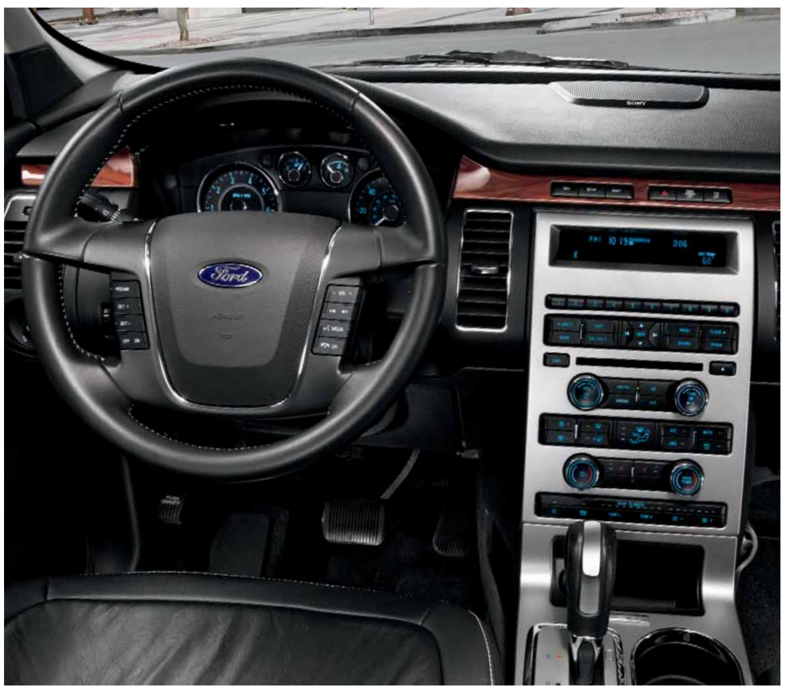
SEL. Charcoal Black leather trim. Available equipment. SE. Charcoal Black cloth trim with houndstooth-patterned inserts. SEL. Cargo net. Ford SYNC! Woodgrain appliqué.