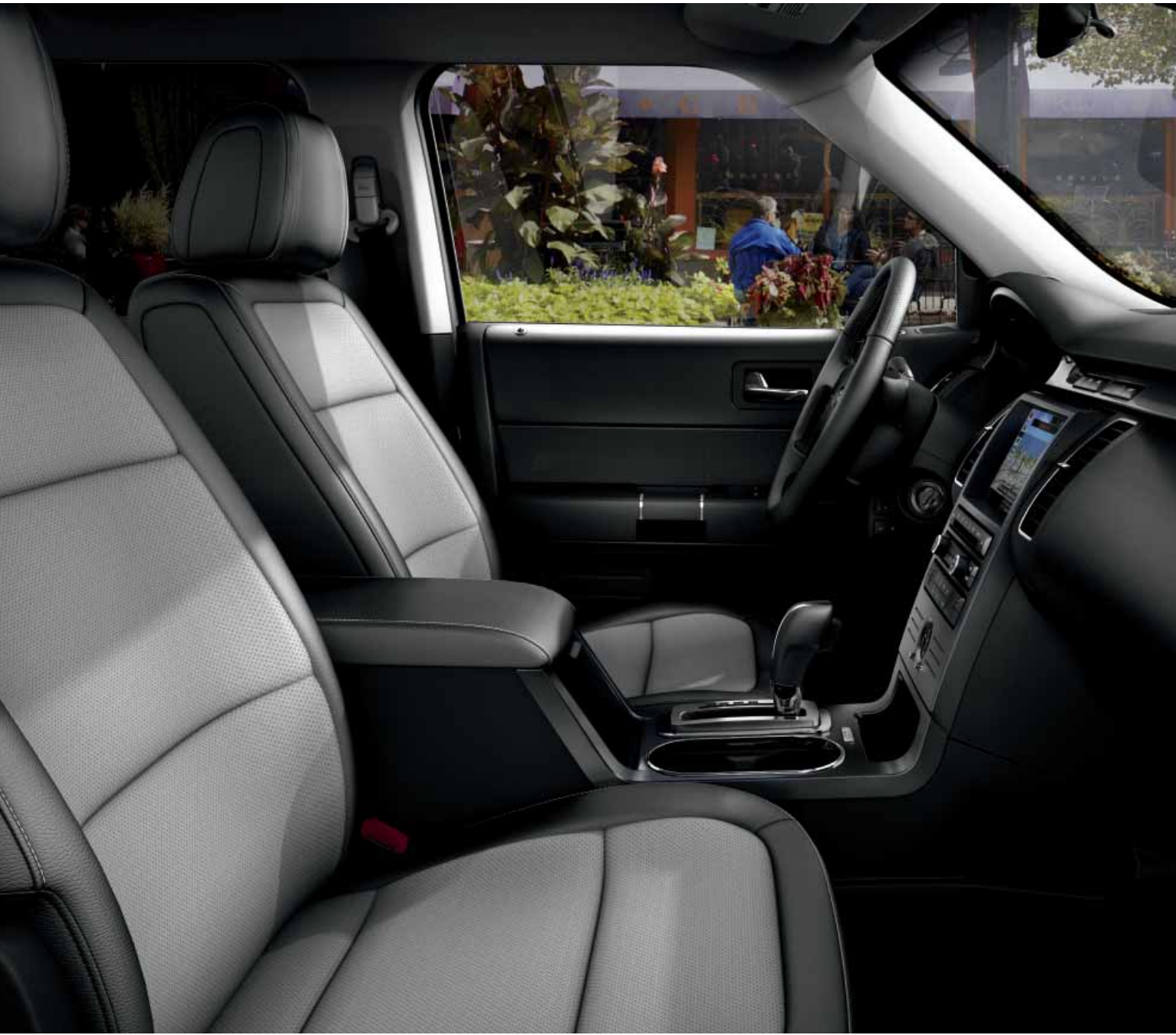
Charcoal Black leather trim with Gray Alcantara<sup>®</sup> suede perforated inserts. Available equipment. I Illuminated front door-sill scuff plates. Paddle shifters. Black "FLEX" hood badge. I Instrument panel Circle Check-appearance trim inserts.