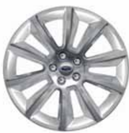
20" Bright-Painted Aluminum Optional on 300A, included with 301A and 302A

White Platinum Metallic Tri-coat White Suede/ Ingot Silver Metallic Ingot Silver Metallic/ White Suede Red Candy Metallic Tinted Clearcoat/White Suede Cinnamon Metallic/ White Suede Ginger Ale Metallic/ White Suede Mineral Gray Metallic/ White Suede Dark Blue Pearl Metallic/ Ingot Silver Metallic