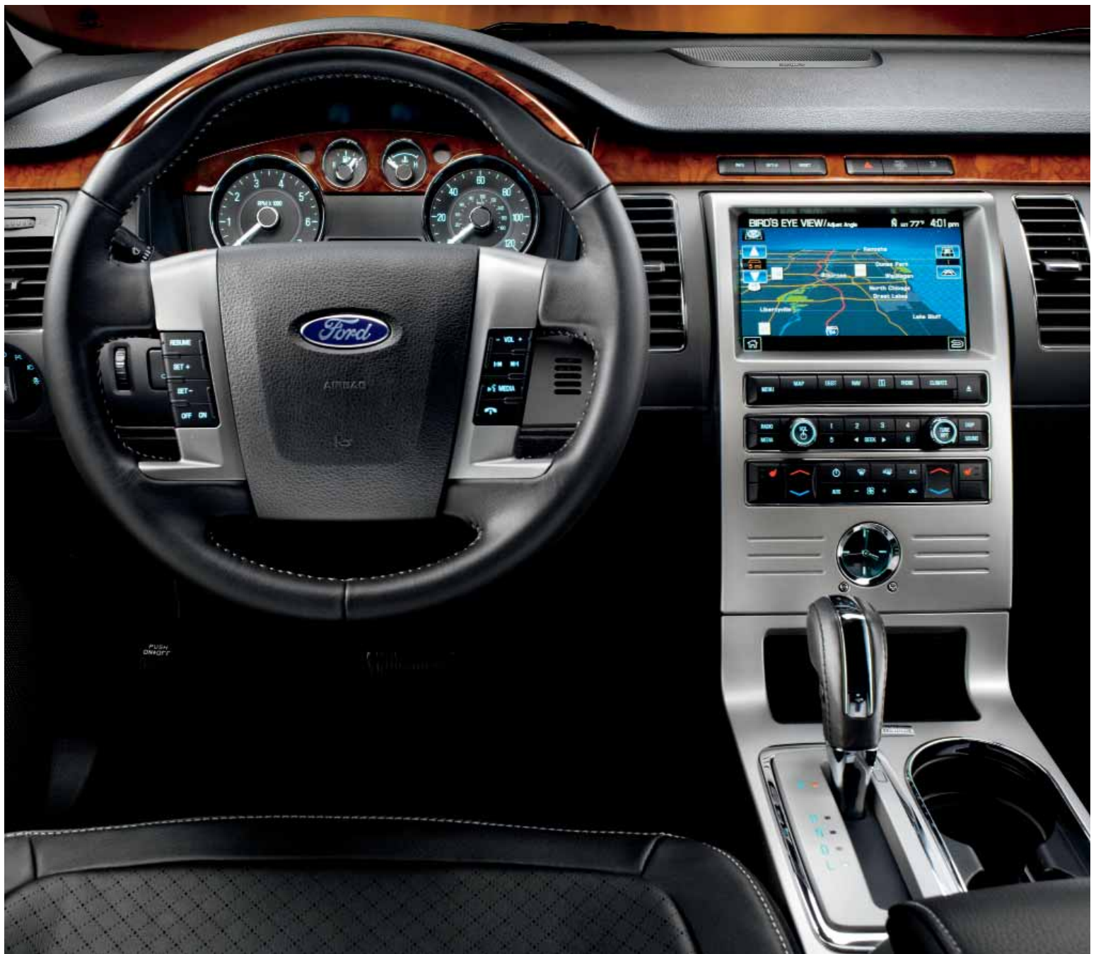
Charcoal Black leather trim with perforated inserts. Available equipment. Medium Light Stone leather trim with perforated inserts. Power liftgate. Refrigerated 2nd-row console! 110-volt power outlet.