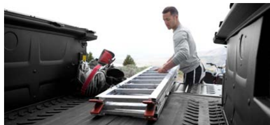
The cargo box stretches to one of the longest beds on the road. A removable three-piece cargo cover slides in to make the bed more secure. Lockable sidewall storage boxes corral loose tools and gear.