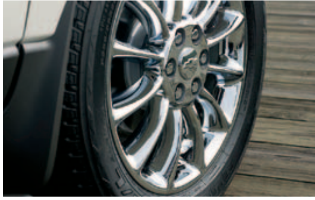
20" Chrome Wheels

1 Maximum trailer weight ratings are calculated assuming a base vehicle, except for any option(s) necessary to achieve the rating, plus driver. The weight of other optional equipment, passengers and cargo will reduce the maximum trailer weight your vehicle can tow. See your Chevy dealer for additional details. 2 Cargo and load capacity limited by weight and distribution.