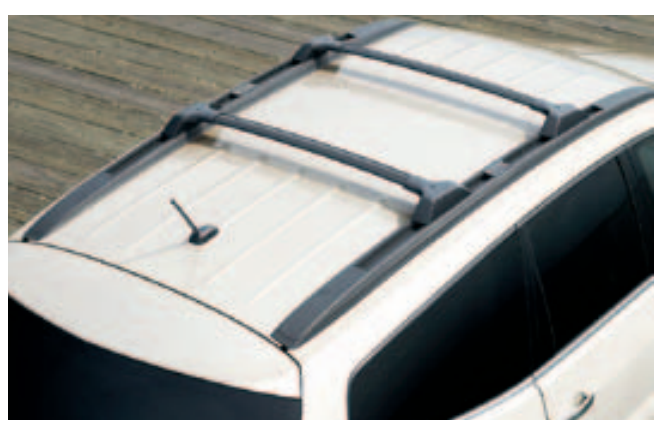
Roof Rack Side and Cross Rail Package