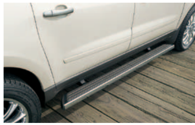
6" Chrome Oval Assist Steps