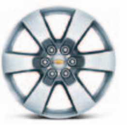
20" Aluminum Wheel (Standard on LTZ)