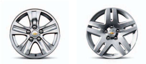
16" Aluminum Wheel (standard on LS)