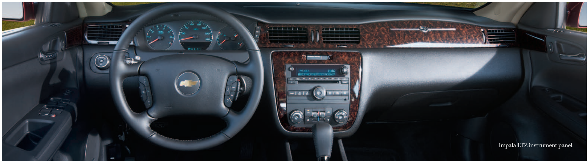
Impala LTZ instrument panel.