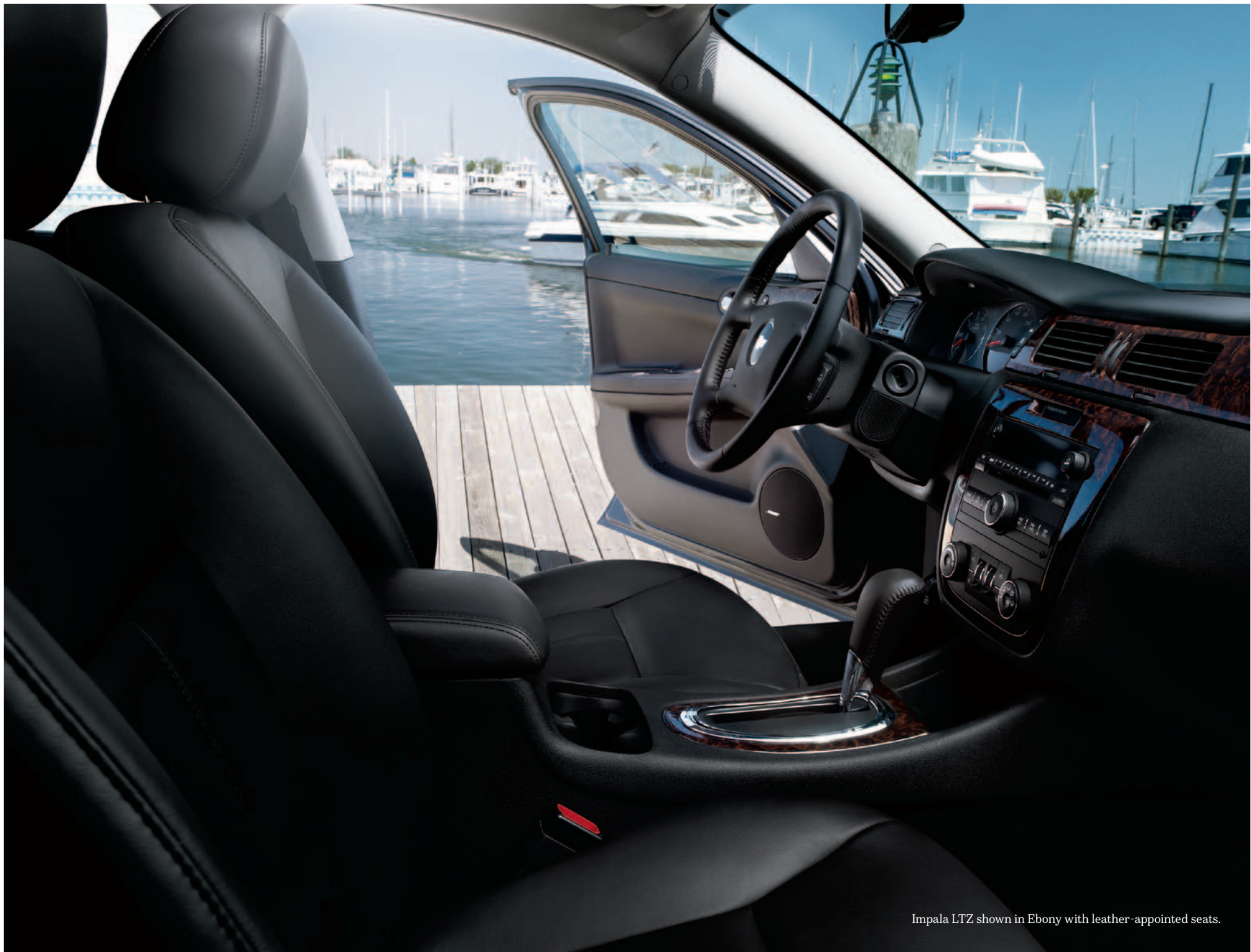
Impala LTZ shown in Ebony with leather-appointed seats.