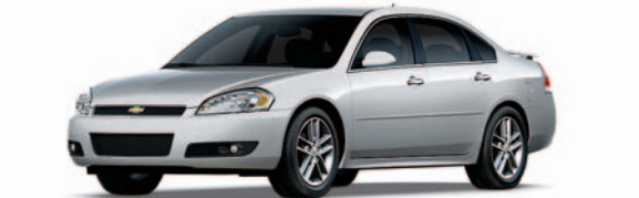
Silver Ice Metallic 3