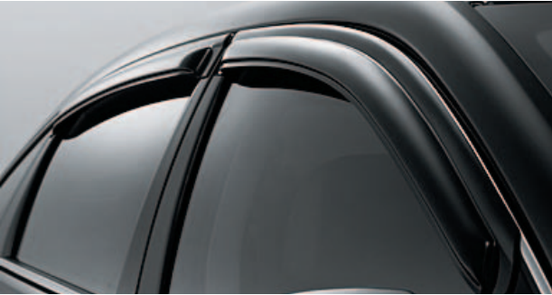
Side Window Weather Deflectors