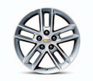
18" Machined-Face Aluminum Wheel (standard on LTZ)