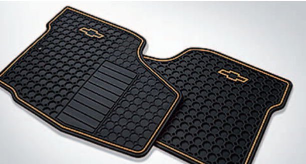
All-Weather Floor Mats