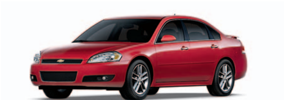
Crystal Red Tintcoat 1,2