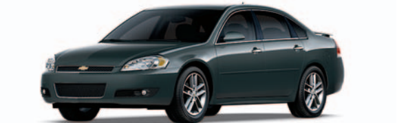
Ashen Gray Metallic