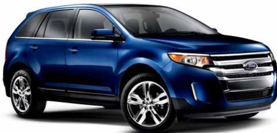
Deep Impact Blue Metallic. Available equipment.

Visit accessories.ford.com to shop the complete collection