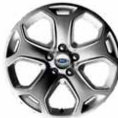
18" Painted Aluminum Standard on SEL, included with SE EcoBoost and SE AWD