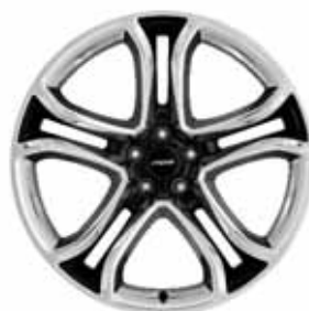
22" Polished Aluminum with Black Spoke Accents Standard