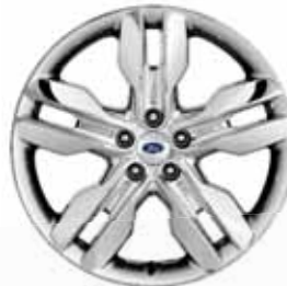
20" Chrome-Clad Aluminum Available on SEL