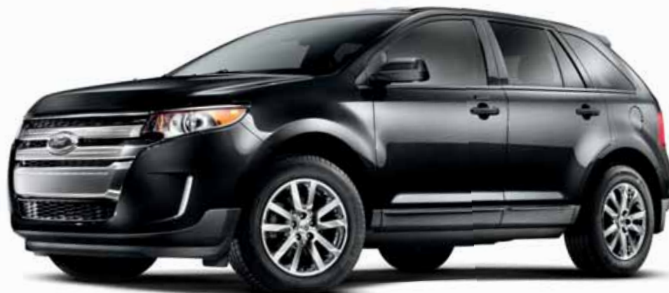
SEL, Tuxedo Black Metallic. Available equipment.