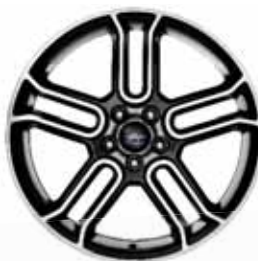
20" Painted-Black Aluminum with Machined Face Included with SEL Appearance Package