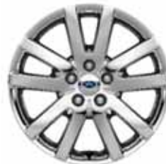
18" Chrome-Clad Aluminum Available on SEL