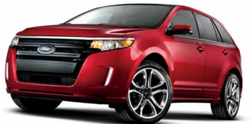
Ruby Red Metallic Tinted Clearcoat. Available equipment.

Visit accessories.ford.com to shop the complete collection