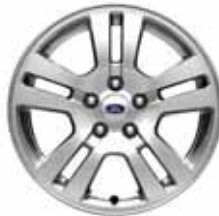
17" Painted Aluminum Standard on SE V6 FWD 2