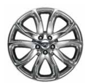
20" Polished Aluminum Available