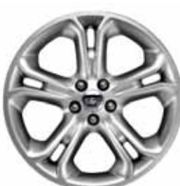
20" Painted Aluminum Standard