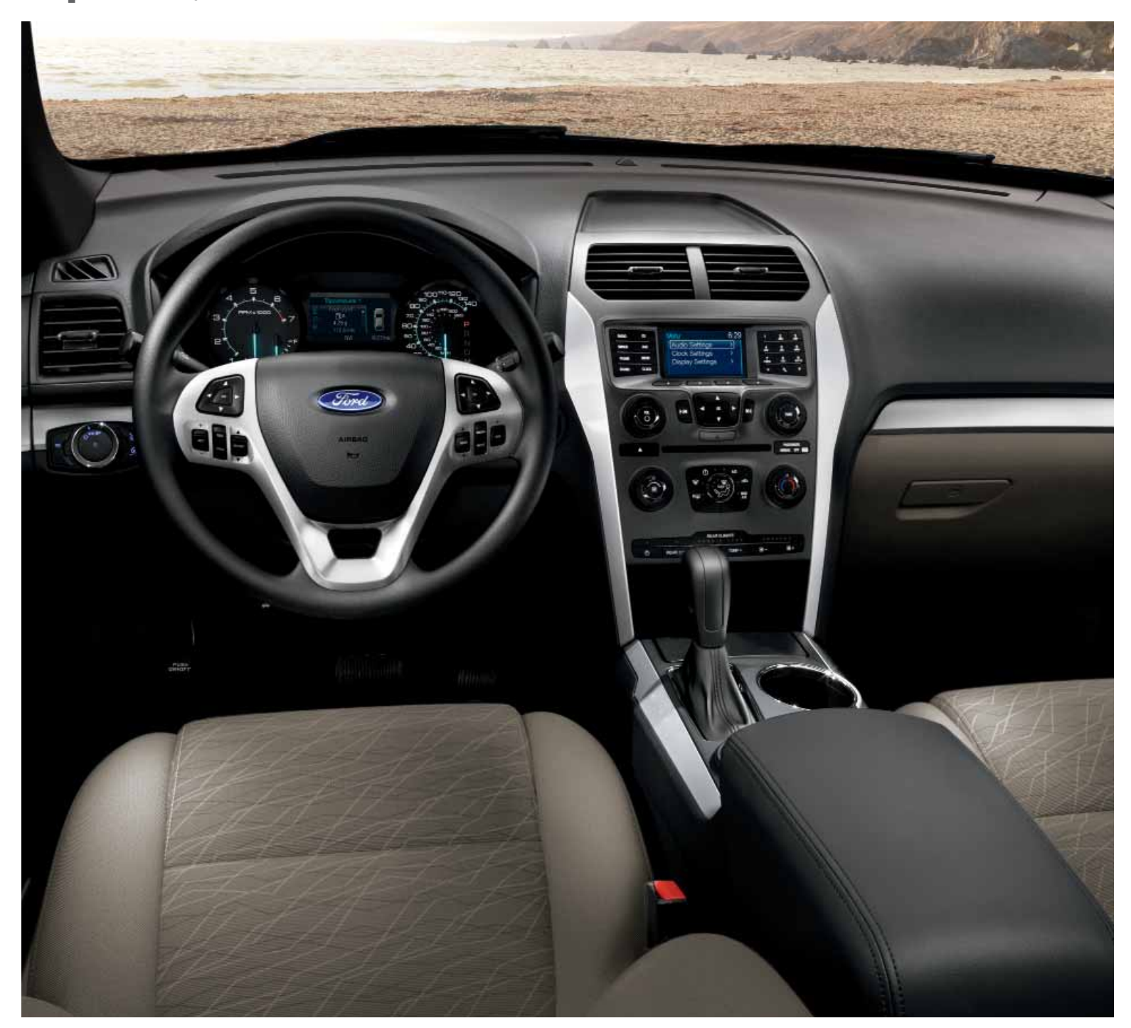
Medium Light Stone cloth trim. | 3rd-row cupholders and storage bins. | MyFord® 4.2" LCD center stack display. | Embossed door-sill scuff plates. | All-weather floor mats!