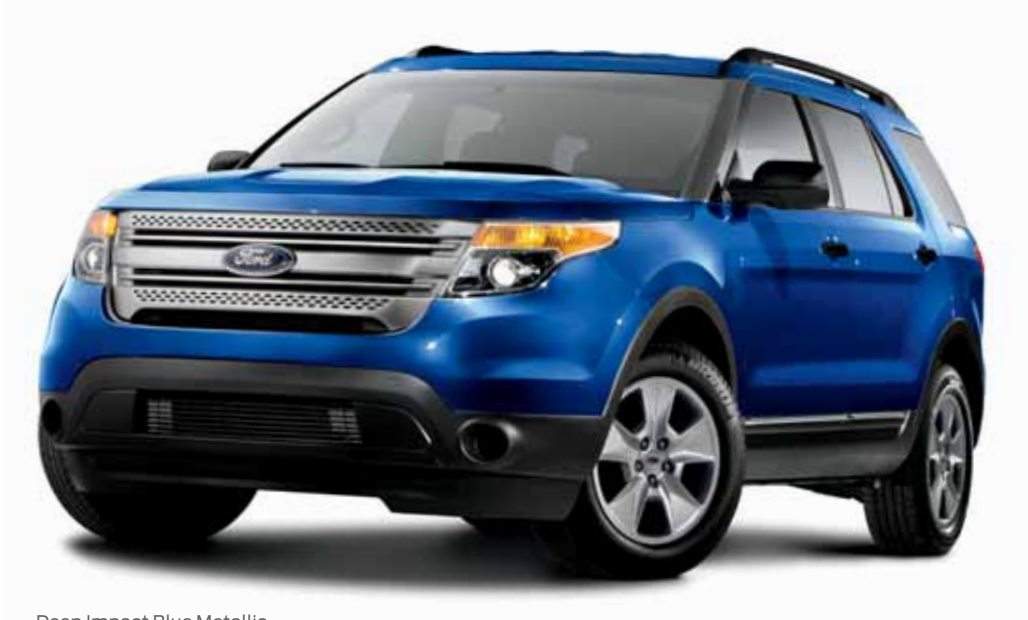
Deep Impact Blue Metallic.