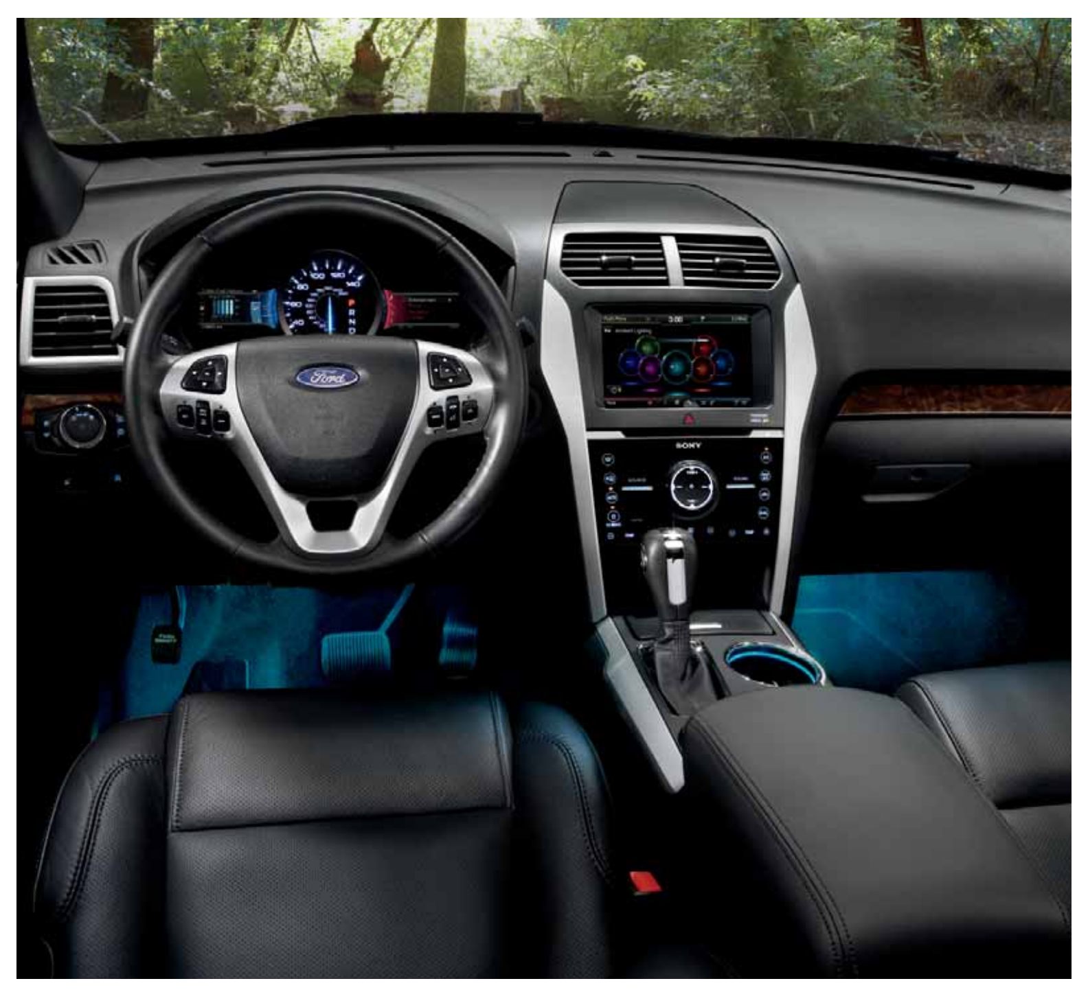
Charcoal Black leather trim with perforated inserts. Available equipment. | 2nd-row bucket seats! 2nd-row center console! | Intelligent Access with push-button start. | Rain-sensing wipers! | 2nd-row climate control, 12-volt powerpoint and 110-volt power outlet.