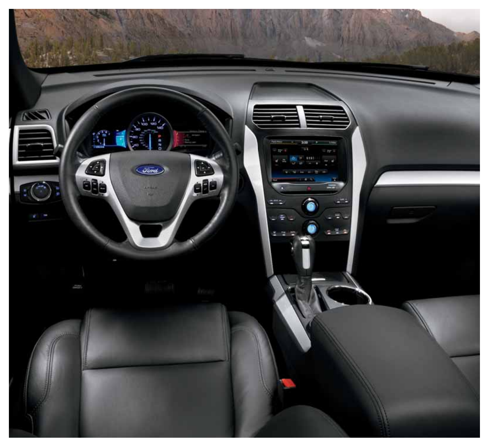
Charcoal Black leather trim. Available equipment. I 2nd-row bucket seats! 2nd-row center console! I Heated sideview mirrors with LED turn signal indicators and security approach lamps. I Satin Silver-finish grille. I Fog lamps.