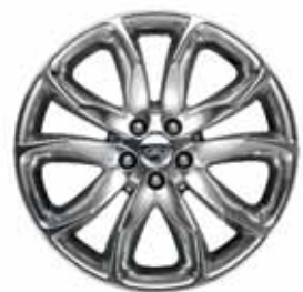
20" Polished Aluminum Available