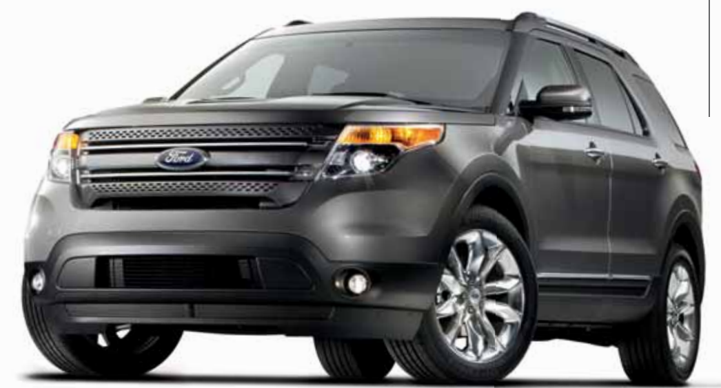
Sterling Gray Metallic. Available equipment.