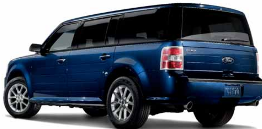
SE. Deep Impact Blue Metallic. Available equipment.

Visit accessories.ford.com to shop the complete collection