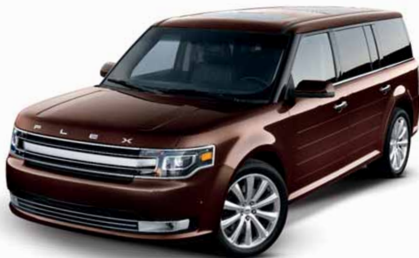
Kodiak Brown Metallic. Available equipment.

Visit accessories.ford.com to shop the complete collection