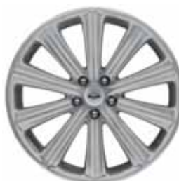
20" Polished Aluminum Optional on 300A and 301A, included with 302A and 303A