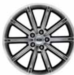
19" Painted Aluminum Standard