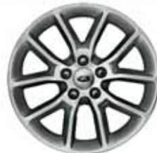
17" Painted Aluminum Standard on SE

3 Dune Cloth – Standard 4 Charcoal Black Cloth – Standard 5 Dune Leather – Optional 6 Charcoal Black Leather – Optional 7 Charcoal Black Leather with Gray Perforated Inserts – Requires Titanium Appearance Package