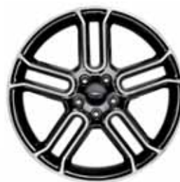
20" Machined Aluminum with Premium Painted Pockets Included with Titanium Appearance Package