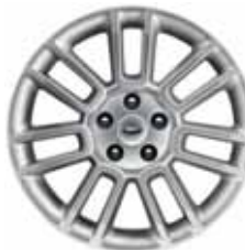
18" Painted Aluminum Standard on SEL