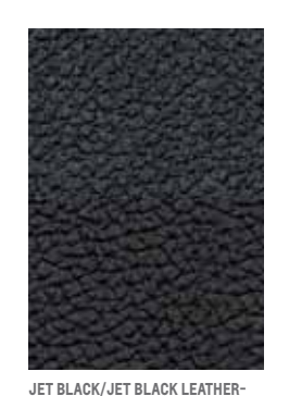
APPOINTED STANDARD ON LTZ AND LTZ Z71 AVAILABLE ON LT AND LT Z71