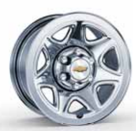
17" STAINLESS STEEL-CLAD (RD7) STANDARD ON 2WT