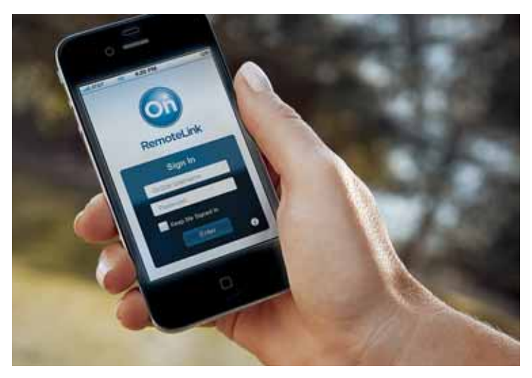
COMMUNICATIONS • OnStar RemoteLink Mobile App<sup>2</sup> • Hands-Free Calling<sup>3</sup> with voice-activated dialing

The level of convenience and safety provided by the various features available through OnStar¹ offers powerfully simple connectivity and peace of mind. To place this capability at your fingertips, Silverado is available with a 6-month trial subscription to the OnStar Directions & Connections Plan. This plan includes: