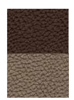
COCOA/DUNE LEATHER-APPOINTED STANDARD ON LTZ AND LTZ Z71