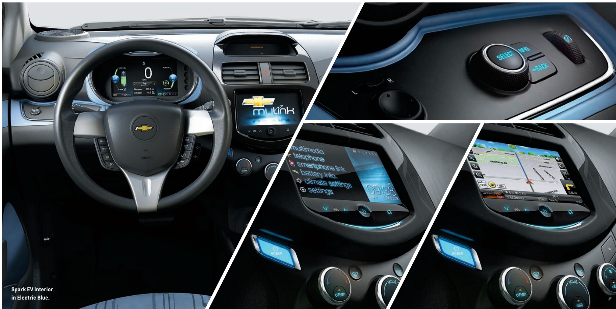
Spark EV interior in Electric Blue.

With a finely tuned ride and 400 lb.-ft. of instant torque, the all-new 2014 Spark EV 1 is the most fun you can have in the most efficient electric vehicle in the retail market. So leave gas stations behind and move forward with 82 miles 2 of pure electric driving. Featuring innovative electric performance and impressive zero-emissions power, Spark EV is the technologically advanced, electrifying way to get around town.