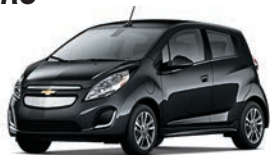
BLACK GRANITE 1