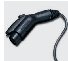
Standard 120-volt cord.

128 MPGe IN THE CITY Efficiency in a gas-powered car is measured in MPG, miles per gallon. Efficiency in an electric vehicle is measured in MPGe, miles per gallon equivalent, and Spark EV is the most efficient electric vehicle available for retail sale. With an impressive efficiency of 128 MPGe city and 109 MPGe highway and an EV range of 82 miles 4 per charge, Spark EV allows you to use less energy to get where you need to go — you'll really feel the savings.