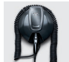
Available 240-volt charging station.