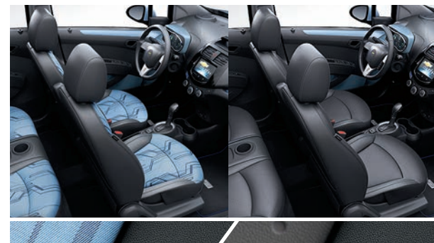
Electric Blue Cloth with Electric Blue Trim