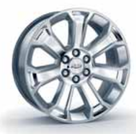
22" 7-SPOKE SILVER (SF1) ACCESSORY WHEEL<sup>3</sup>