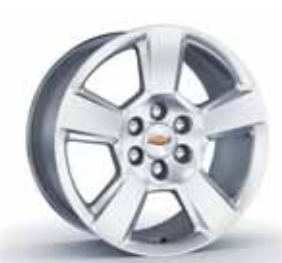
20" POLISHED ALUMINUM (RD4) AVAILABLE ON LT AND LT Z71