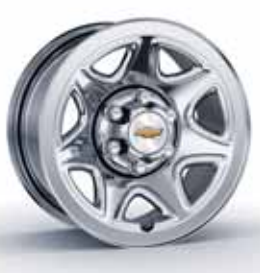
17" STAINLESS STEEL-CLAD (RD7) STANDARD ON LS