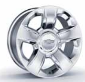
20" CHROME-PLATED (RD2) AVAILABLE ON LTZ AND LTZ Z71