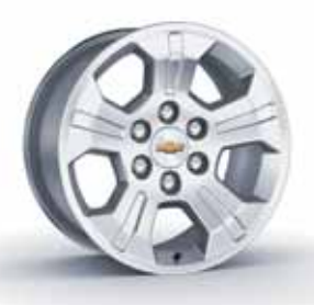
18" BRIGHT MACHINED (RD1) STANDARD ON LTZ Z71, AVAILABLE ON LT Z71