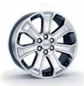
22" 7-SPOKE SILVER WITH BLACK INSERTS (RX1) ACCESSORY WHEEL<sup>3</sup>