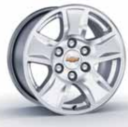
17" ALUMINUM (Q5U) STANDARD ON LT AND LT Z71