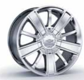
20" CHROME-PLATED (NZJ) STANDARD ON HIGH COUNTRY