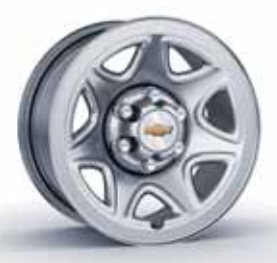
17" PAINTED STEEL (RD6) STANDARD ON WT