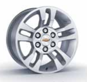
18" BRIGHT MACHINED (PZX) STANDARD ON LTZ, AVAILABLE ON LT