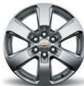
20" Painted-Aluminum (Available on 1LT; requires Style and Technology Package)