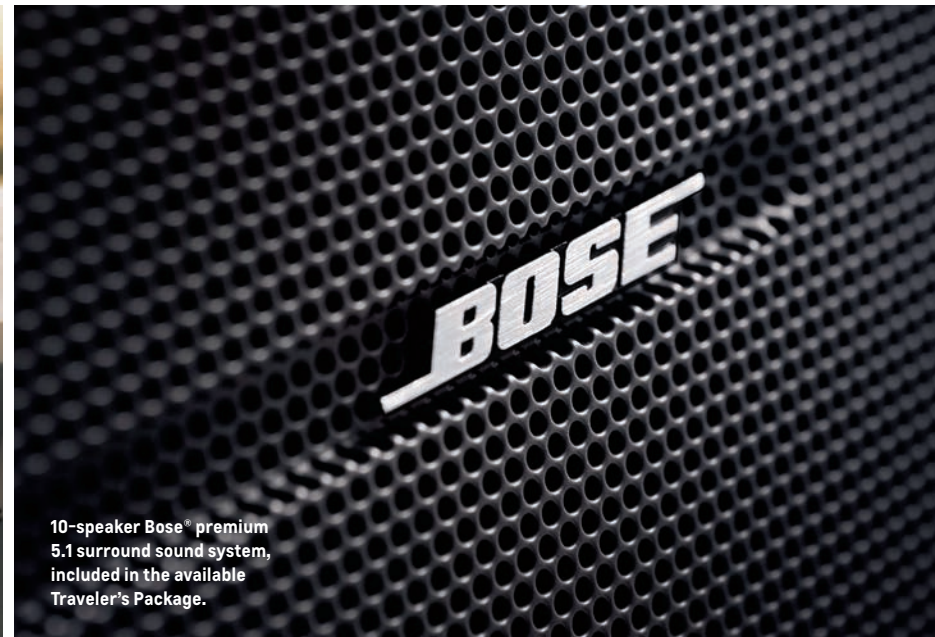
10-speaker Bose® premium 5.1 surround sound system, included in the available Traveler's Package.