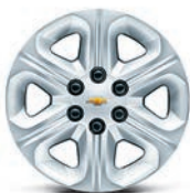
17" Steel with Painted Wheel Cover (Standard on LS Base and LS)