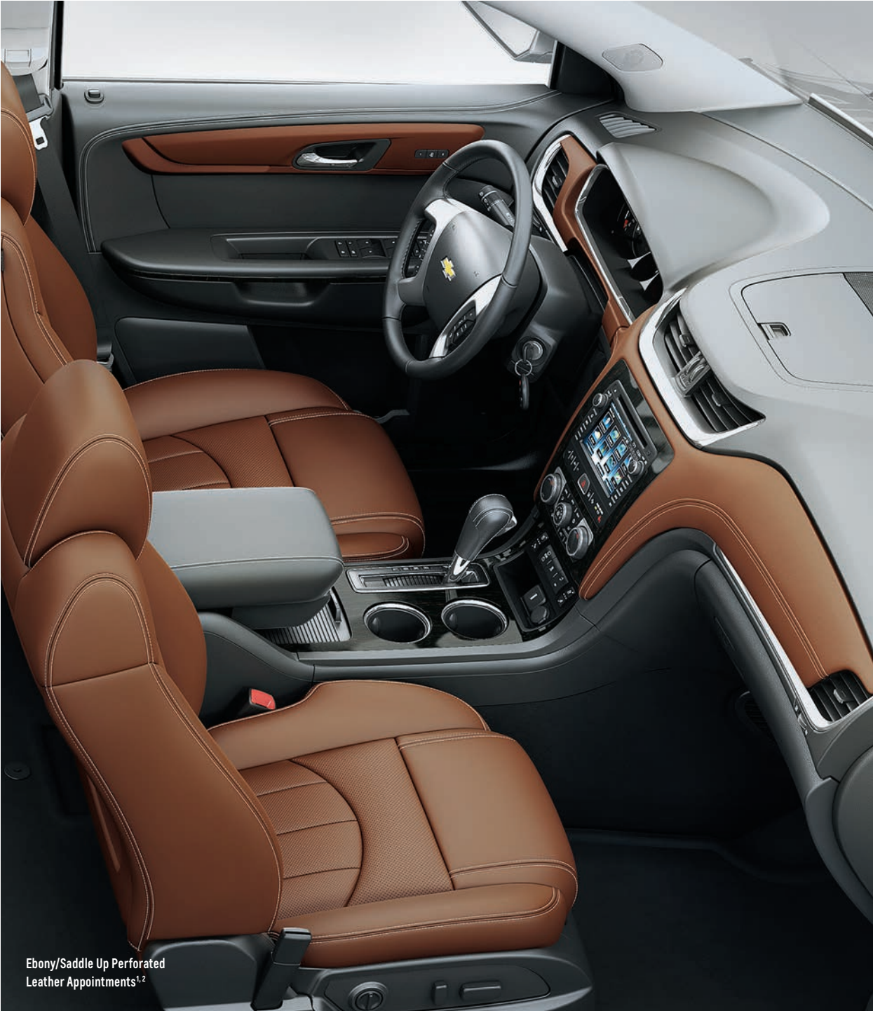
Ebony/Saddle Up Perforated Leather Appointments 1,2