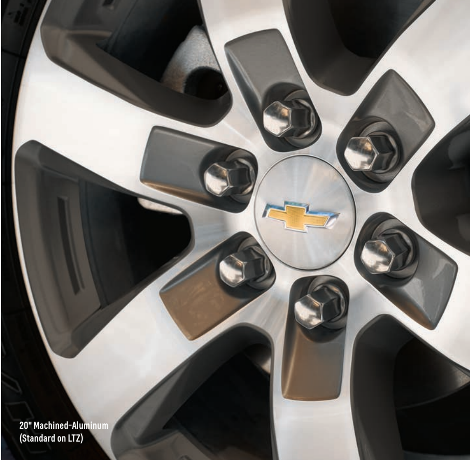
20" Machined-Aluminum (Standard on LTZ)