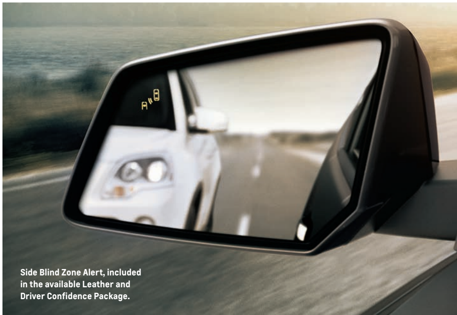
Side Blind Zone Alert, included in the available Leather and Driver Confidence Package.