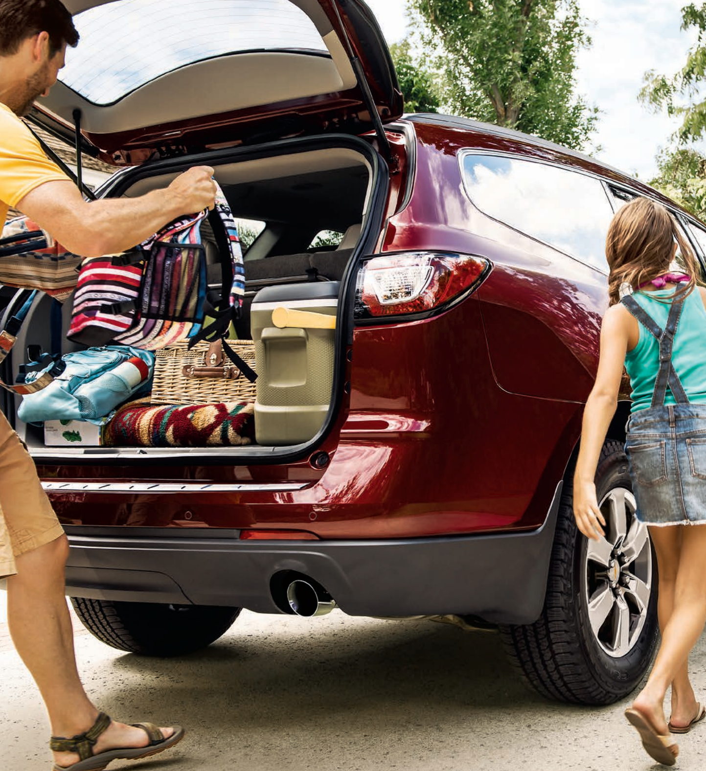
Traverse LTZ in Siren Red Tintcoat (extra-cost color).