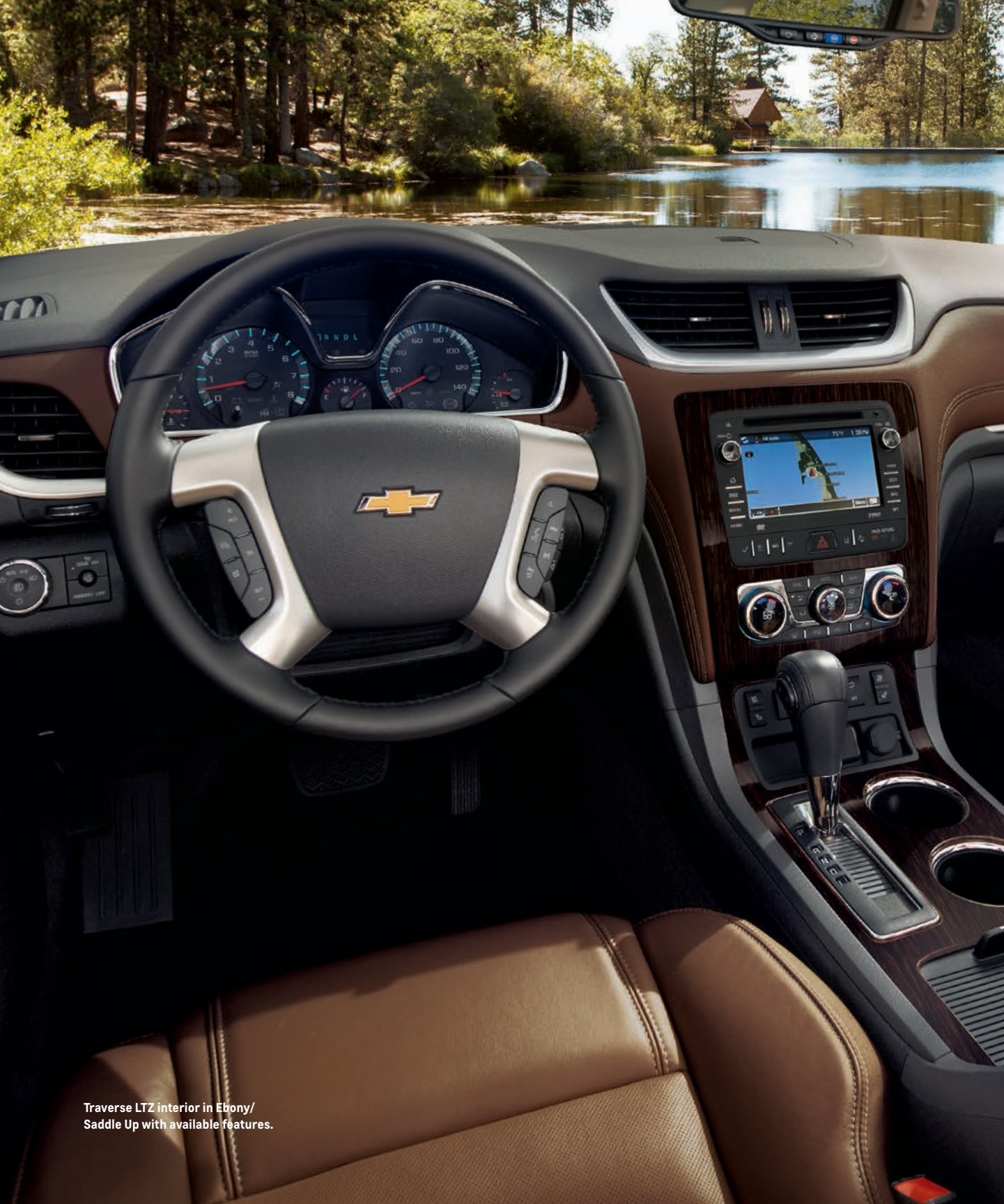
Traverse LTZ interior in Ebony/ Saddle Up with available features.

RICH REFINEMENTS. LTZ amenities include heated/cooled driver and front passenger seats, a heated steering wheel and tri-zone automatic climate controls.