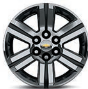
18" Machined-Aluminum (Standard on 1LT and 2LT)