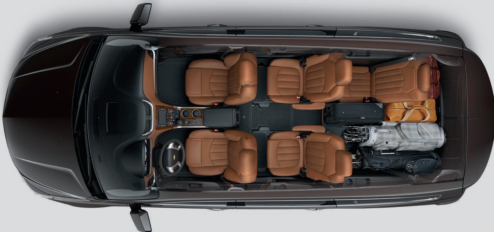
Traverse LTZ in Tungsten Metallic with Ebony/Saddle Up interior and available features.

SEATING FOR UP TO EIGHT. Choose standard seating for eight with second- and third-row flat-folding 60/40 split-bench seats (standard on LS Base, LS and 1LT and available on 2LT). Or you can opt for 7-passenger seating with second-row flat-folding captain's chairs (standard on 2LT and LTZ).