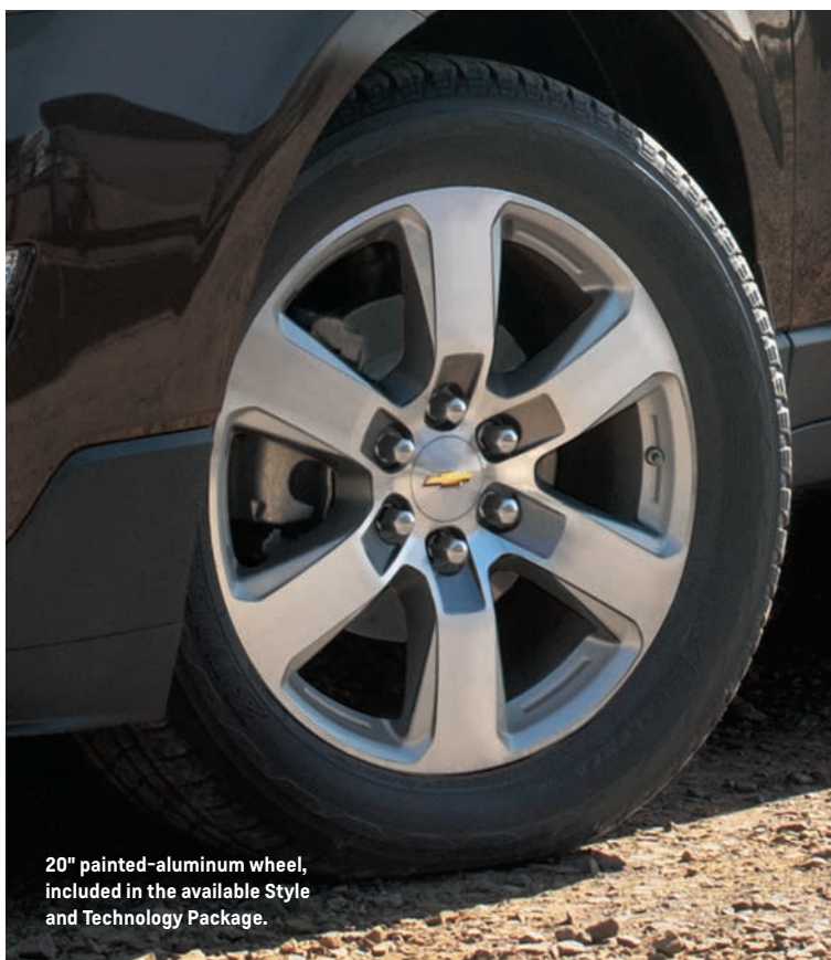
20" painted-aluminum wheel, included in the available Style and Technology Package.