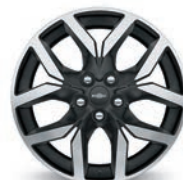
19" Special Midnight Edition with Black-Painted Pockets (Available on LT and LTZ) 6