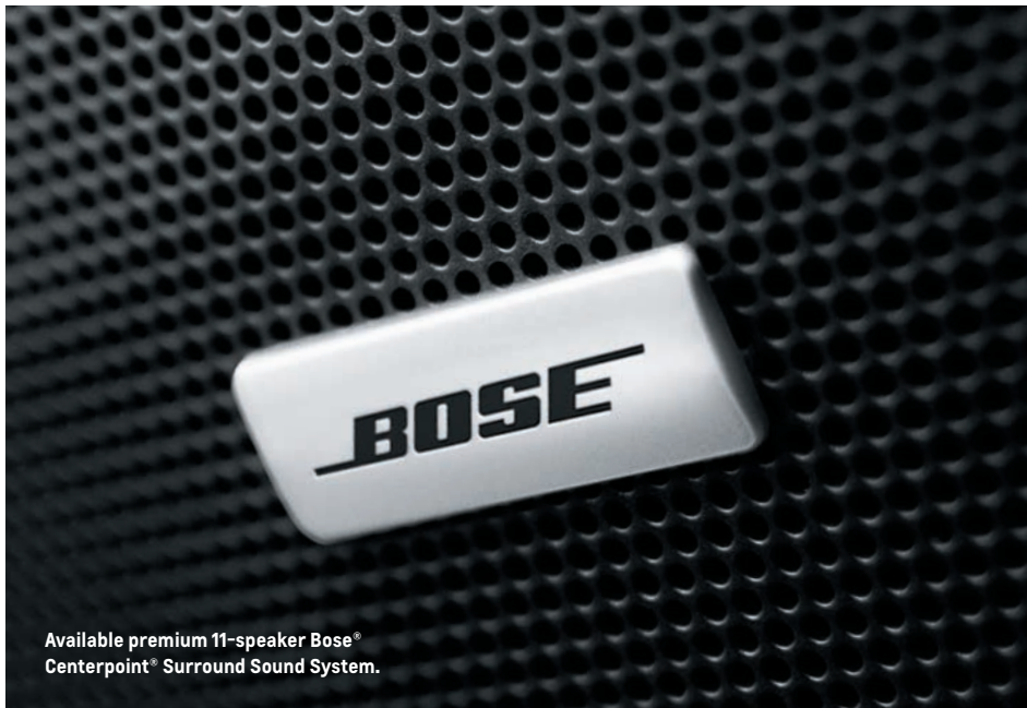
Available premium 11-speaker Bose® Centerpoint® Surround Sound System.