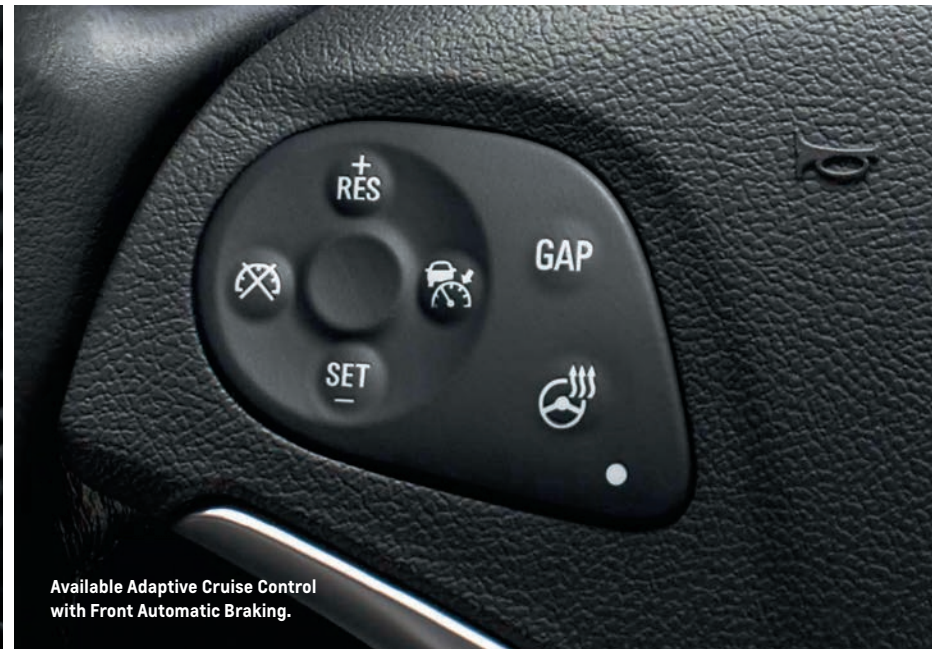
Available Adaptive Cruise Control with Front Automatic Braking.