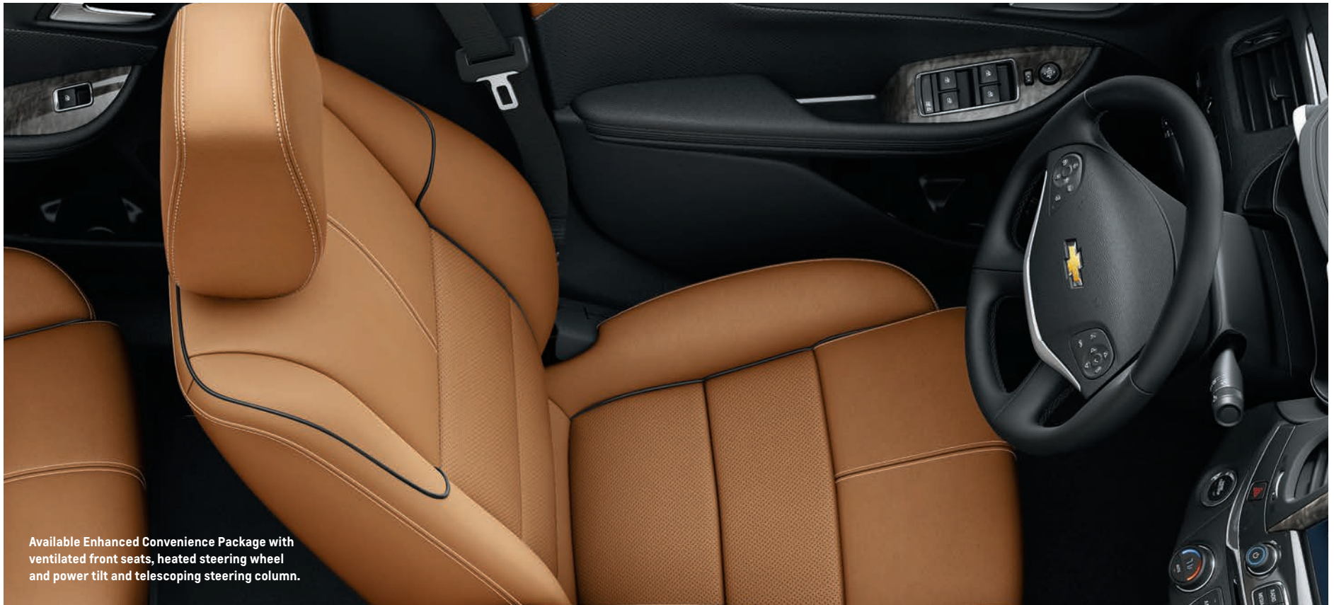
Available Enhanced Convenience Package with ventilated front seats, heated steering wheel and power tilt and telescoping steering column.