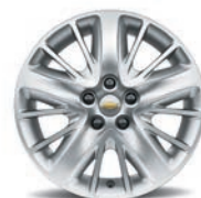
18" Steel with Fascia-Spoke Wheel Cover (Standard on LS)