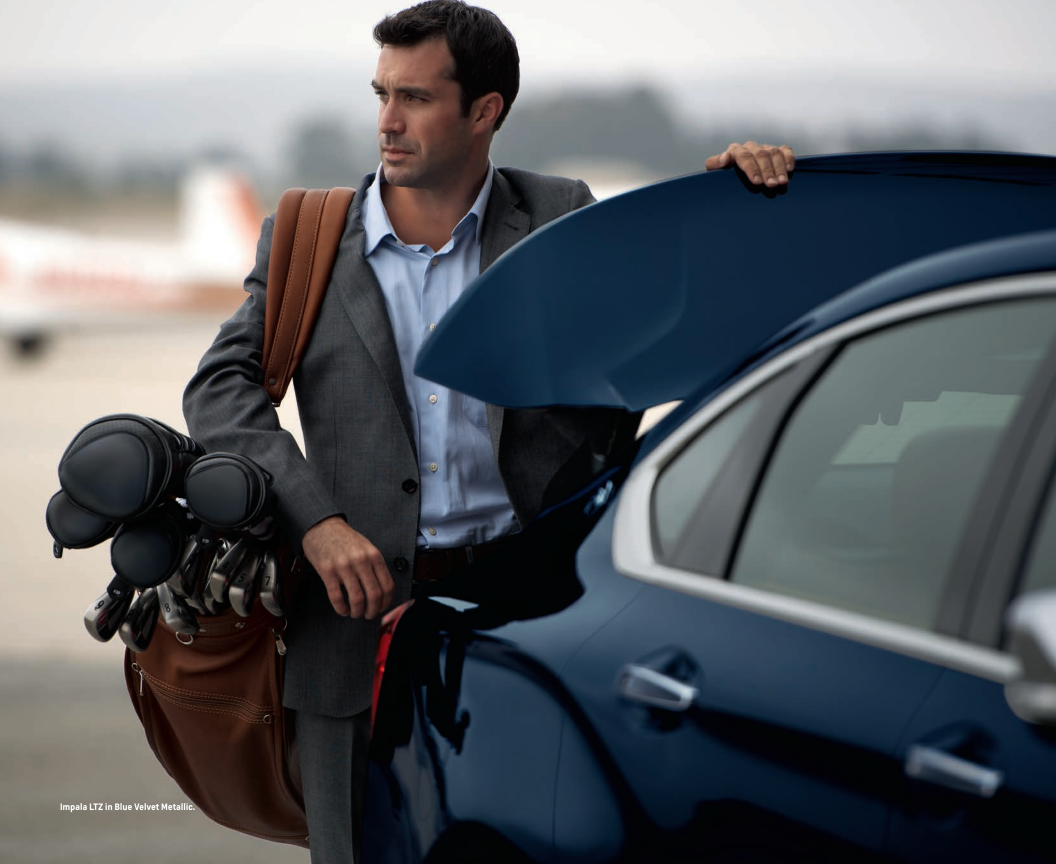
Impala LTZ in Blue Velvet Metallic.