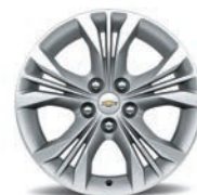
18" Painted-Aluminum (Standard on LT)