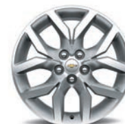
19" Machined-Face Aluminum (Standard on LTZ)