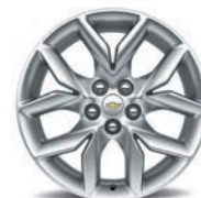
19" Painted-Aluminum (Available on 2LT) 7