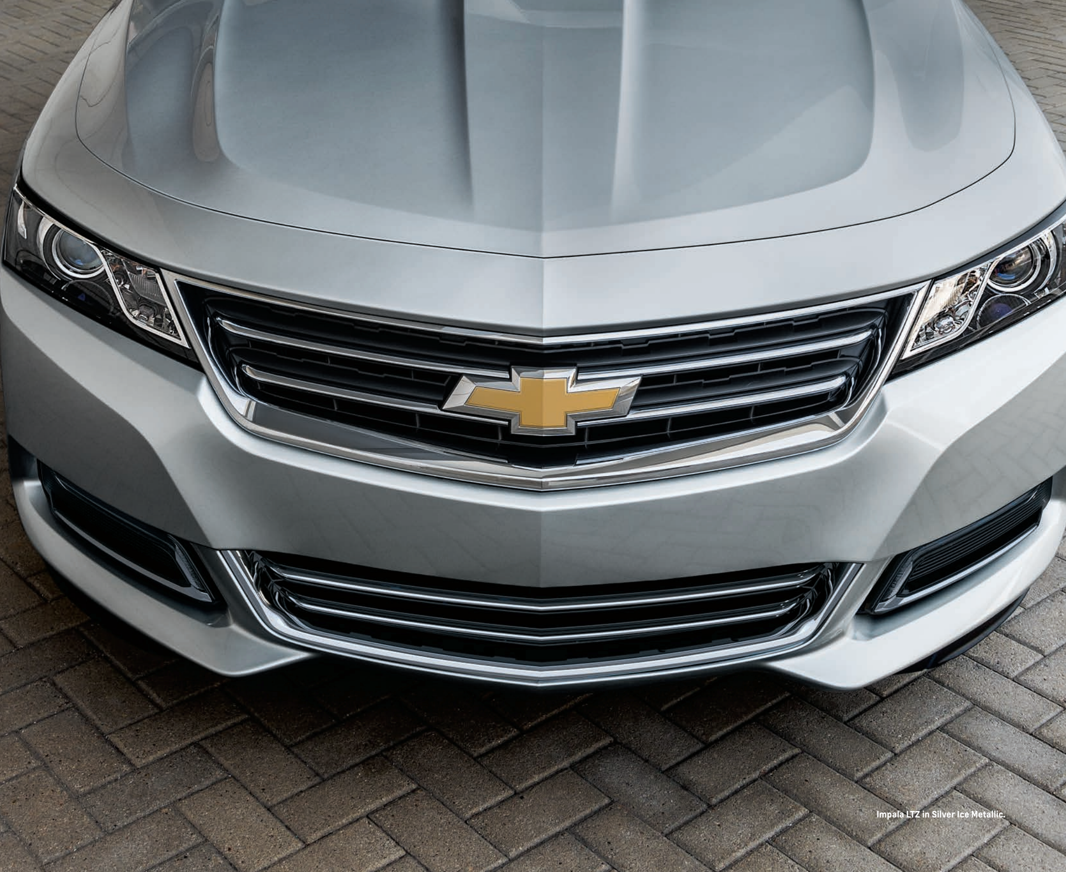
Impala LTZ in Silver Ice Metallic.