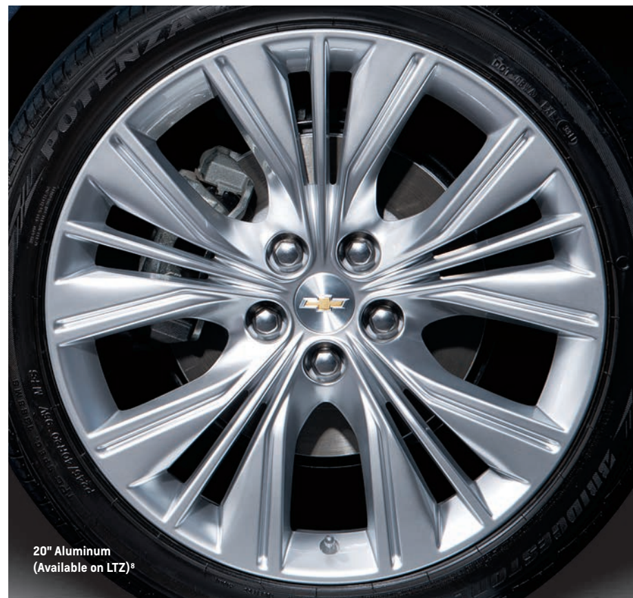
20" Aluminum (Available on LTZ) 8