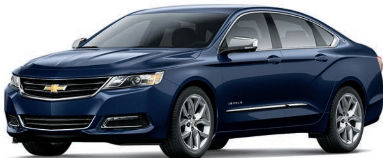
BLUE VELVET METALLIC