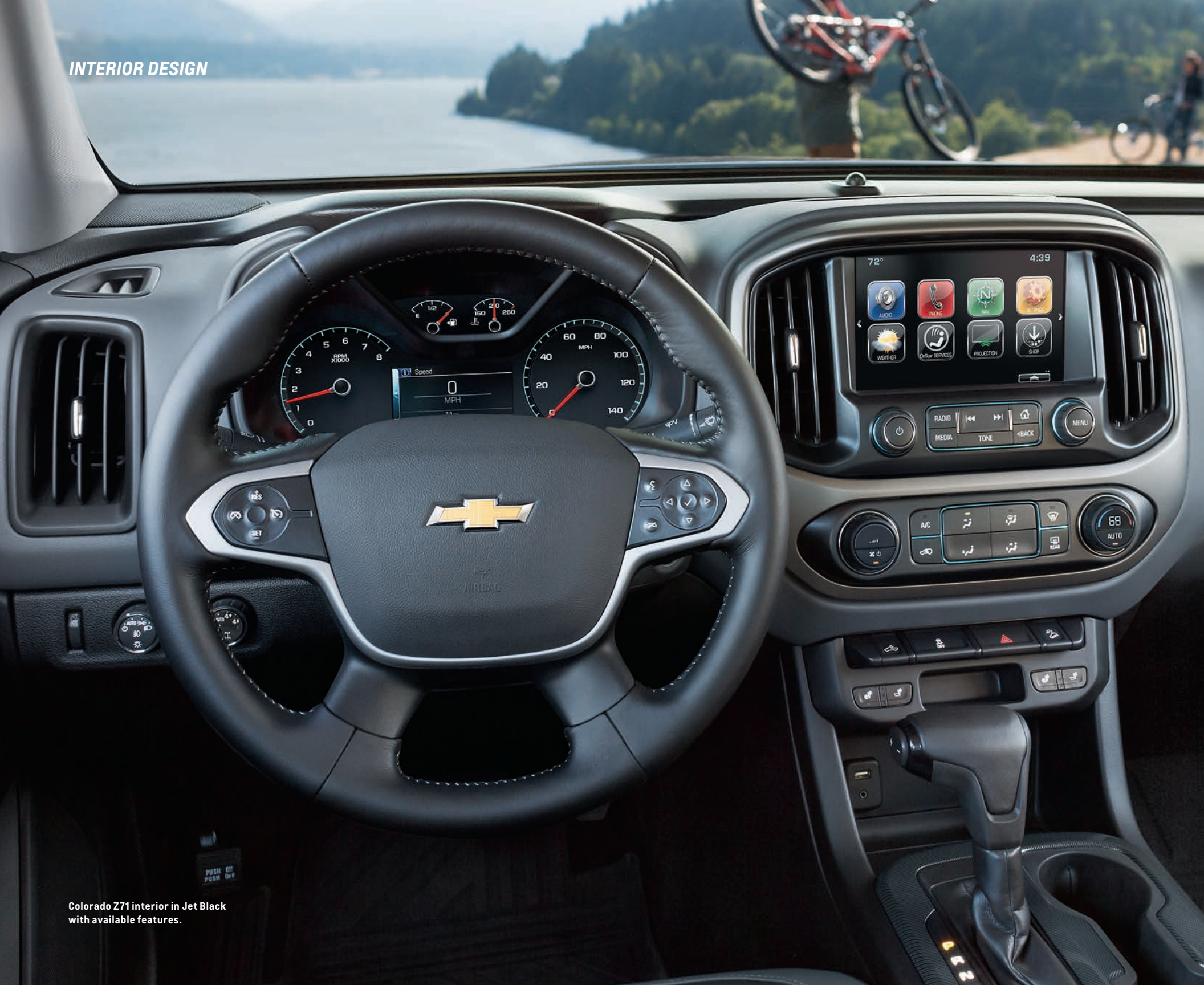
Colorado Z71 interior in Jet Black with available features.