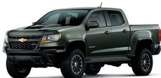
DEEPWOOD GREEN METALLIC 5