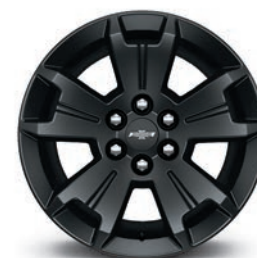
17" Black-Painted Cast-Aluminum (Available with Z71 Midnight Special Edition)