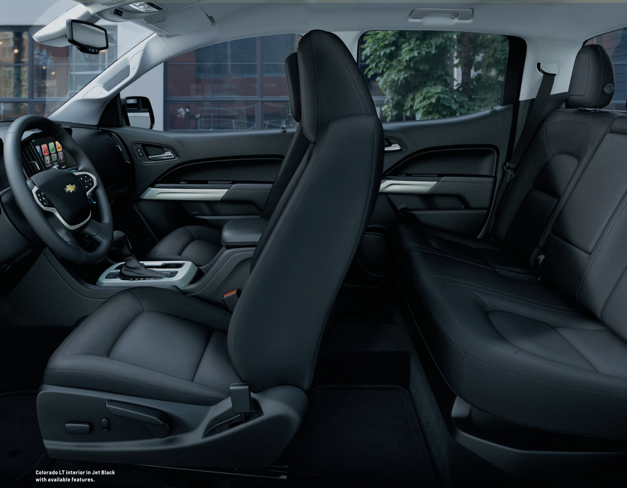
Colorado LT interior in Jet Black with available features.