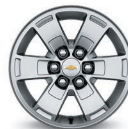
16" Ultra Silver Metallic-Painted Cast-Aluminum (Available with WT Appearance Package)