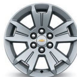
17" Blade Silver Metallic-Painted Cast-Aluminum (Standard on LT; available on WT with Duramax 2.8L Turbo-Diesel engine)