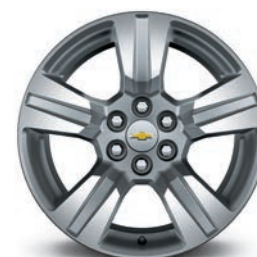
18" Dark Argent Metallic-Painted Cast-Aluminum (Available on LT)