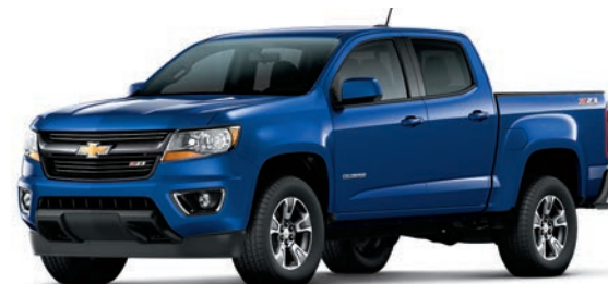
LASER BLUE 2