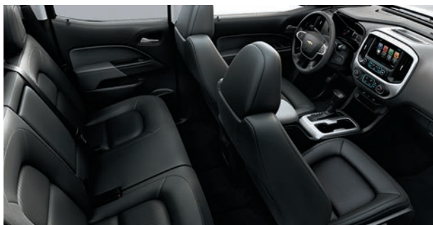
Dark Ash Cloth with Jet Black Cloth Appointments (LT shown) 3,4