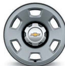
16" Ultra Silver Metallic Painted-Steel (Standard on Base and WT)