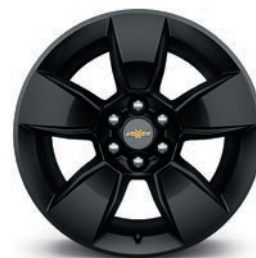
18" Black-Painted Cast-Aluminum (Available with Shoreline Special Edition)