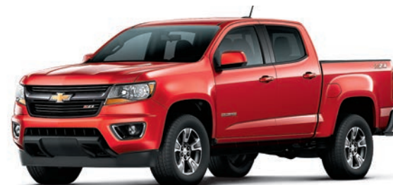
RED HOT 1