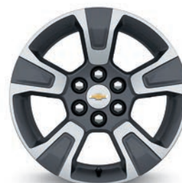
17" Dark Argent Metallic-Painted Cast-Aluminum (Standard on Z71)