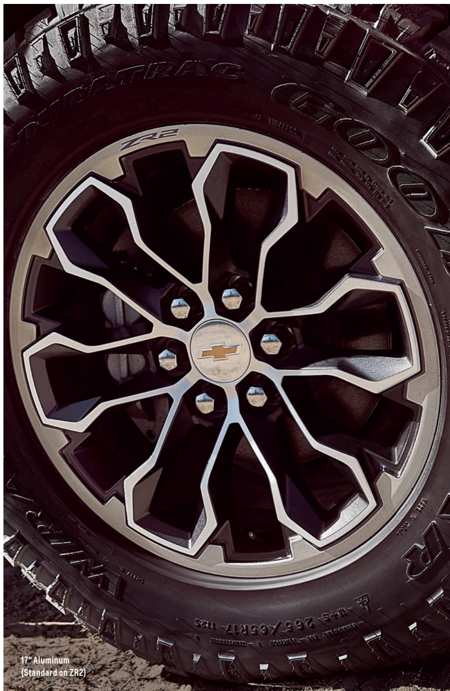
17" Aluminum (Standard on ZR2)