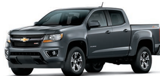
CYBER GRAY METALLIC 1