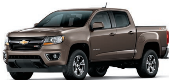
BROWNSTONE METALLIC 1