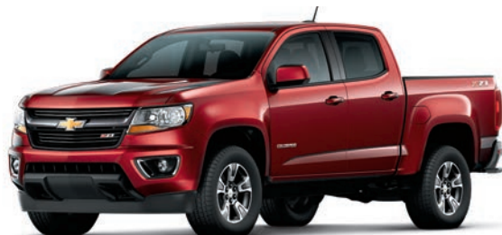
CAJUN RED TINTCOAT 1,3,4