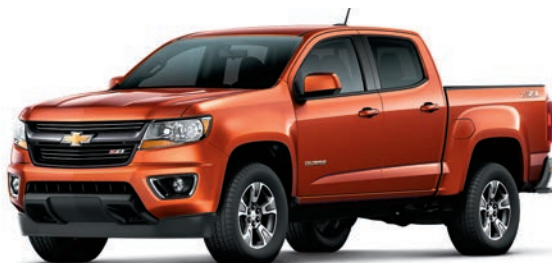
BURNING HOT METALLIC 2