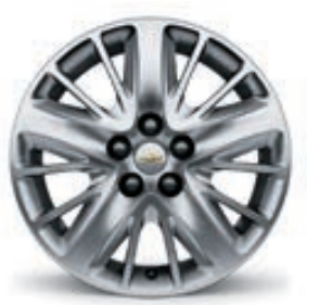
18" Steel with Fascia-Spoke Wheel Cover (Standard on LS)