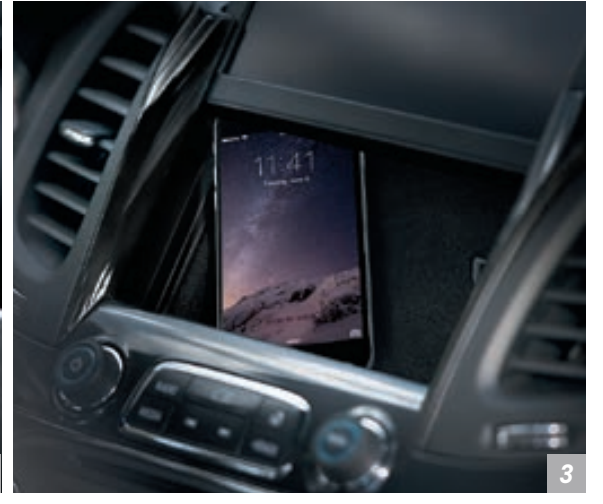
\underline{1} \ MyLink \ functionality \ varies \ by \ model. \ Full \ functionality \ requires \ compatible \ Bluetooth \ and \ smartphone, \ and \ USB \ connectivity \ for \ some \ devices. \ \underline{2} \ Visit \ my. chevrolet. \ com/learn \ for \ vehicle \ and \ smartphone \ compatibility. \ \underline{3} \ Not \ compatible \ with \ all \ devices.