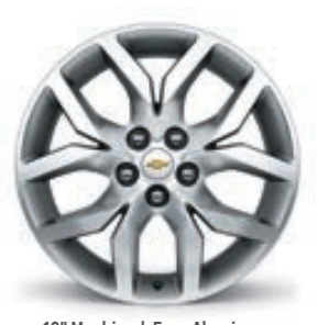
19" Machined-Face Aluminum (Standard on Premier)