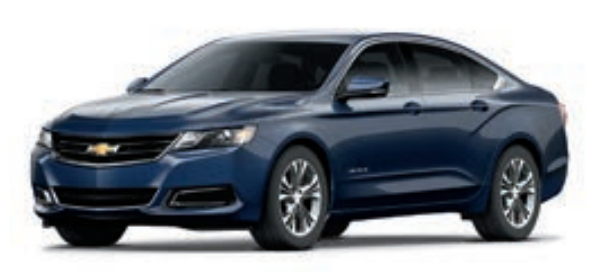
BLUE VELVET METALLIC