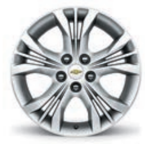
18" Painted-Aluminum (Standard on LT)