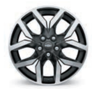
19" Special Midnight Edition with Black-Painted Pockets \mbox{(Available on LT and Premier)}^2