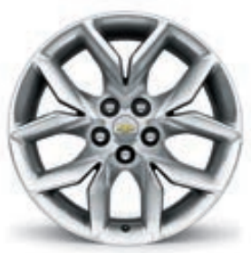
19" Painted-Aluminum (Available on LT)<sup>3</sup>