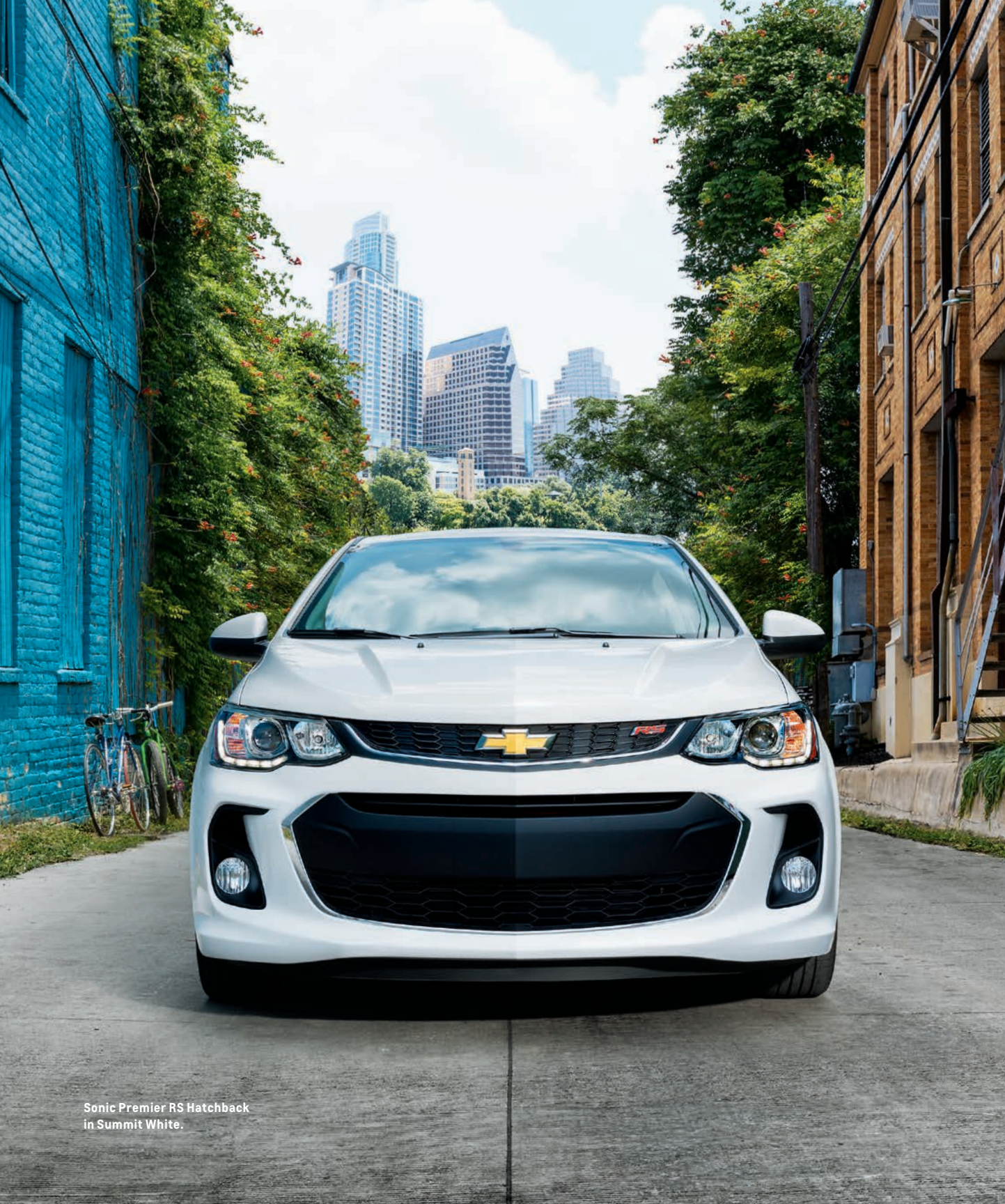
Sonic Premier RS Hatchback in Summit White.

The 2017 Sonic combines a bundle of exciting features, preparing you for all the good things in life. For starters, Sonic is available in either hatchback or sedan with a full spectrum of color choices. Outside, there's a fully redesigned front fascia with signature LED daytime running lamps and new taillamps. Inside, you'll discover an info-packed gauge cluster, an available heated steering wheel 1 and new ways to connect your smart devices.