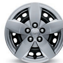
15" Steel with Bolt-On Wheel Cover (Standard on LS)