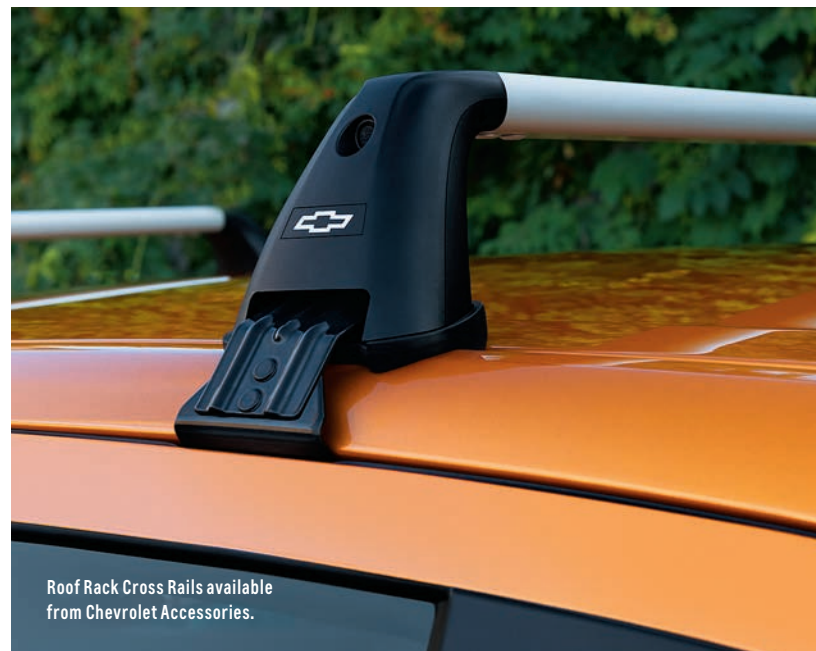
Roof Rack Cross Rails available from Chevrolet Accessories.