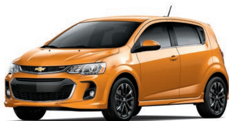
ORANGE BURST METALLIC 1,2