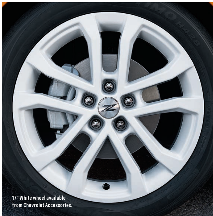
17" White wheel available from Chevrolet Accessories.