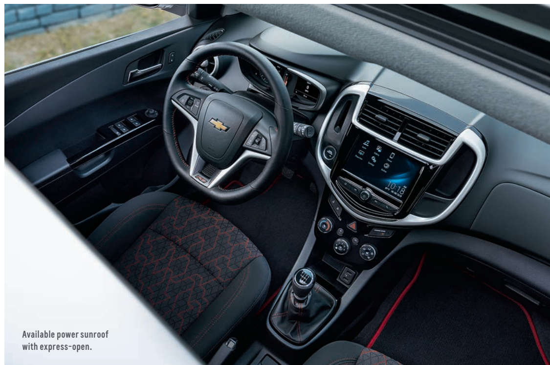
Available power sunroof with express-open.