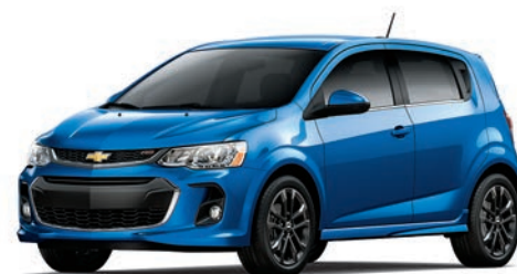
KINETIC BLUE METALLIC 2