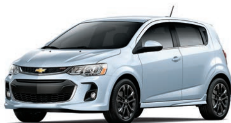
ARCTIC BLUE METALLIC