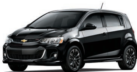
MOSAIC BLACK METALLIC