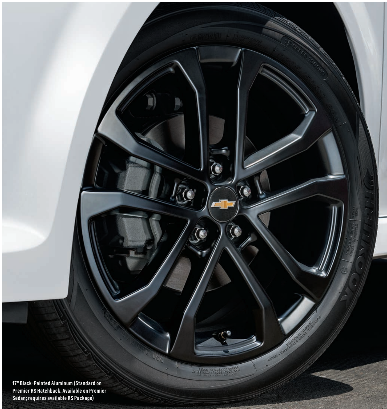
17" Black-Painted Aluminum (Standard on Premier RS Hatchback. Available on Premier Sedan; requires available RS Package)