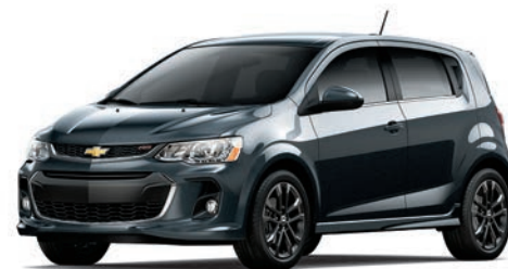
NIGHTFALL GRAY METALLIC