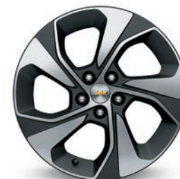
17" Painted-Aluminum (Available on Premier Sedan with automatic transmission)