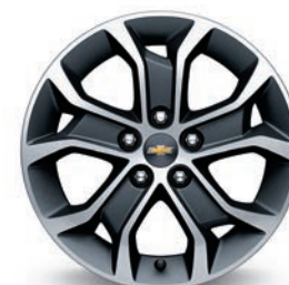
16" Aluminum (Standard on LT Hatchback. Available on LT Sedan; requires available RS Package)