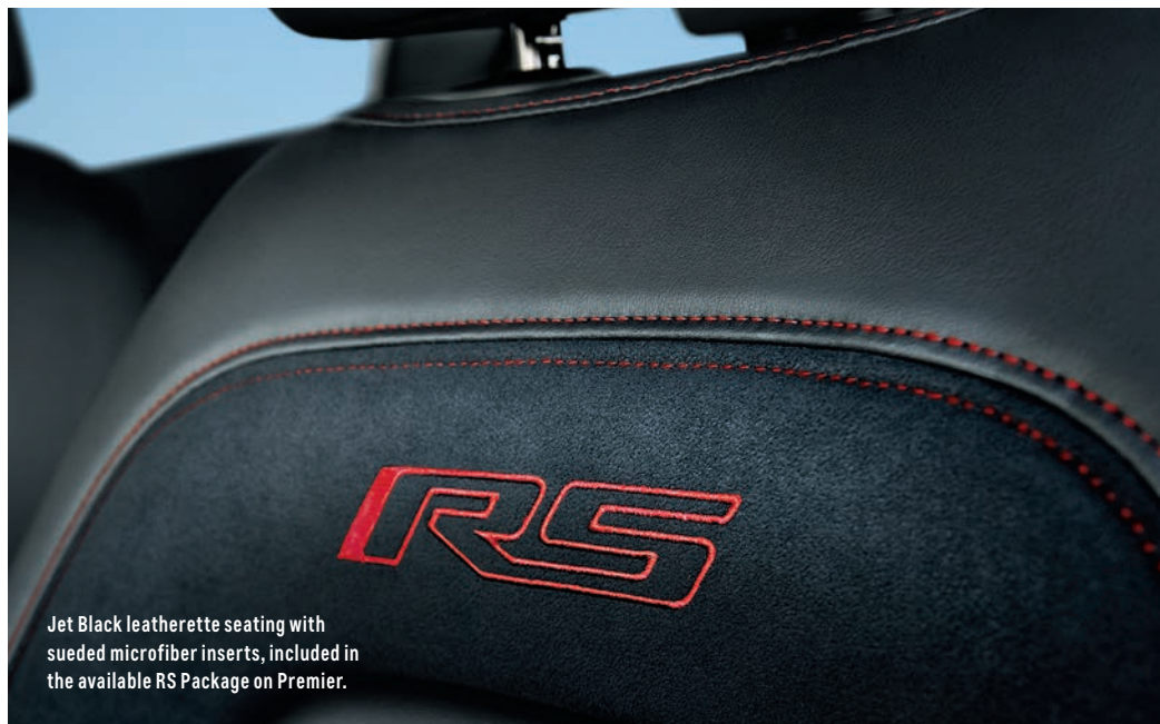
Jet Black leatherette seating with sueded microfiber inserts, included in the available RS Package on Premier.