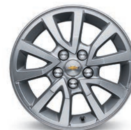
15" Aluminum (Standard on LT Sedan)