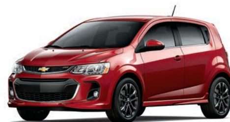
CAJUN RED TINTCOAT 2,3