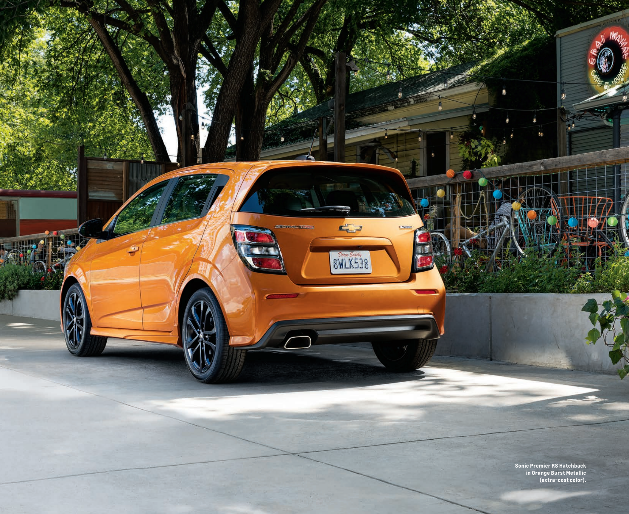
Sonic Premier RS Hatchback in Orange Burst Metallic (extra-cost color).